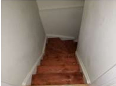
Pic. 18: Handrailing needed in basement stairwell