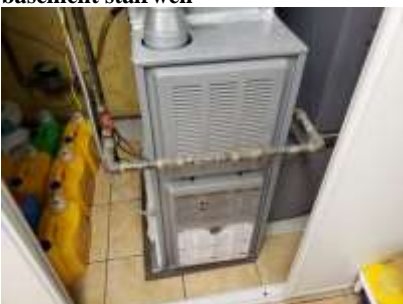
Pic. 22: Mid efficiency gas furnace