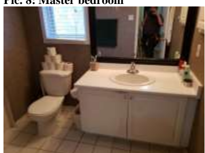
Pic. 10: 2<sup>nd</sup> floor bath