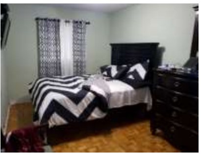
Pic. 9: Bed 2