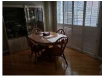
Pic. 13: Dining room