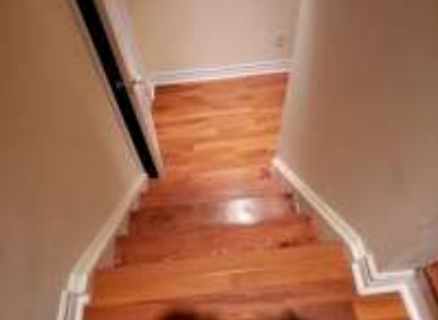
Pic. 19: Handrailing needed in basement stairwell