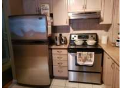
Pic. 15: Kitchen