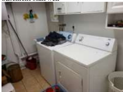
Pic. 21: Laundry