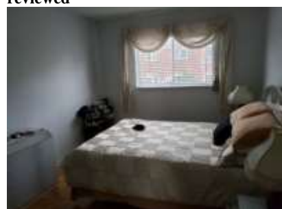
Pic. 8: Master bedroom