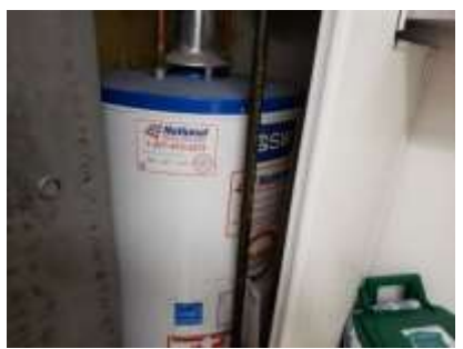
Pic. 23: Rental hot water tank