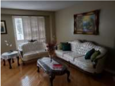
Pic. 12: Living room