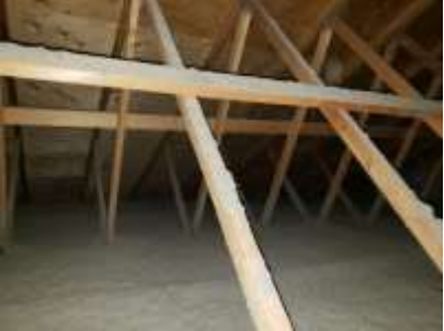
Pic. 6: Attic