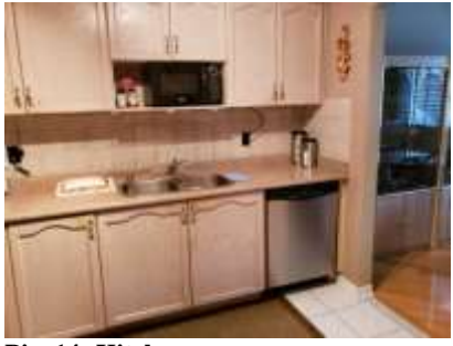
Pic. 14: Kitchen