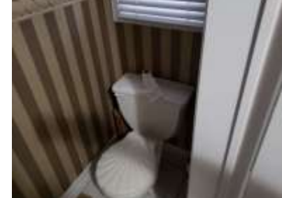
Pic. 16: Powder room