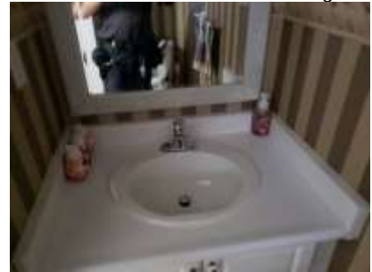
Pic. 17: Powder room