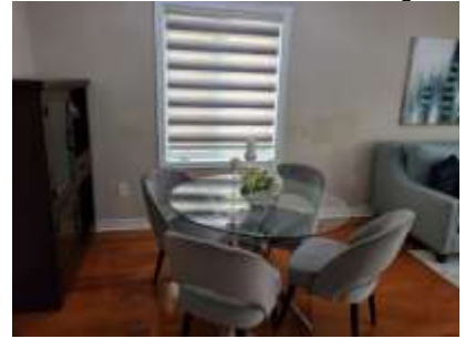
Pic. 18: Dining room