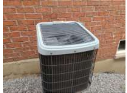
Pic. 3: Original AC unit