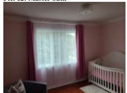
Pic. 15: Bed 3