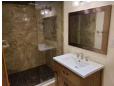
Pic. 26: Basement bath