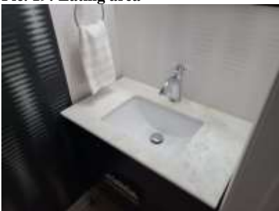
Pic. 22: Powder room