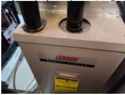
Pic. 31: Original gas furnace