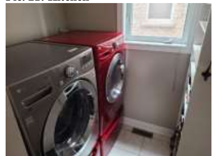
Pic. 24: Laundry