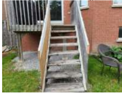
Pic. 5: Deck stairs could use leveling