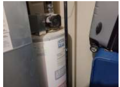
Pic. 30: Rental hot water tank