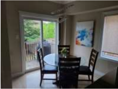
Pic. 19: Eating area