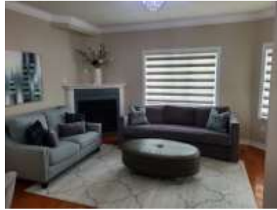
Pic. 17: Living room