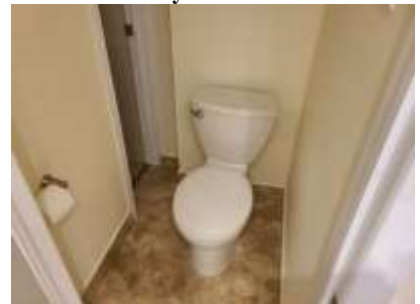
Pic. 27: Basement bath – toilet loose