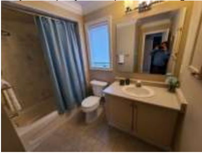
Pic. 16: 2 nd floor bath