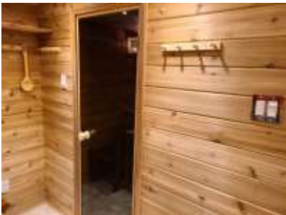
Pic. 28: Sauna