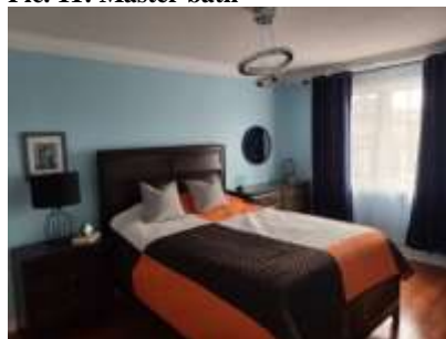
Pic. 14: Bed 2