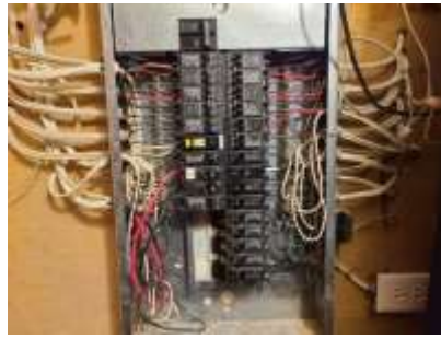
Pic. 32: 100 amp breaker panel