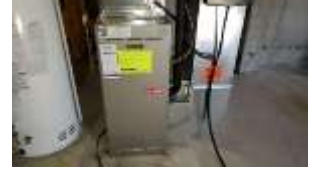
Pic. 36: Original gas furnace tank