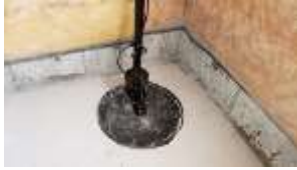
Pic. 34: Sump pump