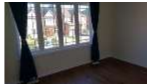
Pic. 15: Bed 2