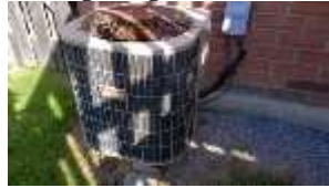
Pic. 6: Original AC unit