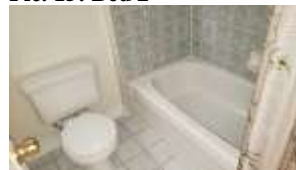
Pic. 19: 2 nd floor bath