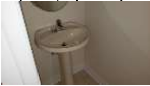
Pic. 29: Powder room