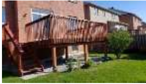
Pic. 5: Deck