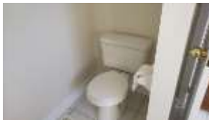
Pic. 13: Master bath