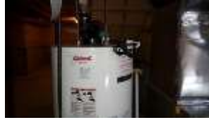
Pic. 35: Rental hot water tank