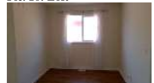
Pic. 20: Bed 4