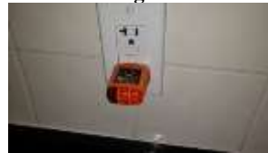
Pic. 27: 1 GFCI in kitchen not working