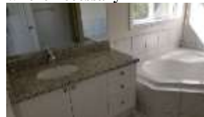
Pic. 11: Master bath