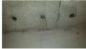
Pic. 31: 1 tie back hole in foundation signs of past water seepage – monitor or repair as necessary