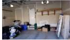
Pic. 3: Garage