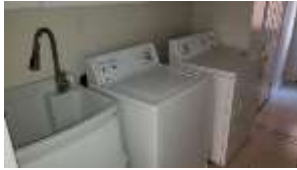
Pic. 30: Laundry