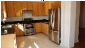
Pic. 25: Kitchen