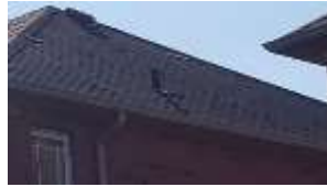
Pic. 2: Aging roof covering with a couple of broken / missing shingle tabs