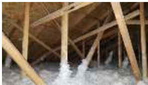
Pic. 9: Attic