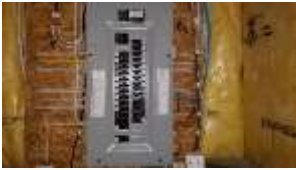
Pic. 37: 100 amp breaker panel