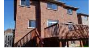
Pic. 4: Back view