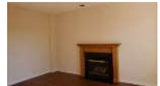
Pic. 24: Family room