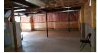
Pic. 32: Unfinished basement