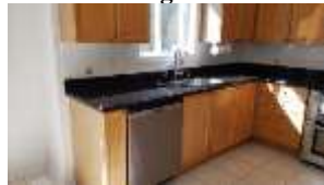
Pic. 26: Kitchen