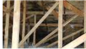
Pic. 7: Some apparent mould growth visible in attic, replace sheathing where necessary