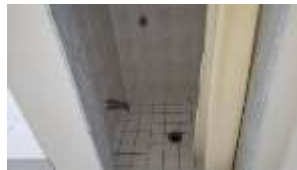
Pic. 14: Master bath