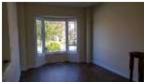
Pic. 21: Living room