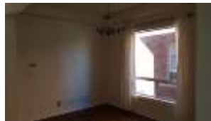
Pic. 22: Dining room