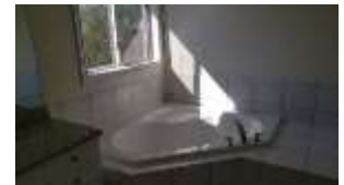
Pic. 12: Master bath