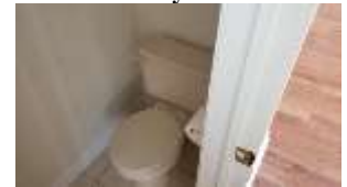
Pic. 28: Powder room