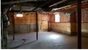
Pic. 33: Unfinished basement