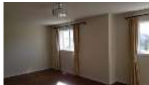
Pic. 10: Master bedroom