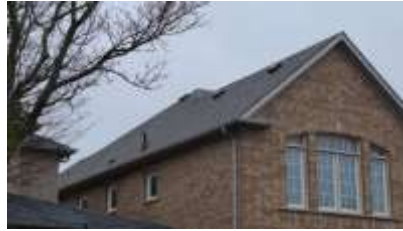
Pic. 2: New roof covering