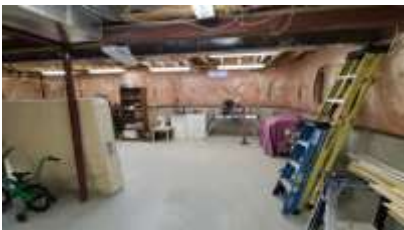
Pic. 28: Unfinished basement