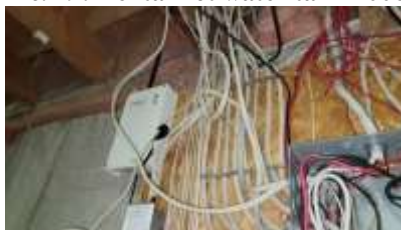
Pic. 32: Loose wires should be properly securing