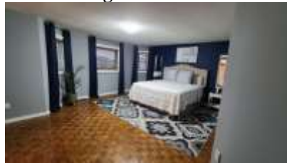
Pic. 8: Master bedroom