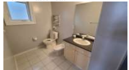
Pic. 12: Ensuite