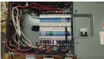
Pic. 31: 100 amp breaker panel