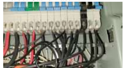
Pic. 33: Several breakers double tapped, corrected accordingly