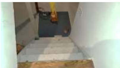
Pic. 34: Handrailing not installed in lower basement stairwell