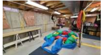
Pic. 27: Unfinished basement – some professional repairs to foundation walls