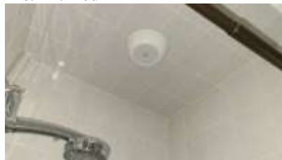
Pic. 14: Shower light battery operated – needs new batteries