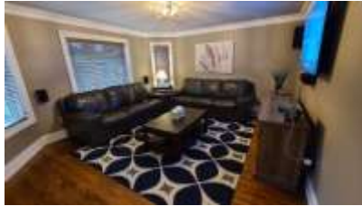
Pic. 20: Family room