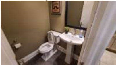
Pic. 25: Powder room