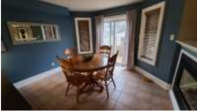
Pic. 22: Eating area