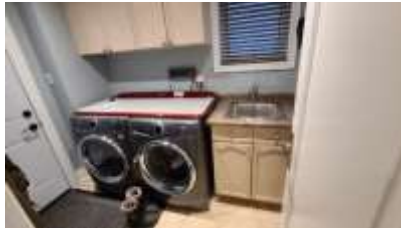
Pic. 26: Laundry