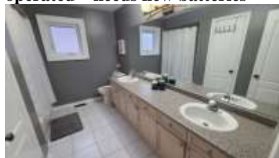
Pic. 17: 2 nd floor bath