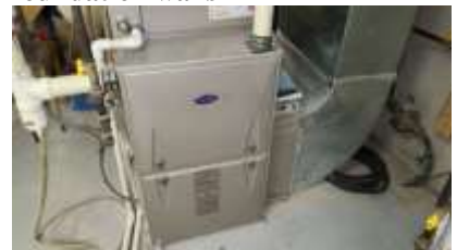
Pic. 30: Gas furnace 2017