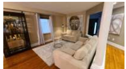
Pic. 18: Living room