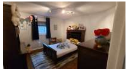
Pic. 15: Bed 3