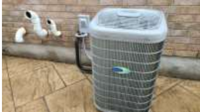
Pic. 4: AC unit 2017