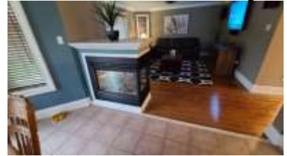
Pic. 21: Gas fireplace