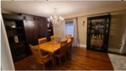
Pic. 19: Dining room