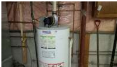
Pic. 29: Rental hot water tank 2006