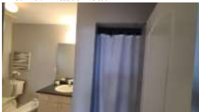
Pic. 13: Enuite