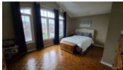
Pic. 11: Bed 2