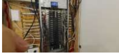
Pic. 50: 200 amp breaker panel