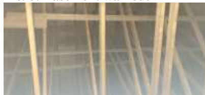
Pic. 11: Attic