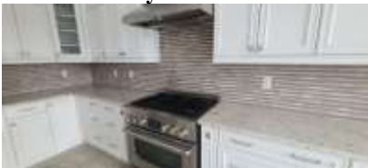
Pic. 31: Kitchen