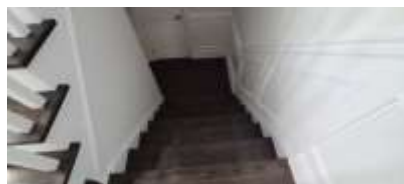
Pic. 38: Handrailing needed for upper basement stairwell