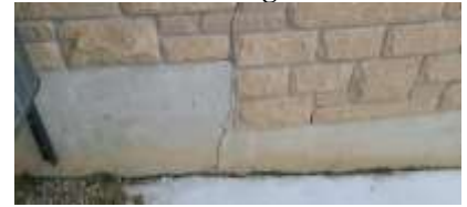
Pic. 6: Typical foundation crack