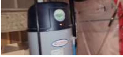
Pic. 49: Rental hot water tank 2014