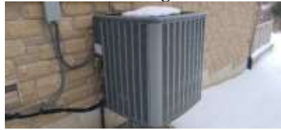
Pic. 5: AC unit 2015