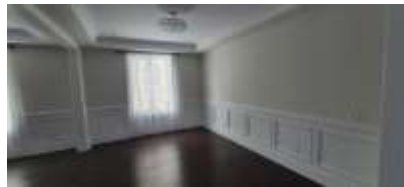
Pic. 26: Living room