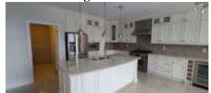
Pic. 30: Kitchen