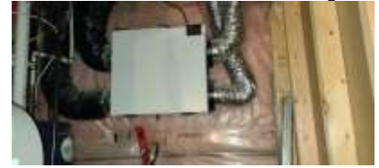
Pic. 48: HRV system