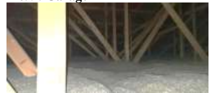
Pic. 12: Attic