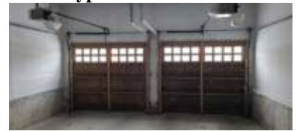
Pic. 9: Garage