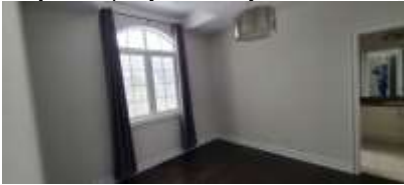
Pic. 22: Bedroom 4