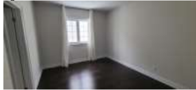
Pic. 23: Bedroom 5