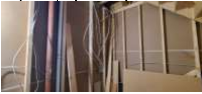
Pic. 46: Loose wiring in basement utility room needs to be properly secured