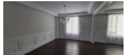
Pic. 27: Dining room