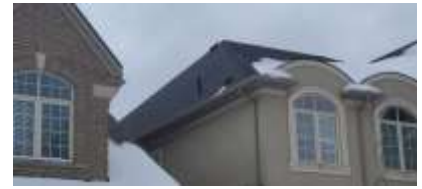
Pic. 3: Roof covering