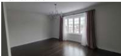
Pic. 13: Master bedroom