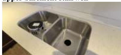
Pic. 41: Plumbing not connected for basement kitchen sink