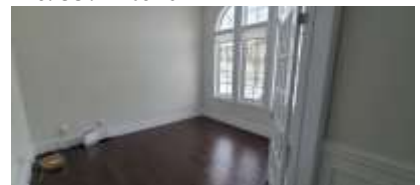
Pic. 36: Office