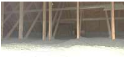
Pic. 10: Attic