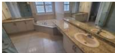
Pic. 14: Master bath