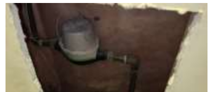
Pic. 45: Water main