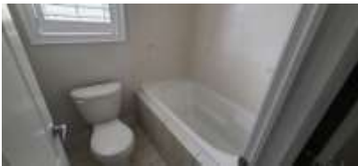
Pic. 25: Ensuite