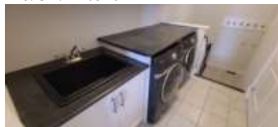
Pic. 35: Main floor laundry