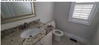
Pic. 37: Powder room