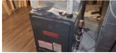
Pic. 47: Gas furnace 2014