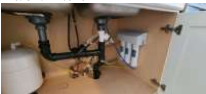
Pic. 34: RO water system disconnected