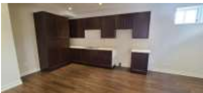
Pic. 40: Basement kitchen