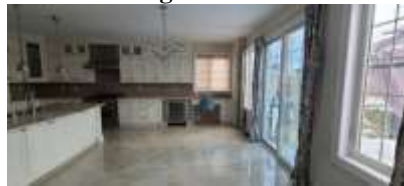
Pic. 29: Eating area