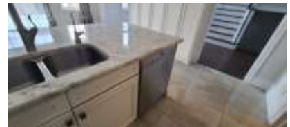
Pic. 33: Kitchen