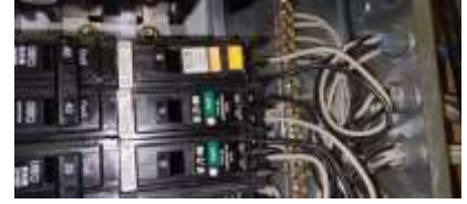
Pic. 51: Upper ARCF breaker will not trip and needs to be replaced