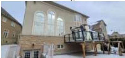
Pic. 7: Back view