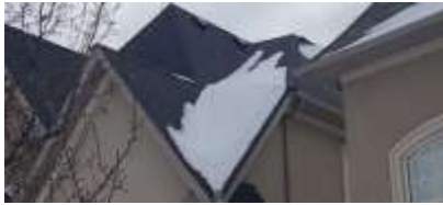
Pic. 4: Roof covering