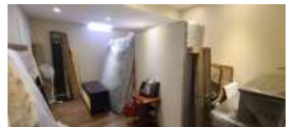
Pic. 42: Bedroom 6