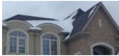
Pic. 2: Roof covering