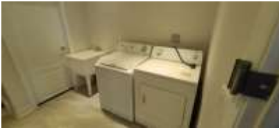
Pic. 52: Basement laundry