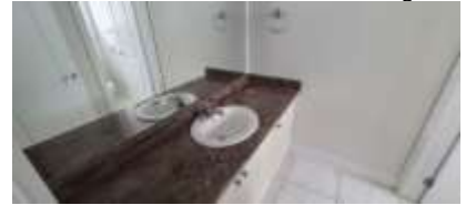
Pic. 24: Ensuite