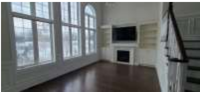
Pic. 28: Family room