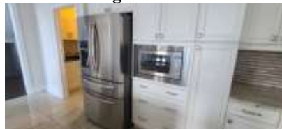
Pic. 32: Kitchen