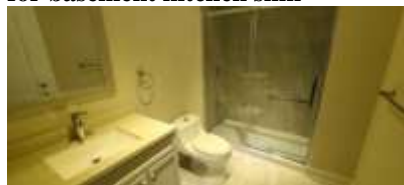
Pic. 44: Basement bathroom