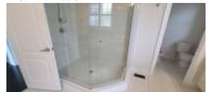
Pic. 15: Master bath