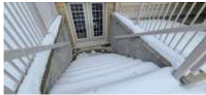
Pic. 8: Basement walkout