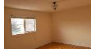
Pic. 12: Bed 2