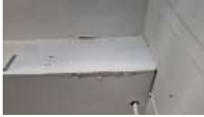
Pic. 9: Old water damage no active moisture in garage