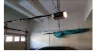
Pic. 8: Garage