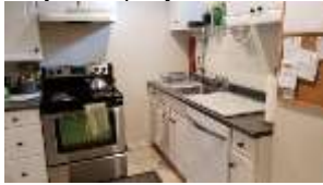
Pic. 33: Basement kitchen