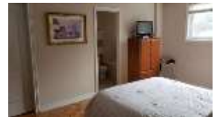
Pic. 24: Master bedroom