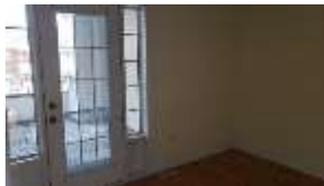
Pic. 14: Bed 4