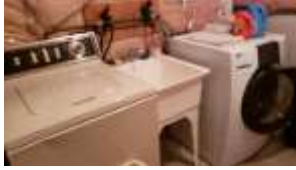
Pic. 37: Laundry