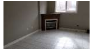
Pic. 20: Family room