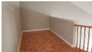
Pic. 18: Loft area