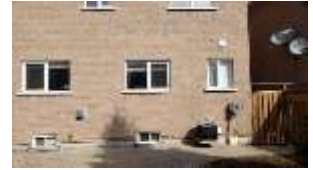
Pic. 4: Back view