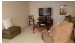
Pic. 31: Basement living / dining room