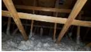
Pic. 10: Attic