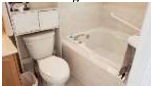
Pic. 25: Master bath