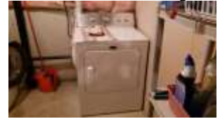
Pic. 36: Laundry