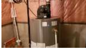
Pic. 38: Rental hot water tank