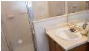
Pic. 26: Master bath