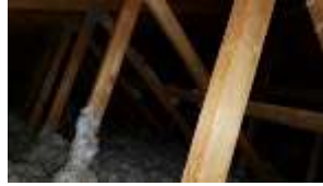
Pic. 11: Attic