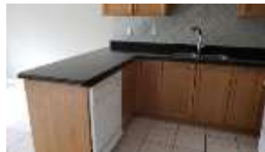
Pic. 23: Kitchen