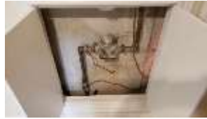
Pic. 35: Water main