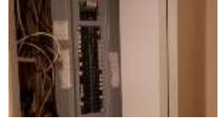
Pic. 40: 200 amp main breaker panel