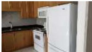
Pic. 22: Kitchen