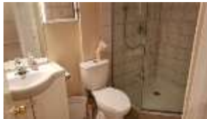
Pic. 30: Basement bath