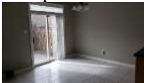
Pic. 21: Eating area