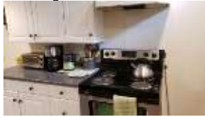
Pic. 34: Basement kitchen