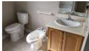
Pic. 15: 2nd floor bath