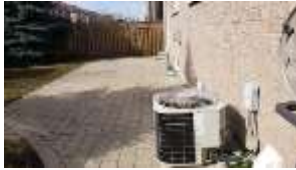
Pic. 5: Rear patio