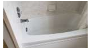
Pic. 16: 2nd floor bath