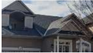
Pic. 2: Updated roof covering