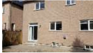
Pic. 3: Back view