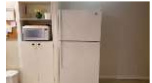
Pic. 32: Basement kitchen