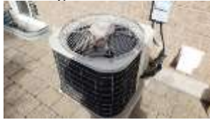
Pic. 6: AC unit