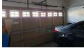
Pic. 7: Garage