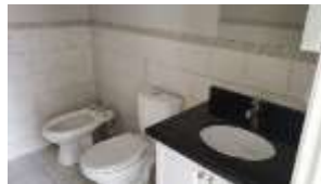
Pic. 27: Powder room