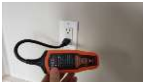
Pic. 17: GFCI defective and needs replacement