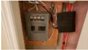
Pic. 41: 60 amp pony panel