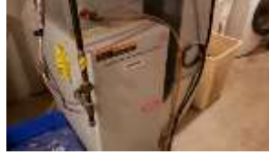
Pic. 39: Original gas furnace