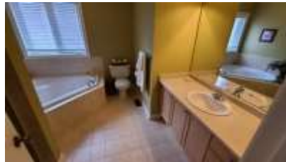
Pic. 8: Master bath