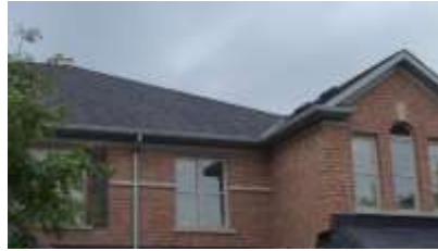
Pic. 2: Original roof covering