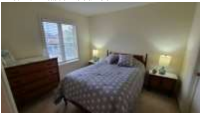
Pic. 10: Bed 2