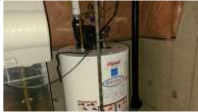
Pic. 20: Water heater 2020