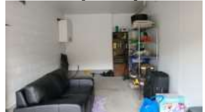
Pic. 24: Garage