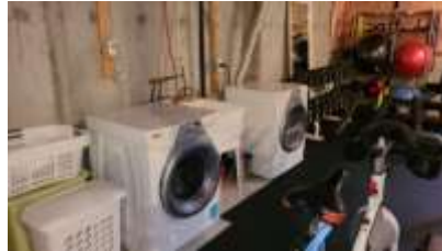
Pic. 23: Laundry