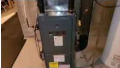
Pic. 19: Gas furnace 2007