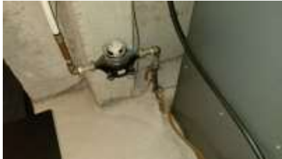
Pic. 22: Water main