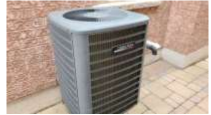
Pic. 3: AC unit 2007