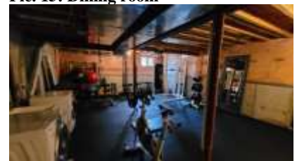
Pic. 18: Unfinished basement