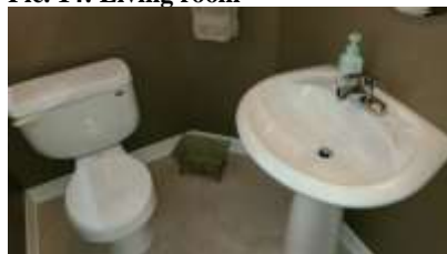
Pic. 17: Powder room