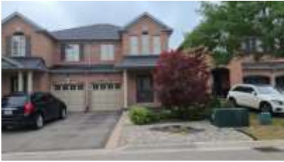
Pic. 1: Front view