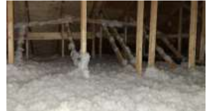
Pic. 6: Attic