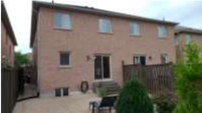
Pic. 4: Back view