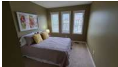
Pic. 11: Bed 3