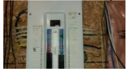
Pic. 21: 100 amp breaker panel