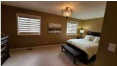
Pic. 7: Master bedroom