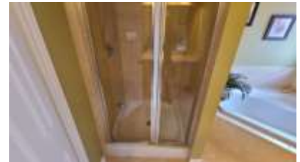
Pic. 9: Master bath