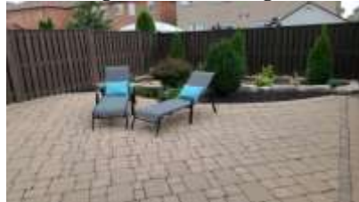
Pic. 5: Patio