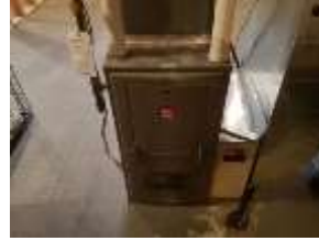
Pic. 27: High efficiency gas furnace 2016