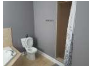
Pic. 11: Master bath