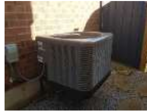
Pic. 3: AC unit 2016