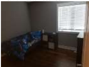
Pic. 13: Bed 3