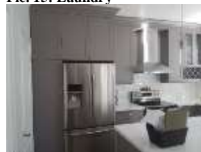
Pic. 19: Kitchen