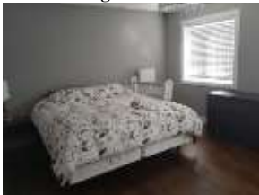
Pic. 9: Master bedroom