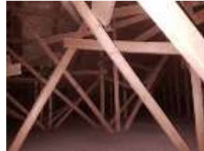
Pic. 7: Attic