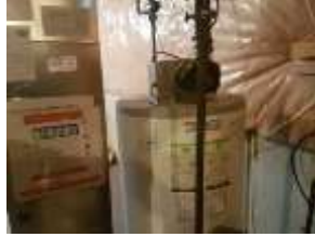
Pic. 26: Rental hot water tank