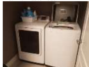
Pic. 15: Laundry