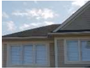
Pic. 2: Repaired roof covering