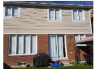
Pic. 4: Backview