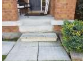
Pic. 6: Front step uneven rise