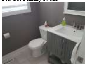
Pic. 22: Powder room