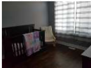
Pic. 14: Bed 4