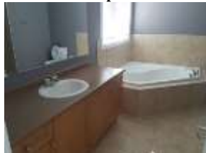
Pic. 10: Master bath