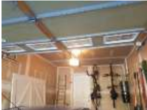
Pic. 5: Garage