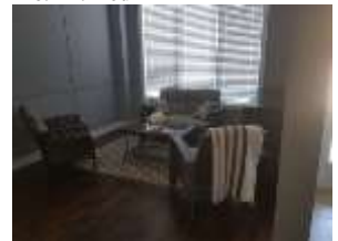
Pic. 16: Living room