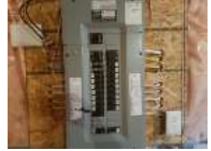
Pic. 28: 100 amp breaker panel with all copper wire