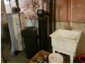
Pic. 25: Water softener