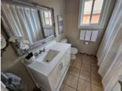
Pic. 19: 2 nd floor bathroom