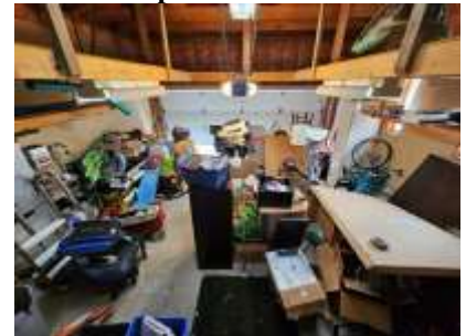
Pic. 9: Garage