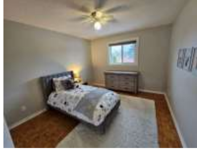
Pic. 17: Bedroom 3