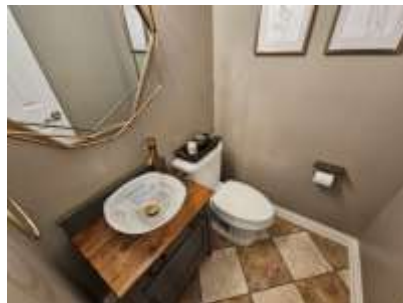
Pic. 29: Powder room