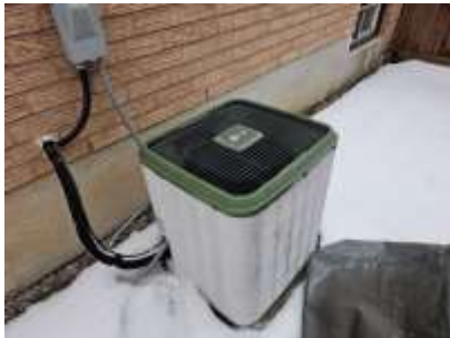
Pic. 7: AC unit older