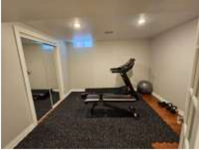
Pic. 31: Bedroom 5