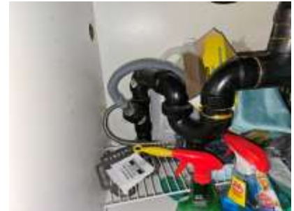
Pic. 27: Dishwasher drain installed improperly after P trap