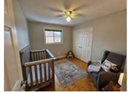
Pic. 18: Bedroom 4