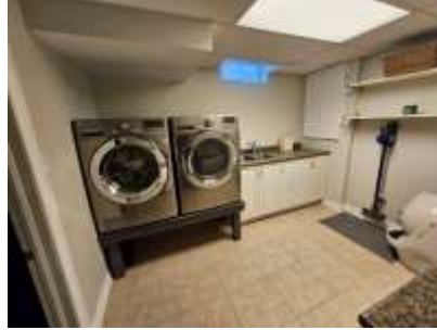
Pic. 32: Laundry