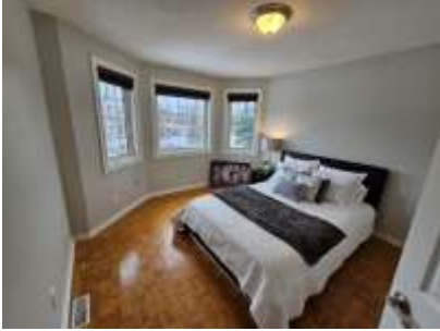
Pic. 16: Bedroom 2