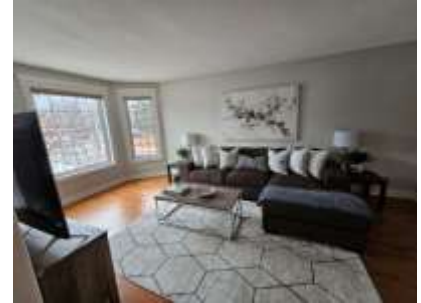
Pic. 21: Living room