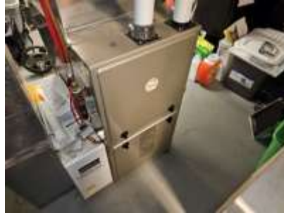
Pic. 35: Gas furnace 2015