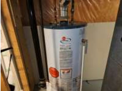
Pic. 34: Rental hot water tank 2010