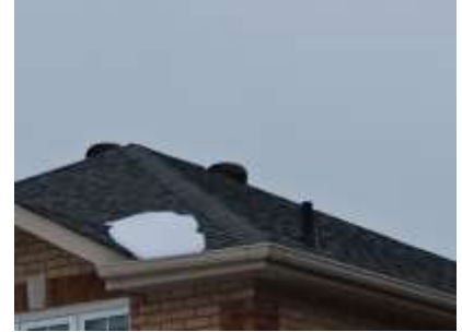
Pic. 3: Updated roof covering