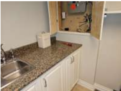
Pic. 40: Counter blocking proper access to the panel