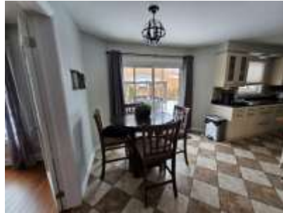
Pic. 23: Eating area