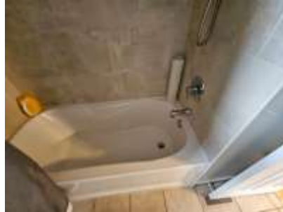
Pic. 20: 2 nd floor bathroom