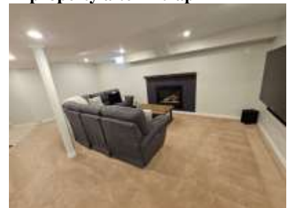
Pic. 30: Rec room