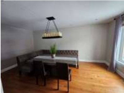
Pic. 22: Dining room