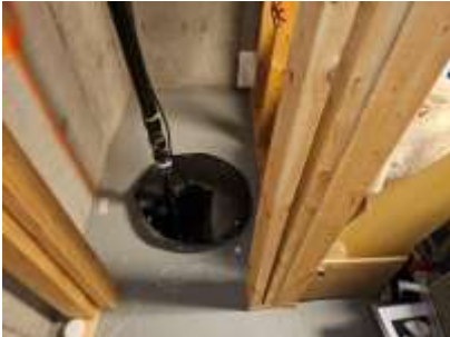
Pic. 37: Sump pump