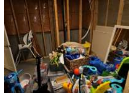
Pic. 36: Unfinished storage room