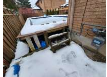
Pic. 6: Deck step are improper and unsafe – trip hazard