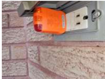
Pic. 8: Rear GFCI outlet won't trip