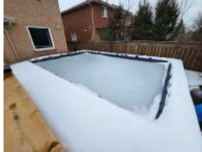
Pic. 5: Pool – closed