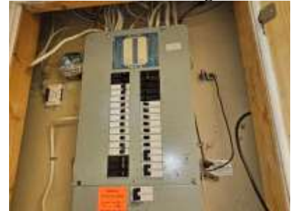
Pic. 39: 100 amp breaker panel