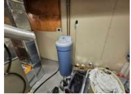
Pic. 33: Water softener