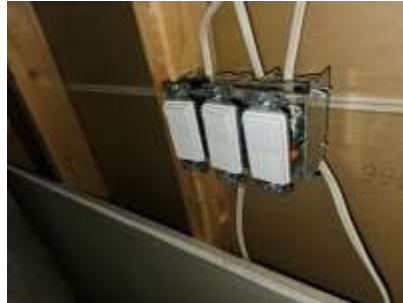
Pic. 38: 1 light switch not properly attached and cover plate missing