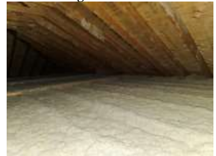
Pic. 12: Attic