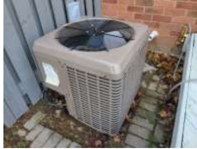
Pic. 5: AC unit 2018