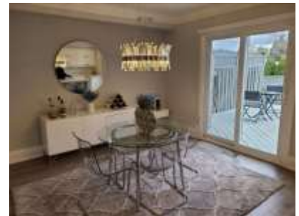
Pic. 15: Eating area