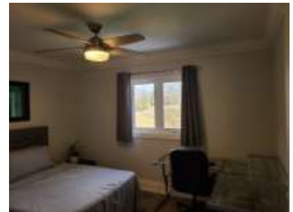
Pic. 12: Bed 3