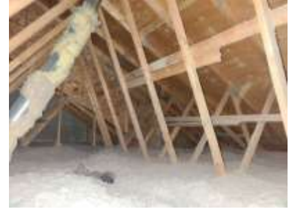
Pic. 6: Attic