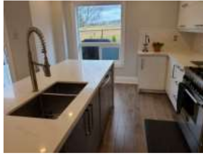
Pic. 17: Kitchen