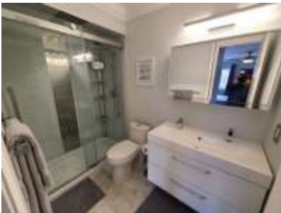
Pic. 10: Master bath