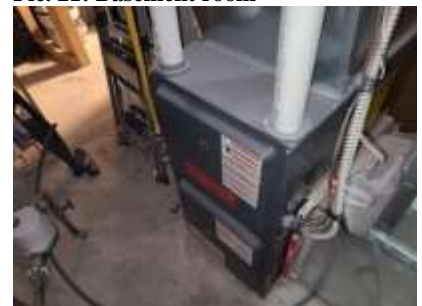
Pic. 24: Gas furnace 2018