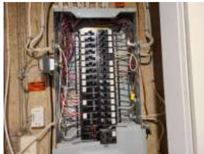
Pic. 26: 100 amp breaker panel