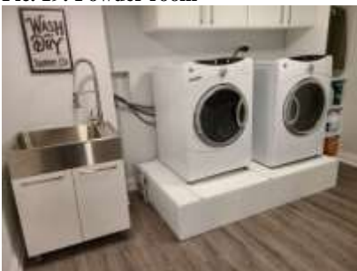
Pic. 22: Laundry