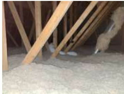
Pic. 8: Attic – vinyl vent pipe should be insulated