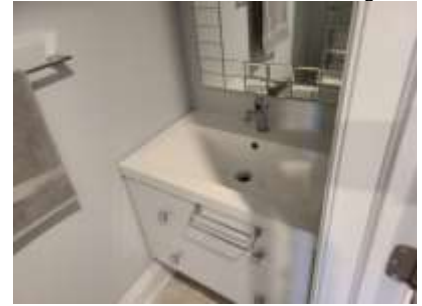
Pic. 18: Powder room