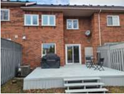
Pic. 4: Back vie