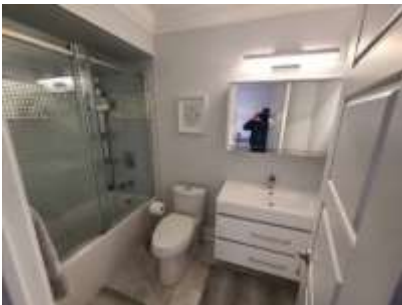
Pic. 13: 2 nd floor bath