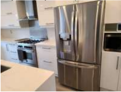
Pic. 16: Kitchen