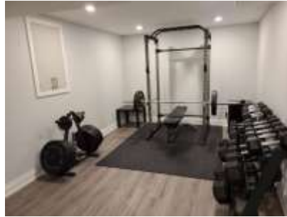
Pic. 20: Rec room