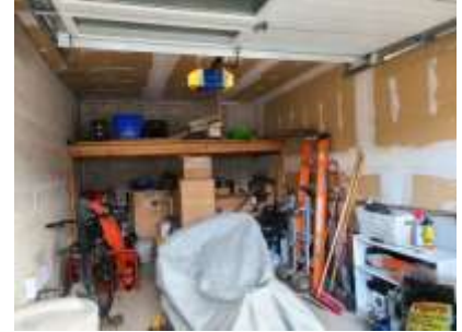
Pic. 3: Garage