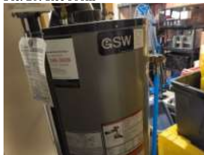
Pic. 23: Rental hot water tank 2018