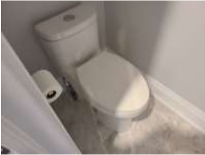
Pic. 19: Powder room