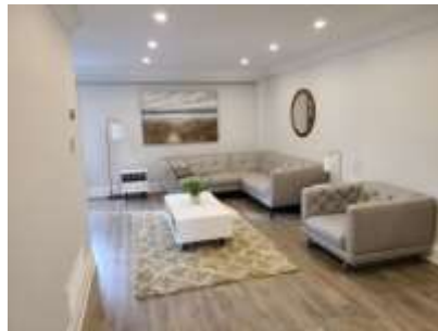
Pic. 14: Living room