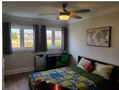
Pic. 11: Bed 2