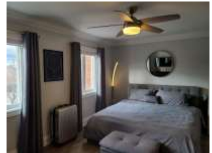
Pic. 9: Master bedroom