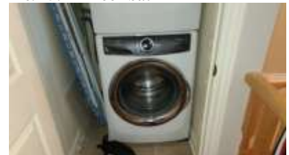
Pic. 18: Laundry