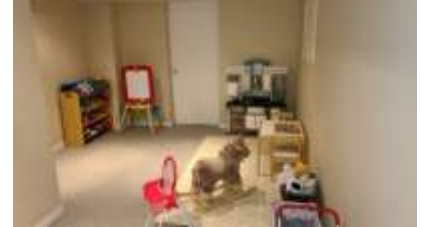
Pic. 24: Rec room