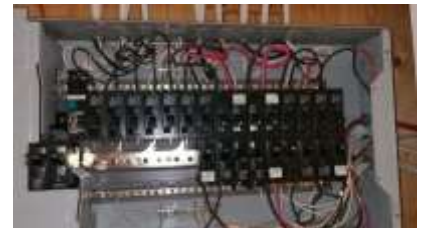
Pic. 30: 100 amp breaker panel