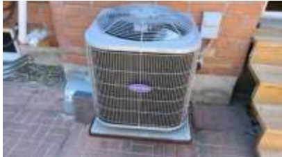
Pic. 4: AC unit 2019