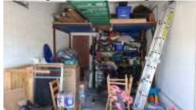
Pic. 5: Garage