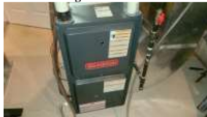
Pic. 29: Gas furnace 2018