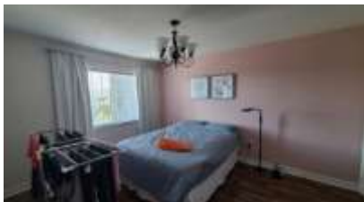
Pic. 13: Bed 2