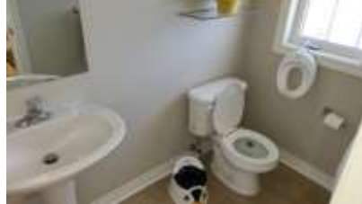
Pic. 23: Powder room