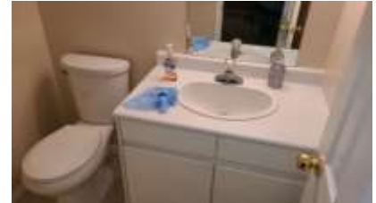
Pic. 27: Basement bath