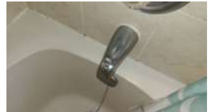
Pic. 12: Shower diverter seized, repair or replace as necessary