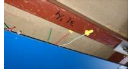
Pic. 6: Live wires in garage need to be placed in a proper junction box