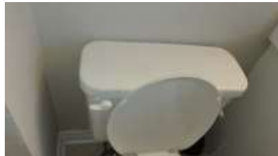
Pic. 11: Toilet flapper needs to be adjusted