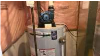
Pic. 28: Hot water tank 2019