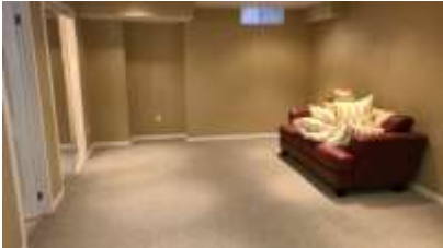
Pic. 25: Rec room