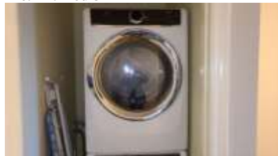
Pic. 17: Laundry