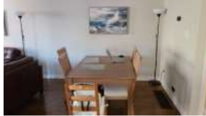
Pic. 20: Dining room