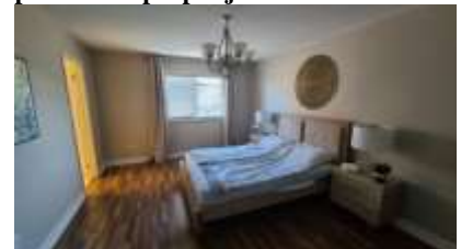
Pic. 9: Master bedroom