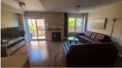
Pic. 19: Living room