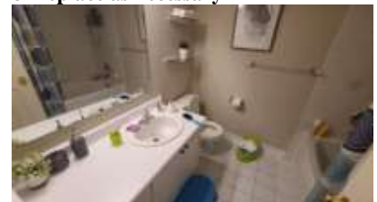
Pic. 15: 2 nd floor bath