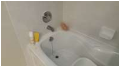
Pic. 16: 2 nd floor bath