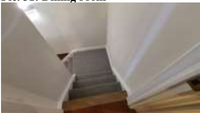
Pic. 34: Handrailing needed for basement stairwell