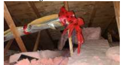
Pic. 12: Bathroom venting directly into the attic and should be vented to the outside