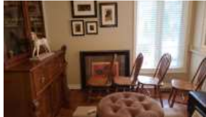
Pic. 23: In-Law suite: Dining room