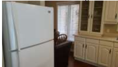
Pic. 26: In-Law suite: Kitchen