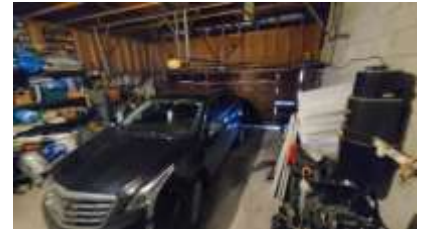
Pic. 9: Garage