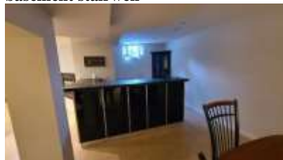
Pic. 38: Rec room