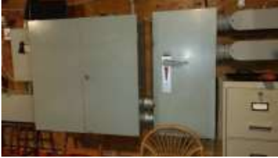
Pic. 43: 400 amp main electrical service