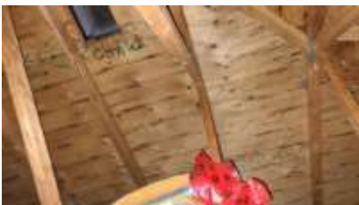
Pic. 13: Attic