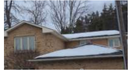
Pic. 3: Snow covered roof covering