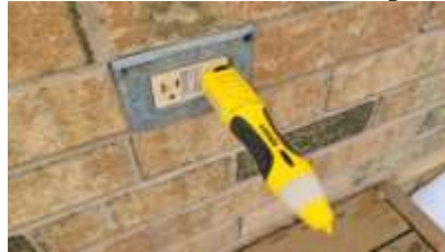
Pic. 5: Rear GFCI outlet needs a weatherproof covering and outlet needs to be replaced – won't trip