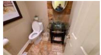
Pic. 33: Powder room