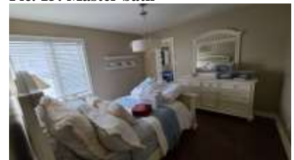
Pic. 18: Bed 3