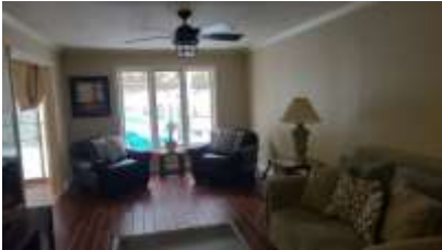
Pic. 22: In- Law suite: Living room