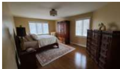
Pic. 14: Master bedroom