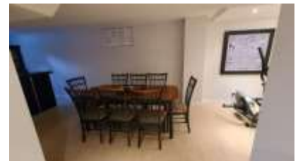
Pic. 39: Rec room