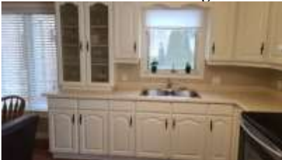
Pic. 25: In-Law suite: Kitchen