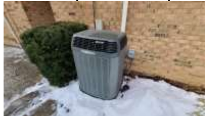
Pic. 8: AC unit 2006