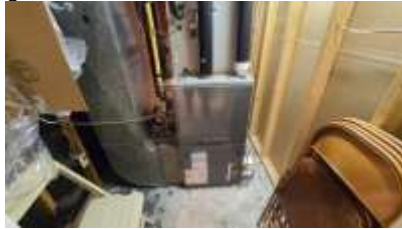
Pic. 41: Gas furnace 2006