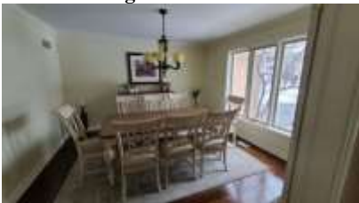
Pic. 31: Dining room