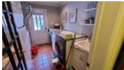
Pic. 32: Laundry