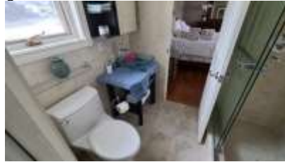
Pic. 20: Joint ensuite