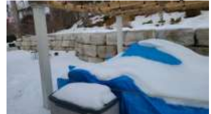
Pic. 6: Retaining wall