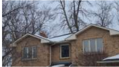
Pic. 2: Snow covered roof covering