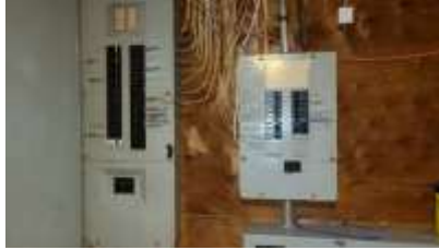
Pic. 44: 200 amp and 100 amp breaker panels