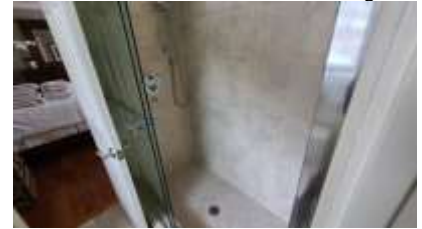
Pic. 21: Joint ensuite