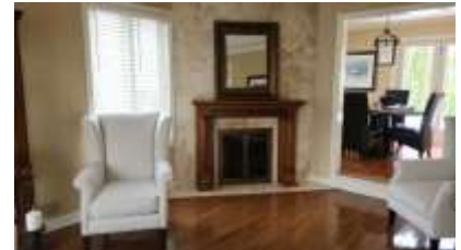
Pic. 27: Living room