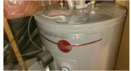
Pic. 42: Electric hot water tank 2015