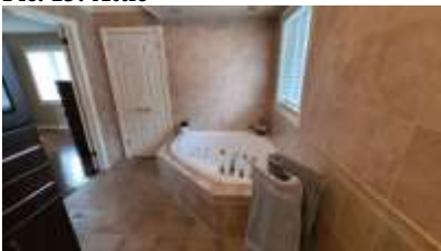
Pic. 16: Master bath