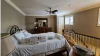
Pic. 19: Bed 4 – In-law suite