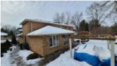
Pic. 7: Back view