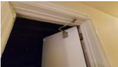
Pic. 10: Auto closer does not close door – adjust or replace