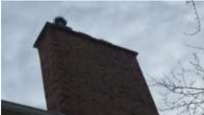
Pic. 4: Chimney