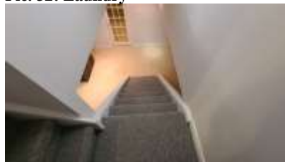
Pic. 35: Handrailing needed for basement stairwell