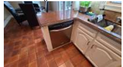
Pic. 30: Kitchen