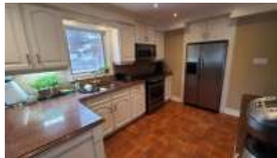
Pic. 29: Kitchen