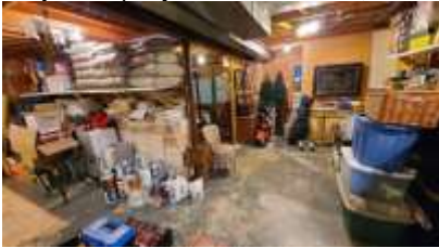
Pic. 40: Storage room