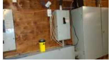
Pic. 45: Old electric furnace disconnect panels