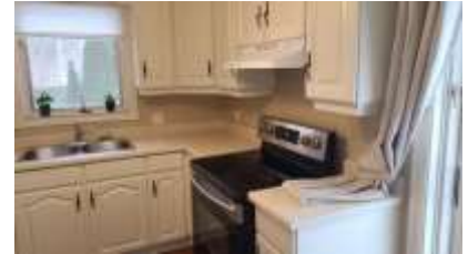
Pic. 24: In-Law suite: Kitchen