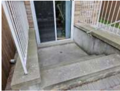
Pic. 5: Basement walkout