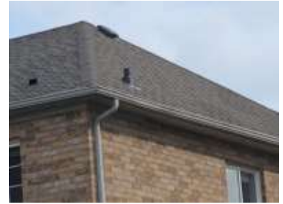
Pic. 3: Roof covering