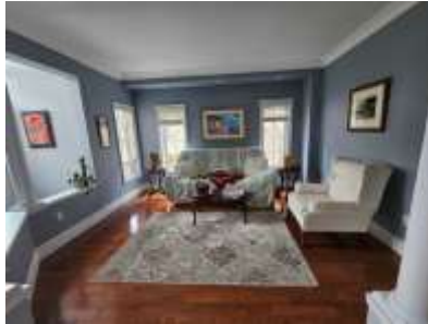
Pic. 17: Living room