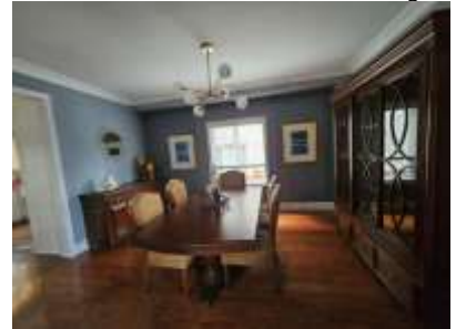
Pic. 18: Dining room