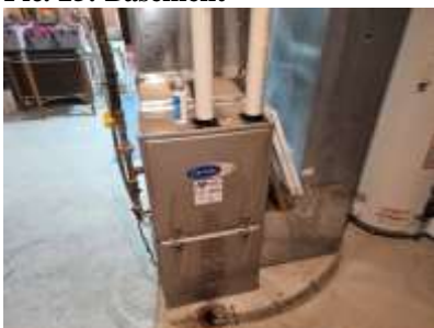
Pic. 28: Gas furnace 2018