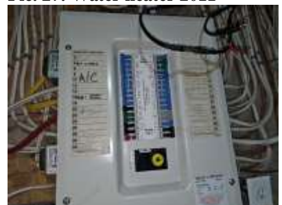
Pic. 30: 100 amp breaker panel