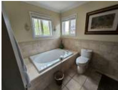
Pic. 11: Primary bathroom