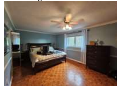
Pic. 9: Primary bedroom