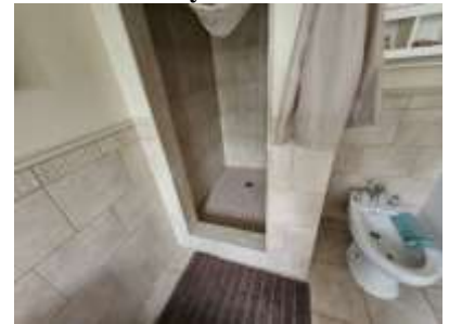
Pic. 12: Primary bathroom