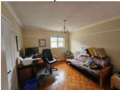
Pic. 13: Bedroom 2