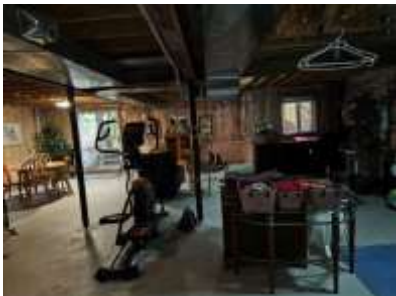
Pic. 25: Basement