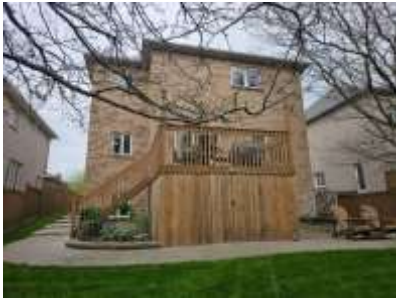
Pic. 4: Back view