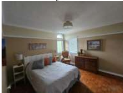
Pic. 14: Bedroom 3