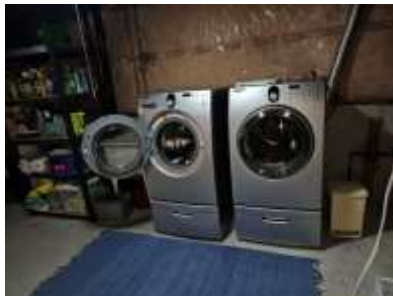
Pic. 26: Laundry