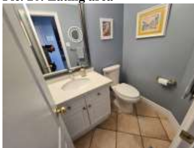
Pic. 23: Powder room