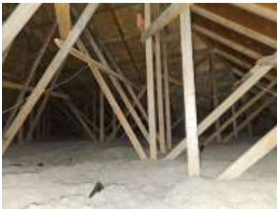
Pic. 7: Attic