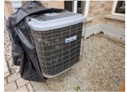
Pic. 6: Original AC