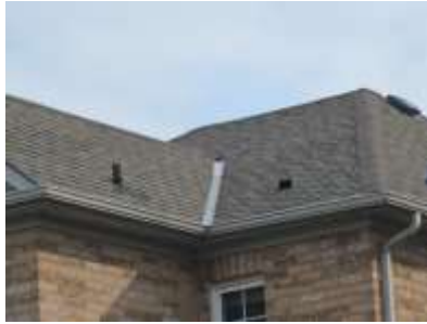
Pic. 2: Roof covering