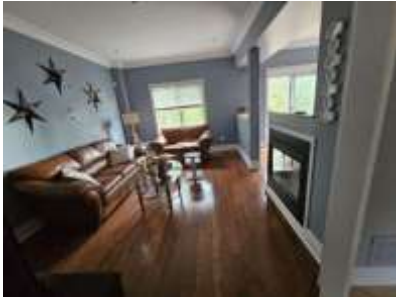
Pic. 19: Family room