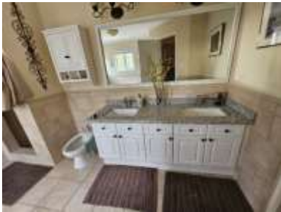
Pic. 10: Primary bathroom