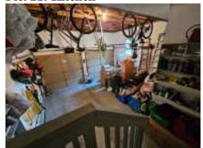
Pic. 24: Garage