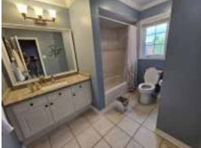
Pic. 16: 2 nd floor bathroom