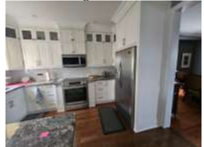
Pic. 21: Kitchen