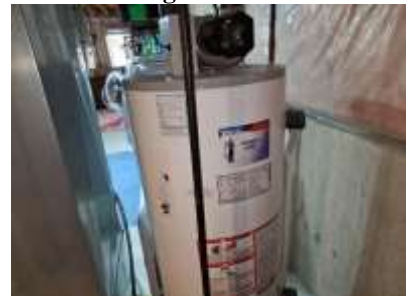
Pic. 27: Water heater 2011