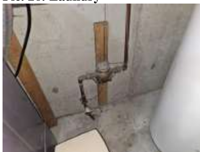
Pic. 29: Water main