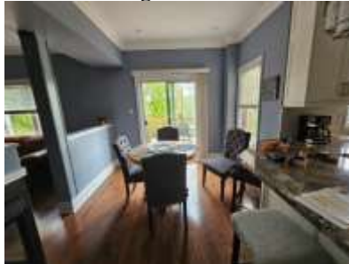
Pic. 20: Eating area