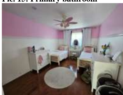
Pic. 18: Bedroom 3