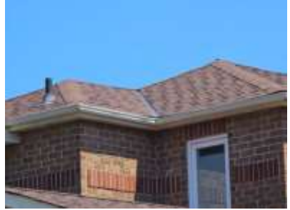
Pic. 4: Roof covering