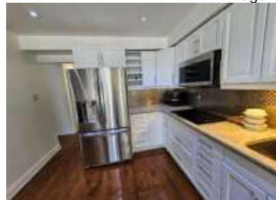
Pic. 30: Kitchen