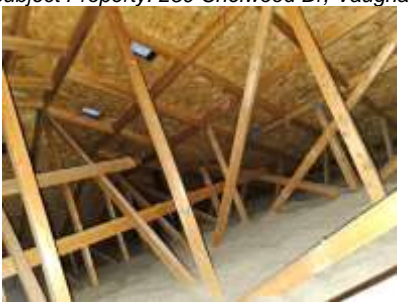
Pic. 13: Attic