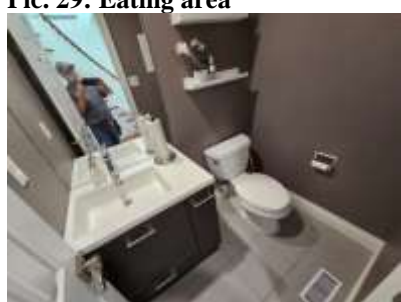
Pic. 32: Powder room