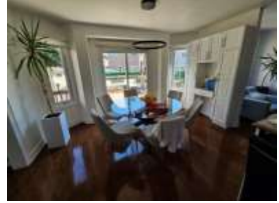
Pic. 29: Eating area