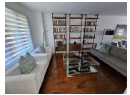
Pic. 26: Living room