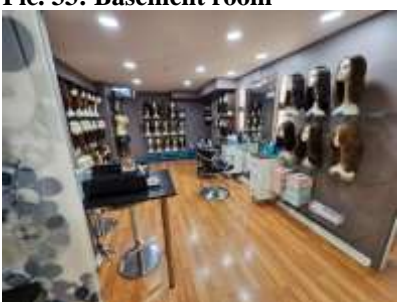
Pic. 36: Basement room