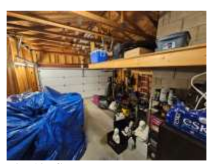
Pic. 10: Gargae