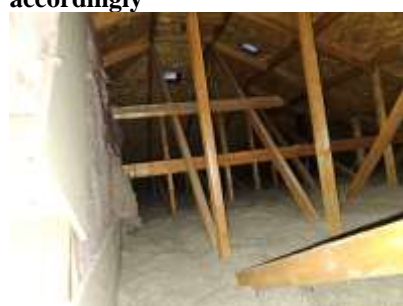
Pic. 12: Attic