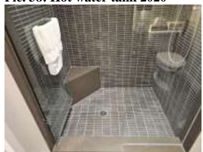
Pic. 41: Basement bathroom