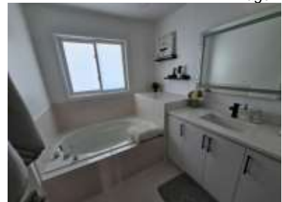
Pic. 15: Primary bathroom