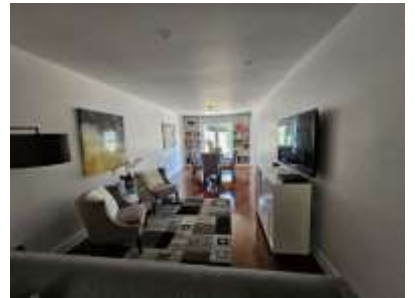
Pic. 27: Dining room