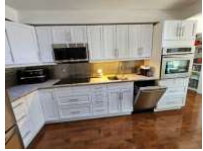
Pic. 31: Kitchen