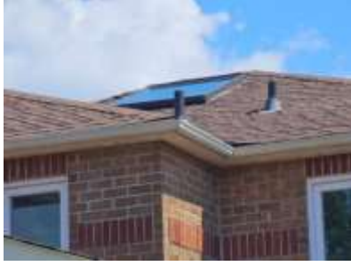
Pic. 2: Roof covering