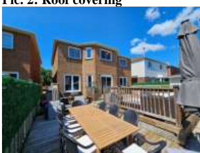
Pic. 5: Back view