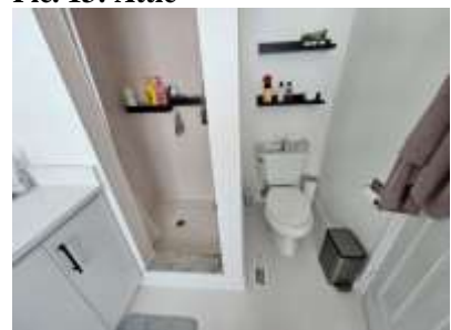
Pic. 16: Primary bathroom