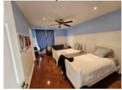
Pic. 19: Bedroom 4