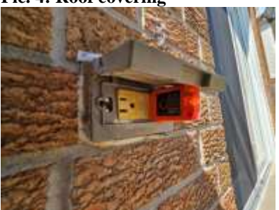
Pic. 7: Rear GFCI outlet will not trip and should be replaced