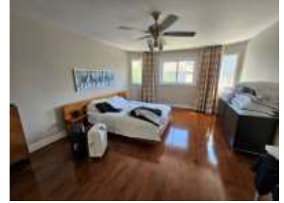
Pic. 14: Primary bedroom