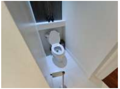
Pic. 22: 2<sup>nd</sup> floor bathroom