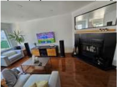
Pic. 28: Family room