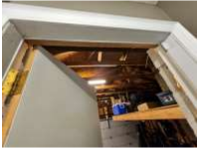
Pic. 11: Garage entry door has no auto closer and the wrong swing