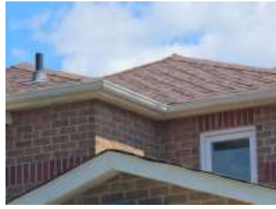
Pic. 3: Roof covering