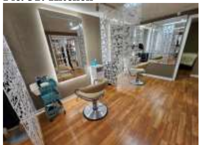
Pic. 34: Basement room