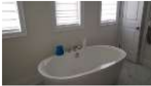
Pic. 9: Master bath