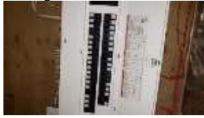
Pic. 34: 200 amp breaker panel