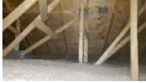
Pic. 6: Attic