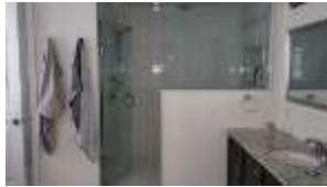
Pic. 10: Master bath