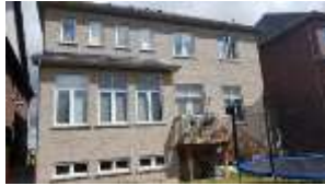
Pic. 2: Back view