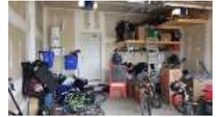
Pic. 4: Garage