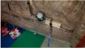
Pic. 33: Water main