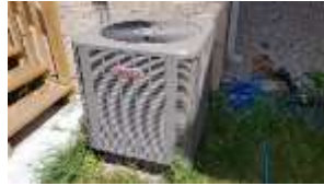
Pic. 3: AC unit