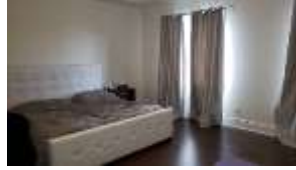
Pic. 7: Master bedroom