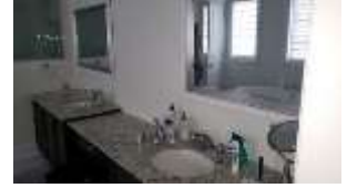
Pic. 8: Master bath