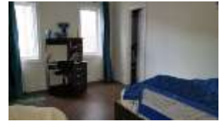
Pic. 12: Bed 2