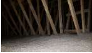
Pic. 5: Attic