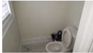
Pic. 11: Master bath