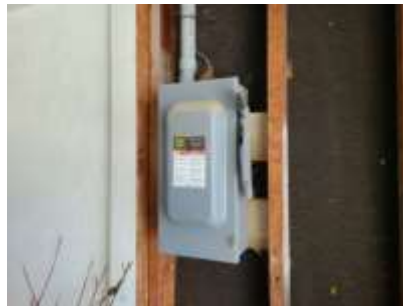
Pic. 8: Main power disconnect located in garage