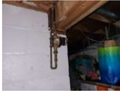
Pic. 29: Water main