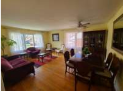
Pic. 16: Living / Dining room