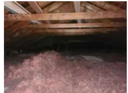
Pic. 9: Attic