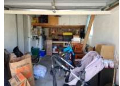
Pic. 6: Garage