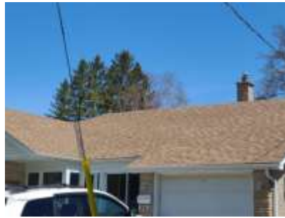
Pic. 2: Updated roof covering