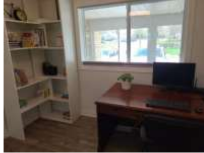
Pic. 17: Office