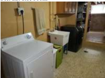
Pic. 25: Laundry