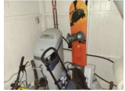
Pic. 30: Water softener