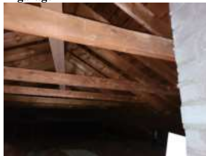
Pic. 11: Attic