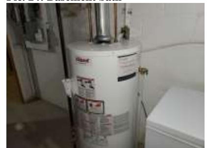
Pic. 27: Rental hot water tank 2020