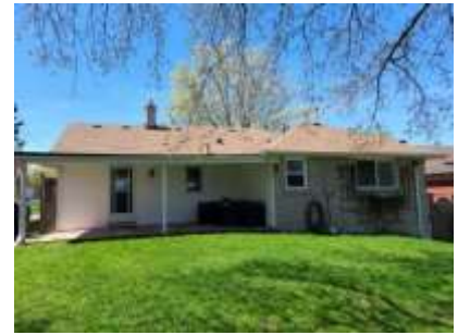
Pic. 3: Back view