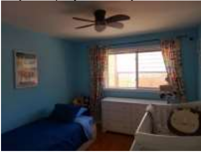
Pic. 13: Bed 2