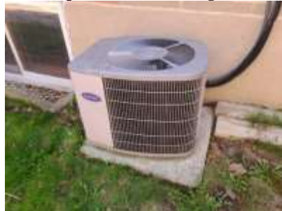
Pic. 5: AC unit 2005