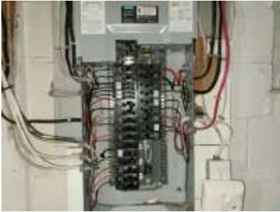
Pic. 31: 100 amp breaker panel with all copper wire