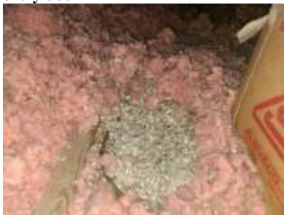
Pic. 10: Vermiculite insulation present