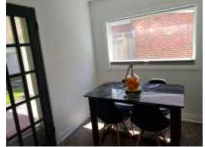
Pic. 18: Eating area