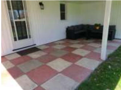
Pic. 4: Patio stones with a slight slope towards the foundation, recommended correction