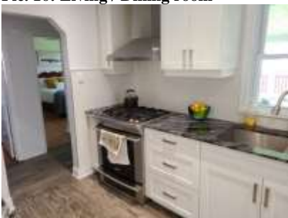
Pic. 19: Kitchen