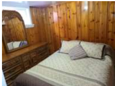
Pic. 23: Bed 3