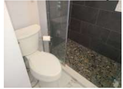
Pic. 15: Main bath