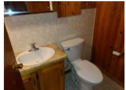
Pic. 24: Basement bath