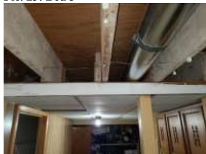
Pic. 26: Support beam in laundry room, recommend review for proper structural support