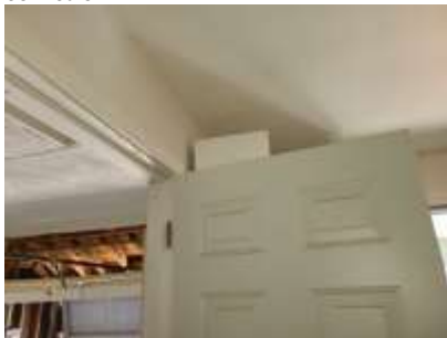
Pic. 7: Auto closer needed for garage entry door