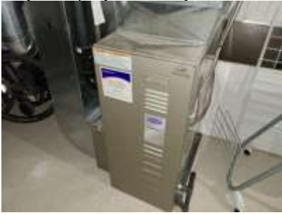
Pic. 28: Gas furnace 2005