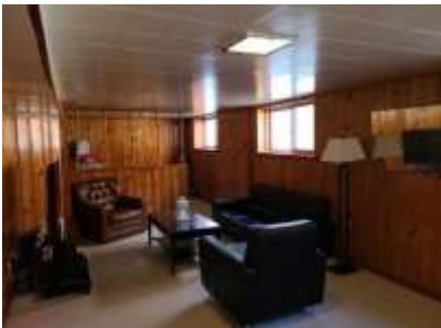
Pic. 22: Rec room