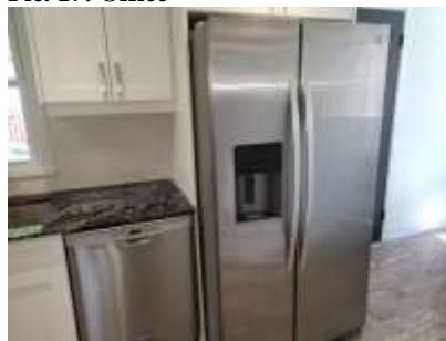
Pic. 20: Kitchen