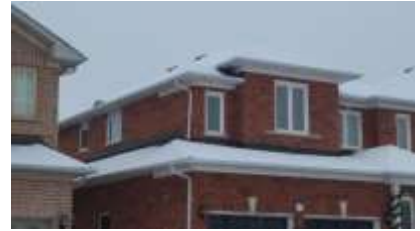
Pic. 3: Roof covering snow covered