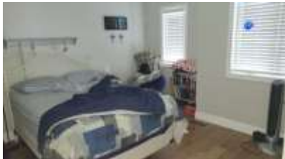
Pic. 13: Bed 3