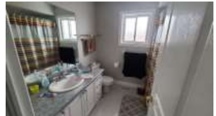
Pic. 15: 2 nd floor bath