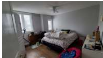
Pic. 14: Bed 4