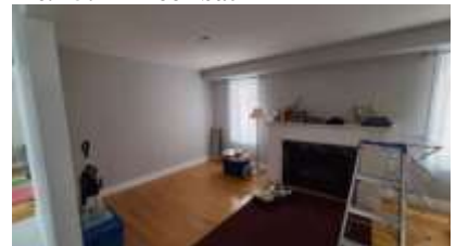
Pic. 18: living / dining room