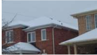
Pic. 2: Roof covering snow covered