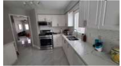
Pic. 21: Kitchen