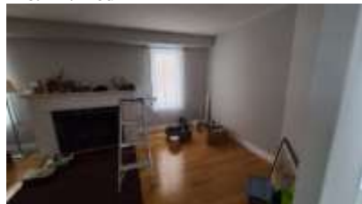
Pic. 17: Living / dining room