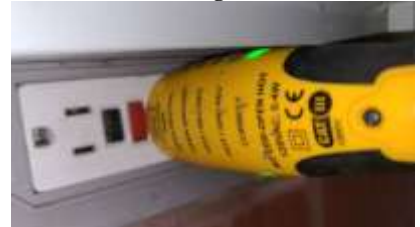
Pic. 6: Rear GFCI outlet needs to be replaced