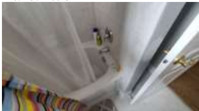
Pic. 16: 2 nd floor bath