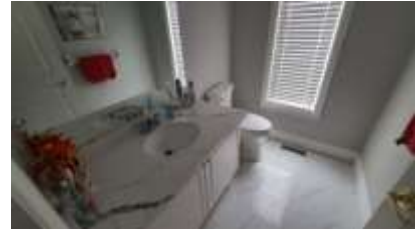
Pic. 24: Powder room