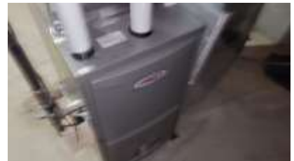
Pic. 30: Gas furnace 2018