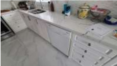
Pic. 22: Kitchen