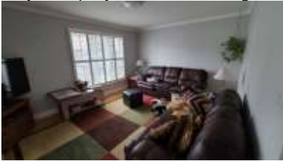
Pic. 19: Family room