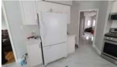
Pic. 23: Kitchen