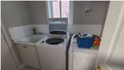
Pic. 25: Laundry