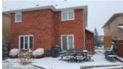
Pic. 5: Back view