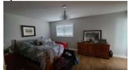
Pic. 9: Master bedroom