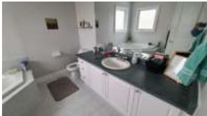
Pic. 10: Master bath