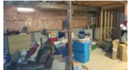
Pic. 27: Unfinished basement