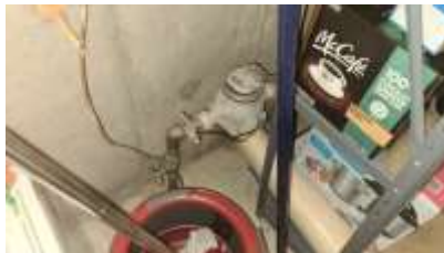
Pic. 32: Water main