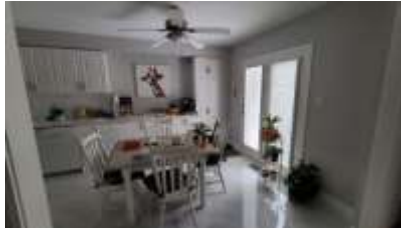
Pic. 20: Eating area