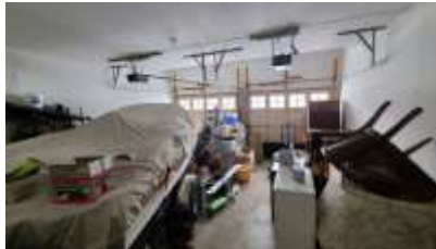
Pic. 26: Garage