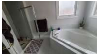
Pic. 11: Master bath