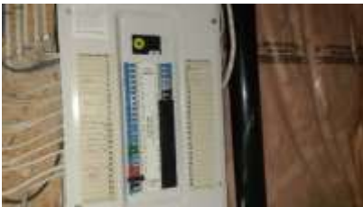
Pic. 31: 100 amp breaker panel