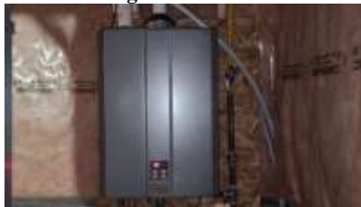
Pic. 29: Tankless hot water 2018