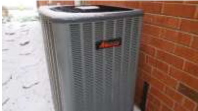
Pic. 4: AC unit 2018