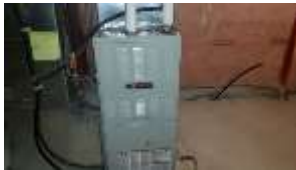
Pic. 25: Gas furnace 2010