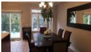
Pic. 17: Dining room