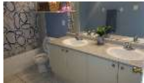
Pic. 15: 2nd floor bath