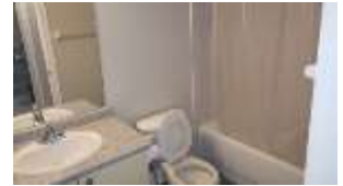
Pic. 12: 2nd floor bath