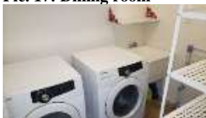
Pic. 21: Laundry