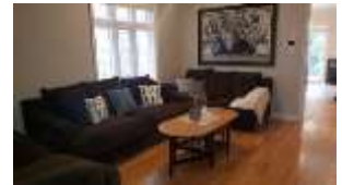
Pic. 16: Living room