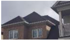
Pic. 2: Original roof covering