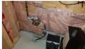
Pic. 27: Water main