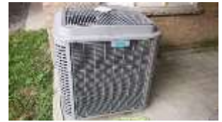
Pic. 4: AC unit 2010