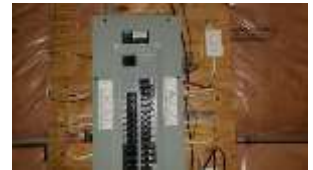
Pic. 28: 100 amp breaker panel