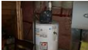
Pic. 26: Rental hot water tank 2010