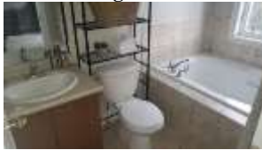
Pic. 9: Master bath