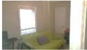
Pic. 11: Bed 2