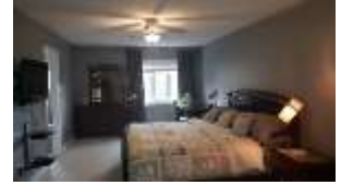
Pic. 8: Master bedroom