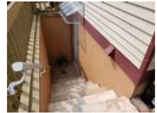
Pic. 4: Basement entrance