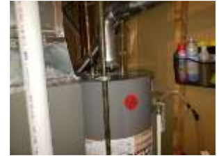
Pic. 32: Rental hot water tank