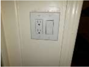
Pic. 29: GFCI outlet recommended for basement bath