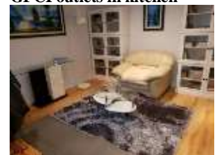
Pic. 24: Rec room