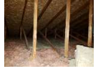
Pic. 8: Attic