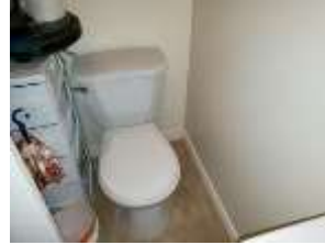
Pic. 27: Basement bath