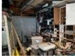
Pic. 7: Garage