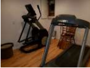
Pic. 25: Basement room