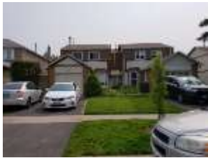
Pic. 1: Front view