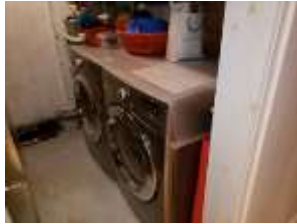
Pic. 30: Laundry