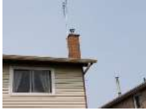
Pic. 6: Chimney