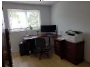
Pic. 11: Bed 3