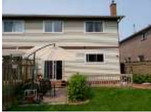
Pic. 5: Back view