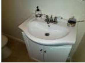
Pic. 26: Basement bath