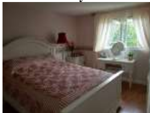
Pic. 10: Bed 2