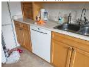
Pic. 18: Kitchen