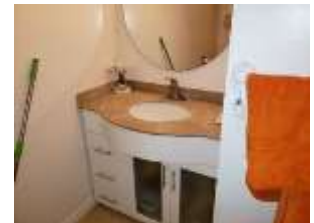
Pic. 12: 2 nd floor bath