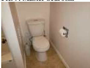
Pic. 13: 2 nd floor bath