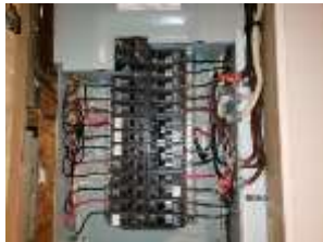
Pic. 34: 100 amp breaker panel