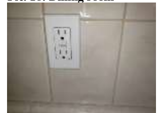
Pic. 20: 15 amp duplex GFCI outlets in kitchen