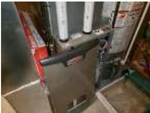
Pic. 33: Gas furnace 2013