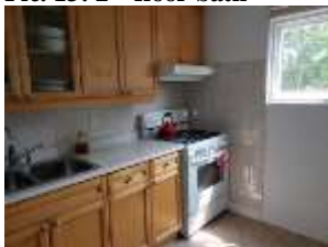
Pic. 17: Kitchen