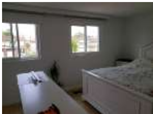
Pic. 9: Master bedroom