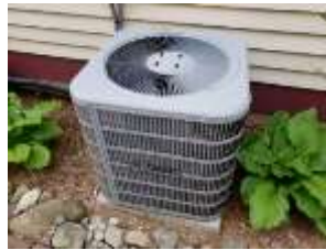
Pic. 3: AC unit 2012