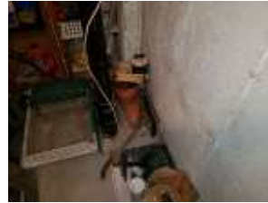
Pic. 31: Water main