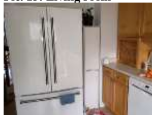
Pic. 19: Kitchen