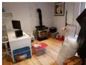
Pic. 23: Rec room