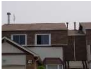
Pic. 2: Roof covering