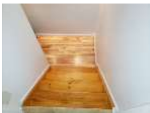
Pic. 21: Handrail needed for basement stairwell