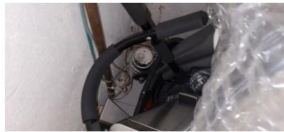
Pic. 41: Water main