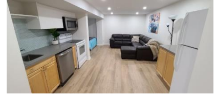
Pic. 30: Basement