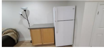
Pic. 32: Kitchen