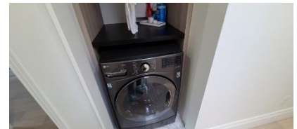
Pic. 18: 2 nd floor laundry