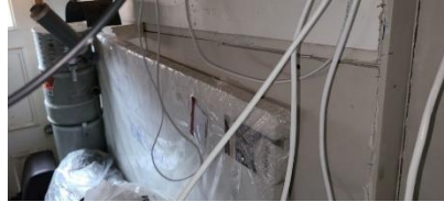
Pic. 8: Gas seal of drywall joints needed in garage