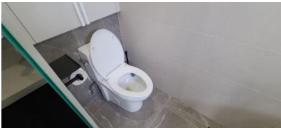
Pic. 13: Master bath