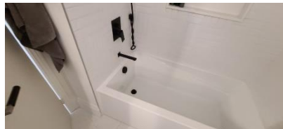
Pic. 17: 2 nd floor bath