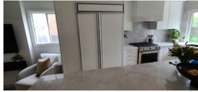
Pic. 23: Kitchen