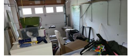
Pic. 6: Garage