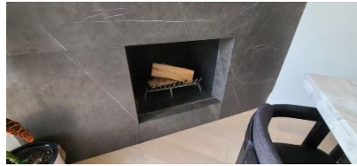
Pic. 26: Fireplace, recommend WETT review