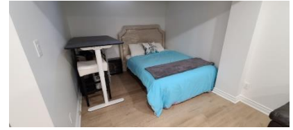
Pic. 33: Sleeping area