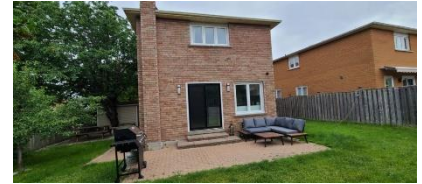
Pic. 3: Back view