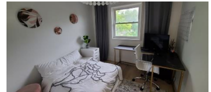
Pic. 15: Bedroom 3