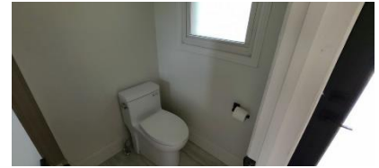
Pic. 27: Powder room