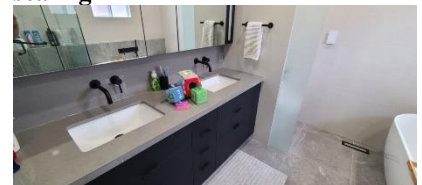
Pic. 12: Master bath