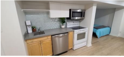
Pic. 31: Kitchen