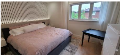
Pic. 10: Master bedroom