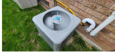
Pic. 5: AC unit 2018