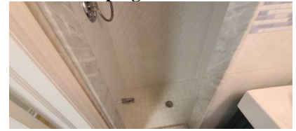
Pic. 36: Bathroom