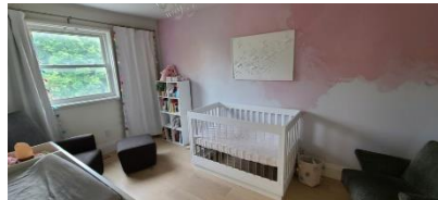
Pic. 14: Bedroom 2