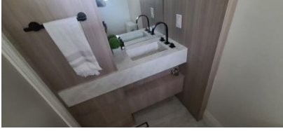
Pic. 28: Powder room