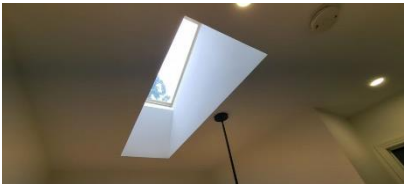
Pic. 19: Skylight