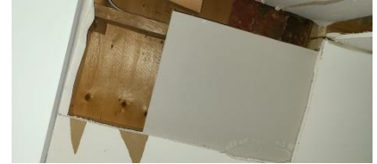
Pic. 9: Missing drywall needs to be replaced on garage ceiling for gas sealing