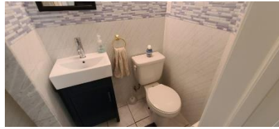
Pic. 35: Bathroom