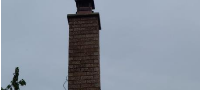
Pic. 4: Chimney