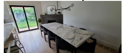
Pic. 21: Dining room