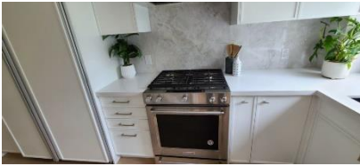
Pic. 25: Kitchen