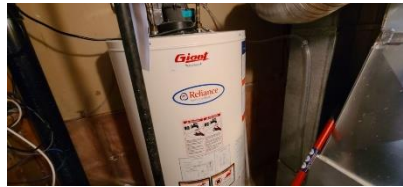
Pic. 38: Rental hot water tank 2021