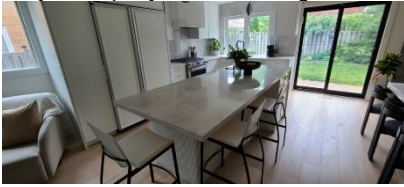
Pic. 22: Kitchen