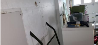
Pic. 7: Gas seal of drywall joints needed in garage