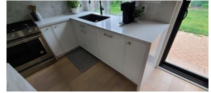
Pic. 24: Kitchen