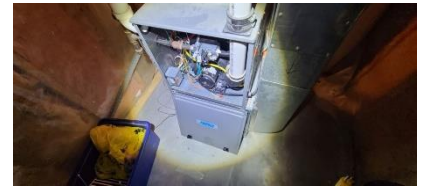
Pic. 39: Gas furnace 2020