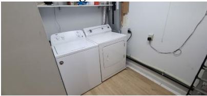
Pic. 37: Laundry