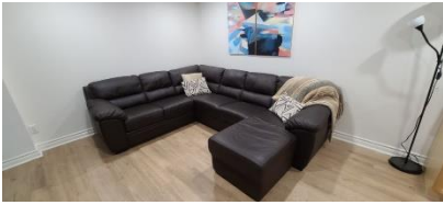
Pic. 34: Living area