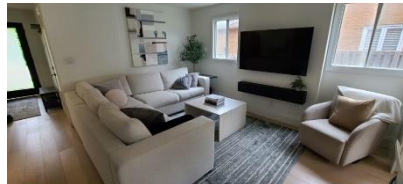
Pic. 20: Living room