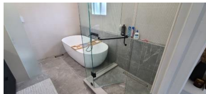
Pic. 11: Master bath