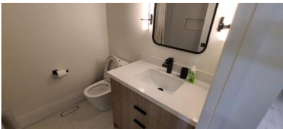
Pic. 16: 2 nd floor bath