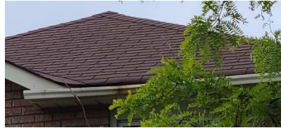
Pic. 2: Aging roof covering