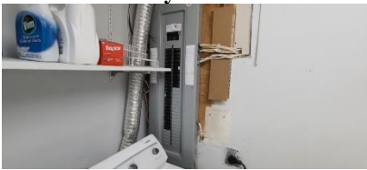
Pic. 40: 200-amp breaker panel