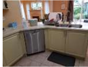
Pic. 27: Kitchen