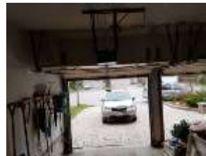
Pic. 11: Garage