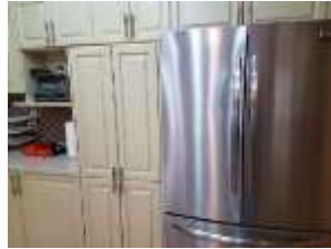
Pic. 26: Kitchen