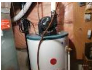
Pic. 37: Hot water tank