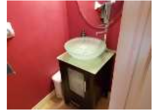
Pic. 28: Powder room