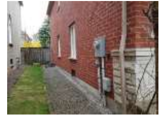
Pic. 8: Side view