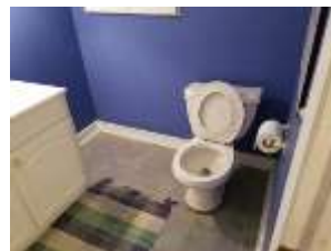
Pic. 35: Basement bath