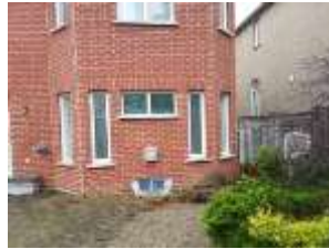
Pic. 6: Back view