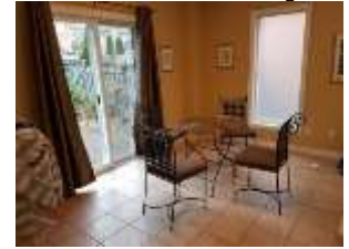
Pic. 24: Eating area