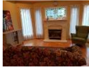
Pic. 23: Family room