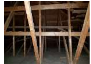
Pic. 12: Attic