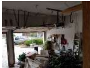
Pic. 10: Garage