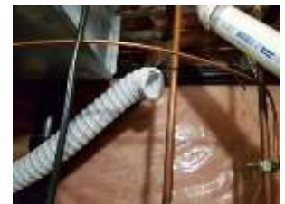
Pic. 36: Exhaust pipe for bath should be vented to the exterior