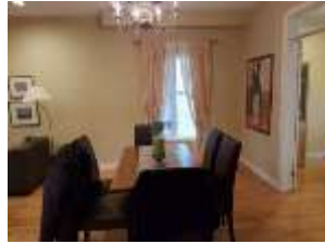
Pic. 22: Dining room