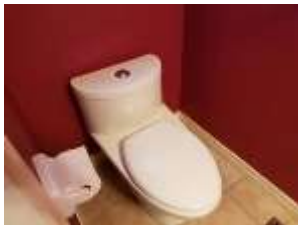
Pic. 29: Powder room