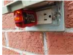
Pic. 7: GFCI outlet needs replacement