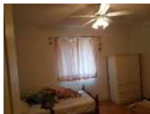
Pic. 18: Bed 2