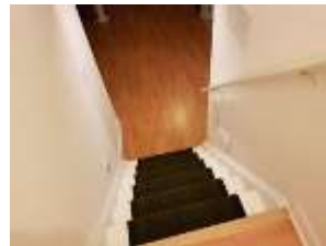
Pic. 31: Basement stairs