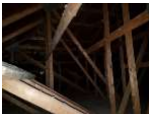
Pic. 13: Attic