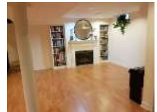
Pic. 32: Rec room