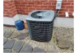
Pic. 4: AC unit