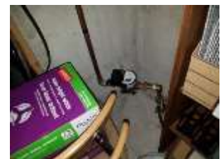
Pic. 40: Water main