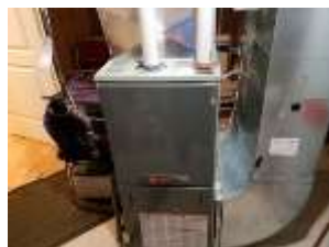
Pic. 38: Furnace