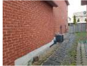
Pic. 3: Side view