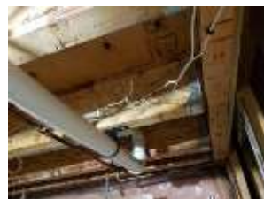
Pic. 39: Extension cord wiring