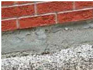
Pic. 9: Typical foundation crack