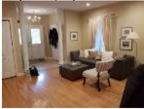
Pic. 21: Living room