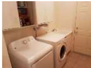
Pic. 30: Laundry