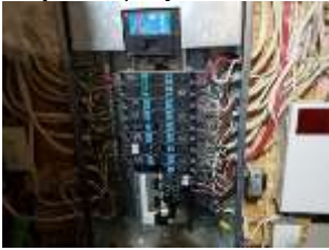
Pic. 41: 200 amp breaker panel with all copper wire