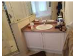
Pic. 15: Master bath