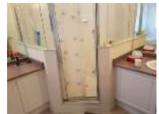
Pic. 16: Master bath