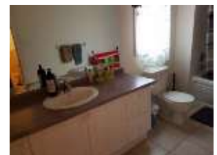
Pic. 20: 2 nd floor bath