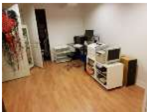
Pic. 33: Basement room