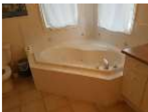
Pic. 17: Master bath