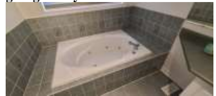
Pic. 9: Master bath