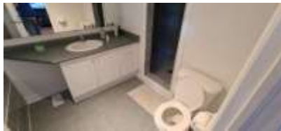
Pic. 8: Master bath