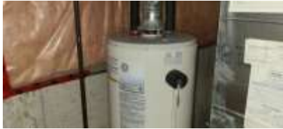
Pic. 25: Hot water tank 2010