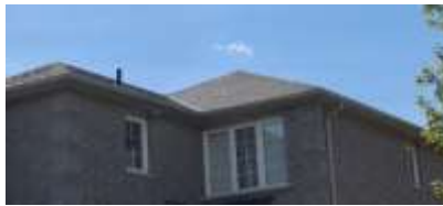
Pic. 2: New roof covering