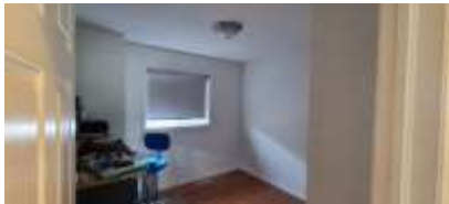
Pic. 10: Bedroom 2