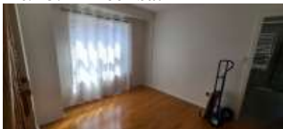
Pic. 16: Lovong room