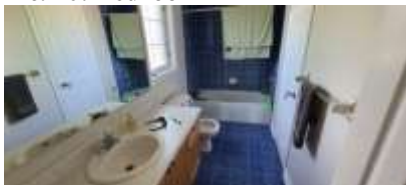
Pic. 13: 2 nd floor bath