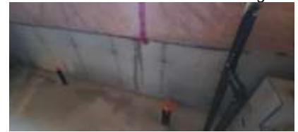
Pic. 24: Professionally repaired foundation crack