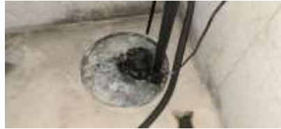
Pic. 26: Sump pump