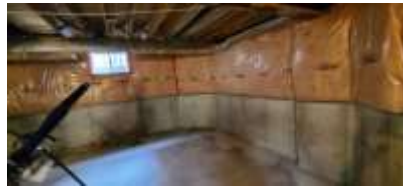
Pic. 23: Basement