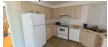
Pic. 18: Kitchen