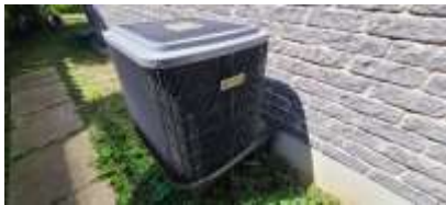
Pic. 4: AC unit 2004