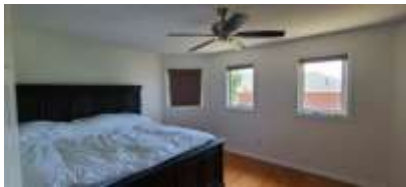
Pic. 7: Master bedroom