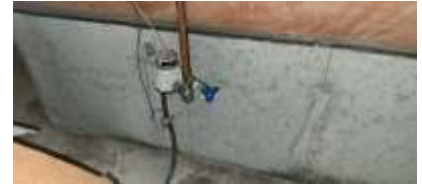
Pic. 27: Water main