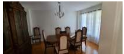
Pic. 15: Dinign room