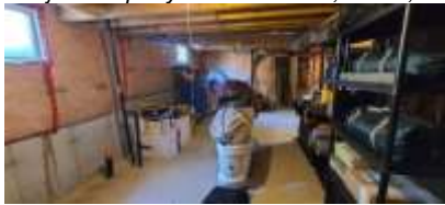
Pic. 22: Basement