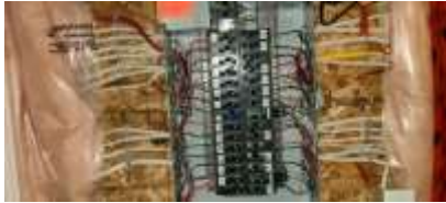
Pic. 28: 100-amp breaker panel