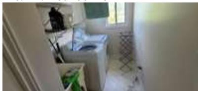
Pic. 14: Laundry