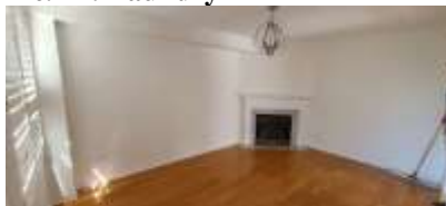
Pic. 17: Family room