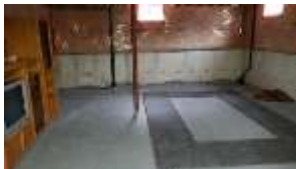
Pic. 25: Unfinished basement