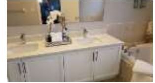
Pic. 8: Master bath