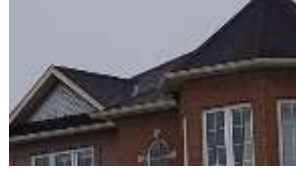
Pic. 3: Original roof covering