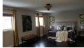
Pic. 7: Master bedroom