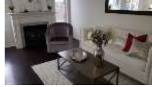
Pic. 19: Family room