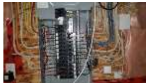
Pic. 30: 100 amp breaker panel