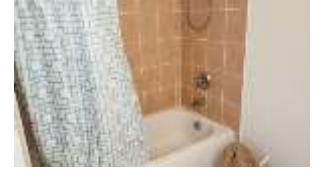
Pic. 16: 2 nd floor bath