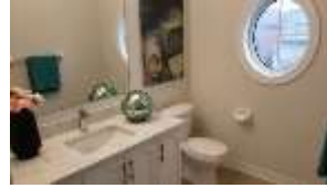
Pic. 15: 2 nd floor bath