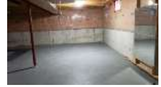
Pic. 24: Unfinished basement