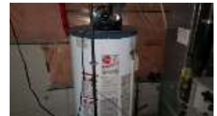
Pic. 28: Rental hot water tank