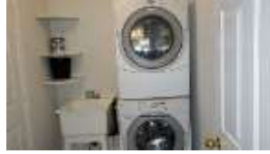
Pic. 22: Laundry