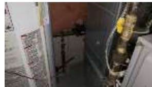
Pic. 31: Water main