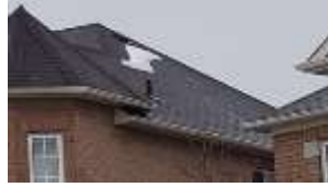
Pic. 2: Original roof covering