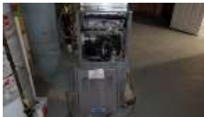
Pic. 29: Original gas furnace