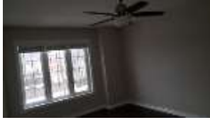
Pic. 13: Bed 3