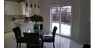
Pic. 20: Eating area