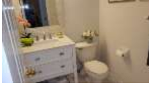
Pic. 21: Powder room