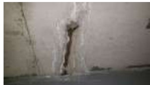
Pic. 26: Small moisture seepage from back wall tie back hole