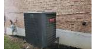
Pic. 4: AC unit 2016