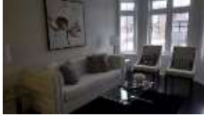
Pic. 17: Living room