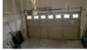
Pic. 23: Garage