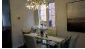
Pic. 18: Dining room