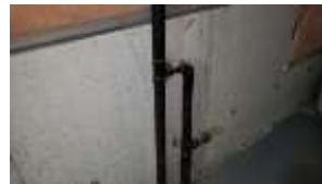
Pic. 27: Foundation crack – no active seepage