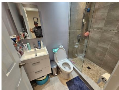
Pic. 26: Basement bathroom