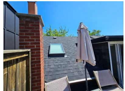
Pic. 9: Updated roof covering