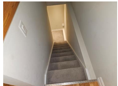
Pic. 24: Handrailing advised for basement stairwell