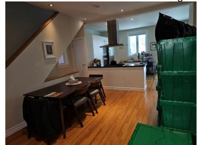
Pic. 18: Dining room