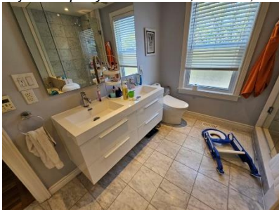
Pic. 16: 2 nd floor bathroom