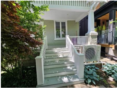
Pic. 4: Front porch