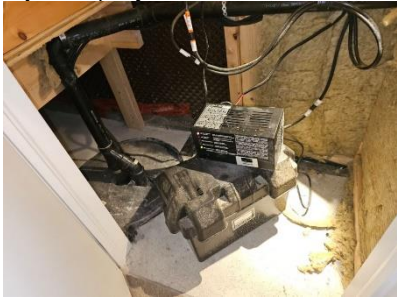
Pic. 31: Sump pump with bateery backup