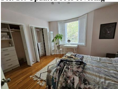
Pic. 13: Bedroom 2