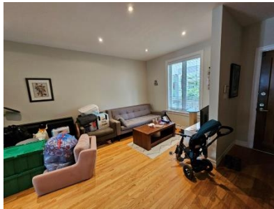
Pic. 17: Living room