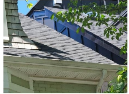
Pic. 3: Updated roof covering