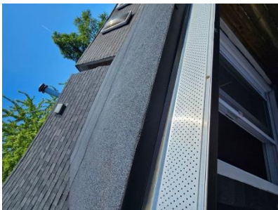
Pic. 10: Updated roof covering