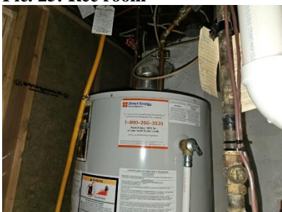
Pic. 28: Hot water tank