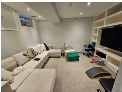
Pic. 25: Rec room