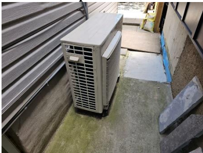
Pic. 7: AC #3