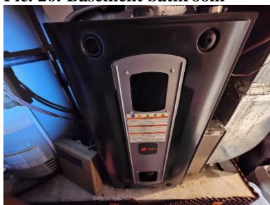
Pic. 29: Gas furnace