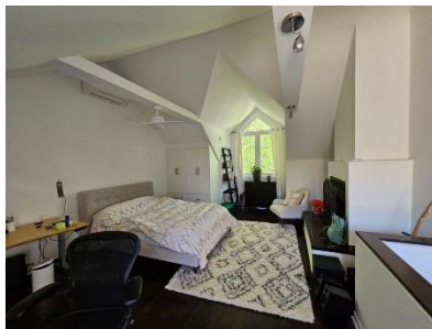
Pic. 11: 3 rd floor primary bedroom