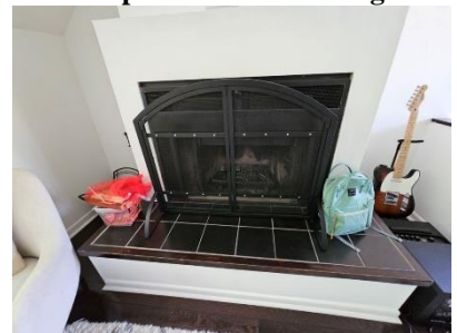
Pic. 12: Wood fireplace