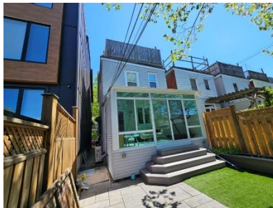
Pic. 8: Back view