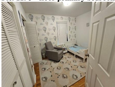
Pic. 14: Bedroom 3