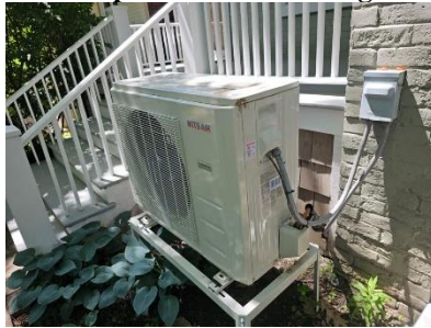
Pic. 5: AC #1