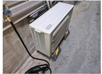
Pic. 6: AC #2