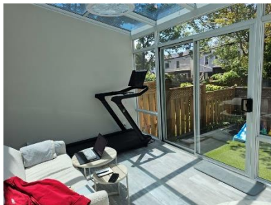
Pic. 23: Sun room