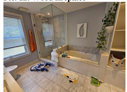
Pic. 15: 2 nd floor bathroom