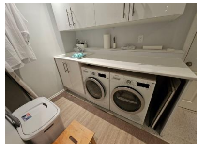
Pic. 27: Laundry