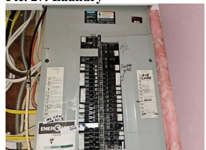
Pic. 30: 100 amp breaker panel