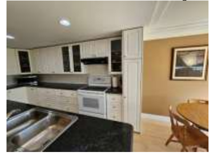
Pic. 15: Kitchen