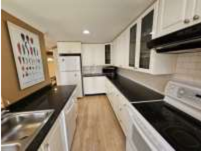
Pic. 16: Kitchen