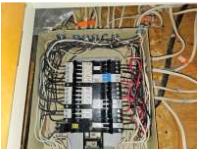
Pic. 25: 125 amp breaker panel