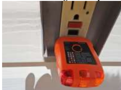
Pic. 8: Rear GFCI outlet not working – replace as necessary