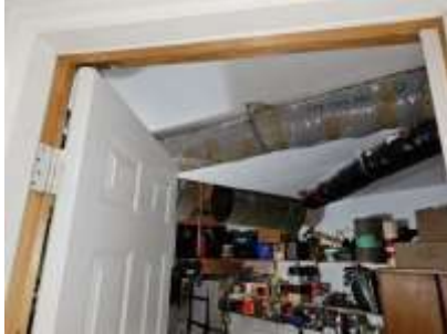
Pic. 4: No auto closer on garage entry door