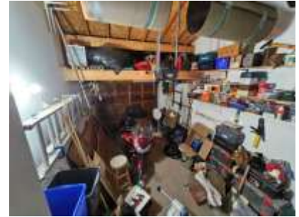
Pic. 3: Garage