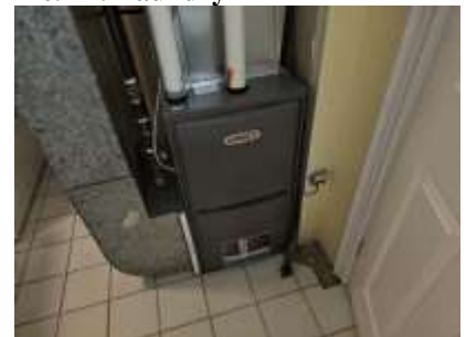
Pic. 24: Gas furnace 2019