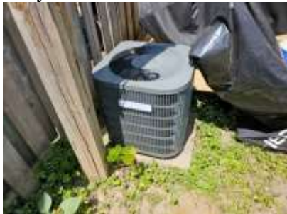
Pic. 7: AC unit 2005