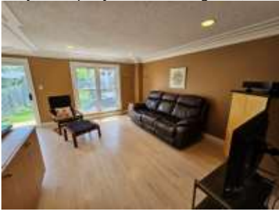
Pic. 13: Living room