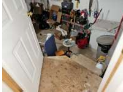
Pic. 5: Recommend a railing around the landing for safety