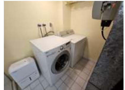
Pic. 21: Laundry