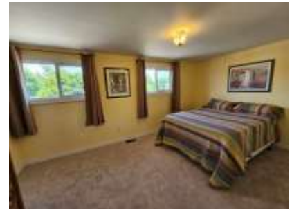
Pic. 9: Master bedroom