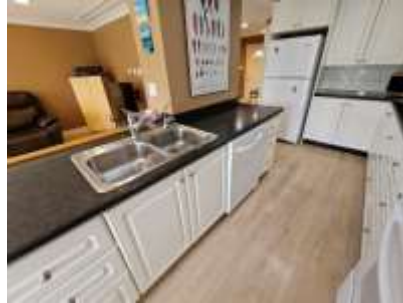
Pic. 17: Kitchen