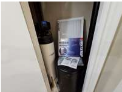
Pic. 22: Water softener