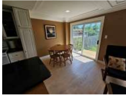
Pic. 14: Dining room