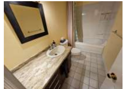
Pic. 12: 2 nd floor bathroom