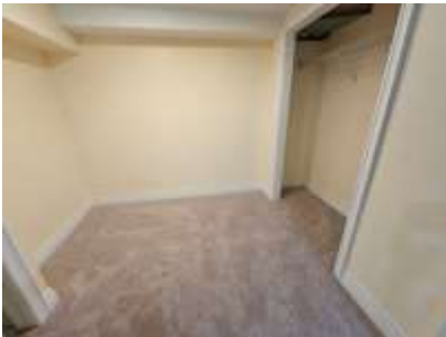
Pic. 19: Basement room