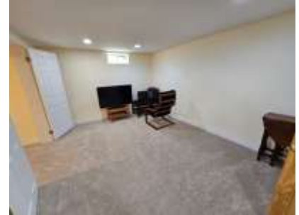
Pic. 18: Rec room