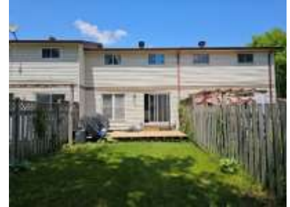
Pic. 6: Back view