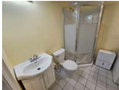
Pic. 20: Basement bath