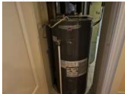
Pic. 23: Electric hot water tank 2019