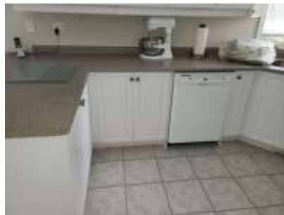
Pic. 26: Kitchen