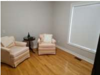
Pic. 28: Den