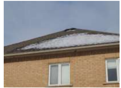
Pic. 3: Updated roof covering