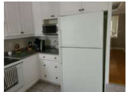
Pic. 27: kitchen