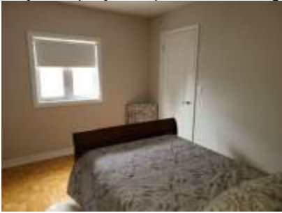
Pic. 16: Bed 4