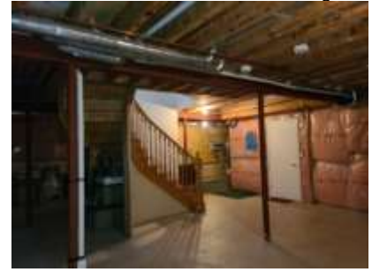
Pic. 33: Unfinished basement