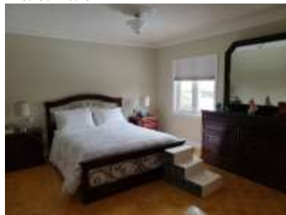
Pic. 11: Master bedroom