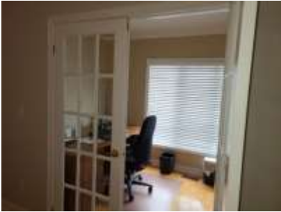
Pic. 19: Office