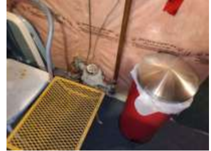
Pic. 36: Water main