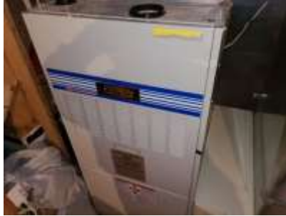
Pic. 35: Original gas furnace