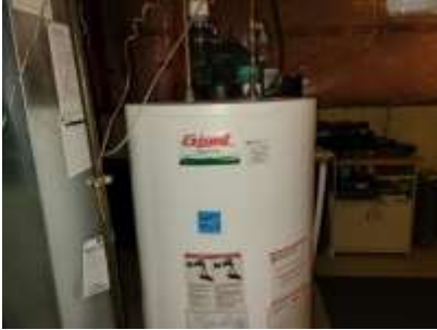
Pic. 34: Hot water tank 2014