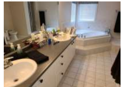
Pic. 12: Master bath