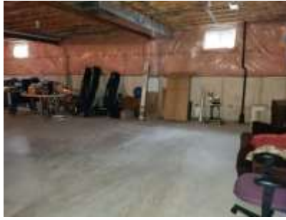
Pic. 32: Unfinished basement