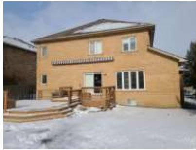
Pic. 2: Back view