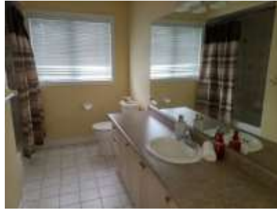
Pic. 17: 2 nd floor bath