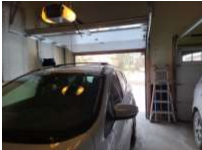
Pic. 7: Garage