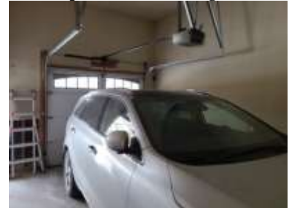
Pic. 6: Garage