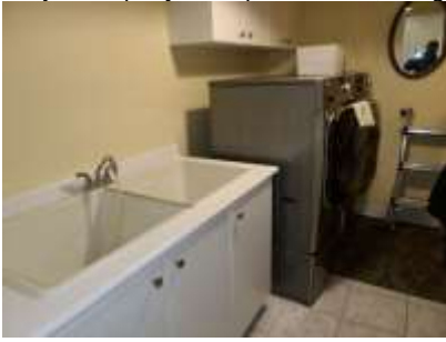
Pic. 31: Laundry