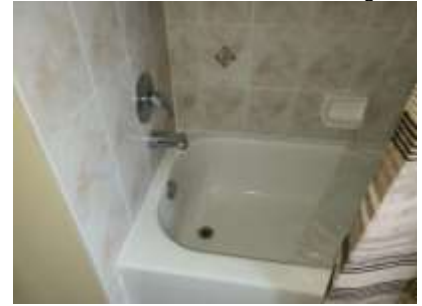
Pic. 18: 2 nd floor bath