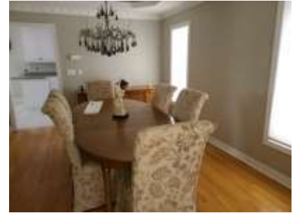
Pic. 21: Dining room