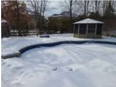
Pic. 4: Inground pool – closed and not reviewed