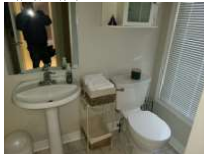
Pic. 29: Main floor bath