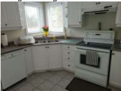
Pic. 25: Kitchen