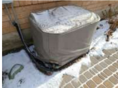
Pic. 5: Original AC unit