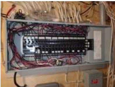
Pic. 37: 200 amp breaker panel with all copper wire