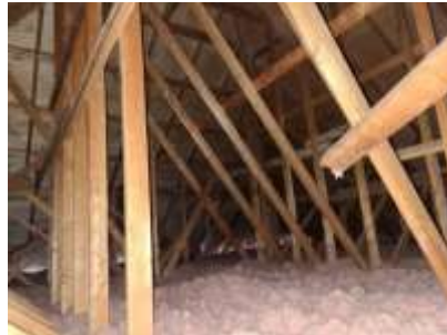
Pic. 8: Attic