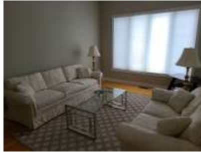
Pic. 20: Living room