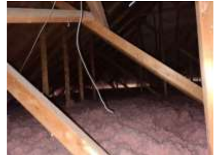
Pic. 9: Attic