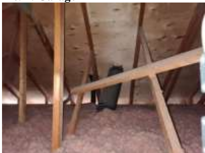
Pic. 10: Attic