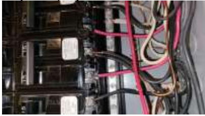
Pic. 37: One breaker double tapped