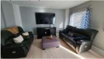
Pic. 19: Living room