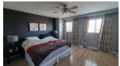
Pic. 12: Master bedroom