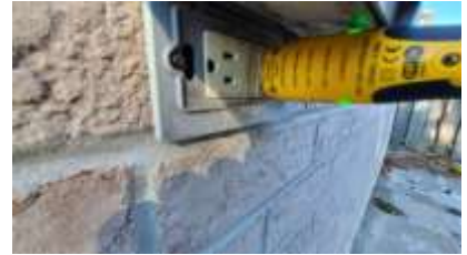
Pic. 6: Rear GFCI defective and needs to be replaced