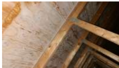
Pic. 11: Some frost buildup in attic