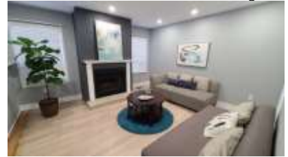
Pic. 21: Family room