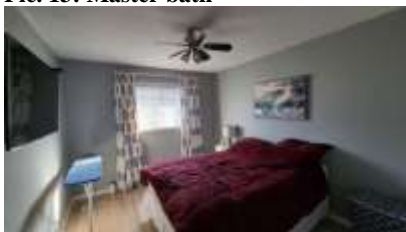
Pic. 16: Bed 3