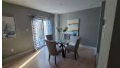
Pic. 20: Dining room