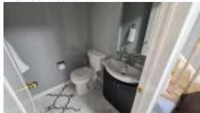
Pic. 26: Powder room