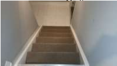
Pic. 28: Handrailing needed for basement stairwell