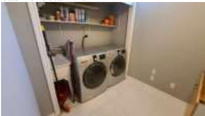
Pic. 31: Laundry