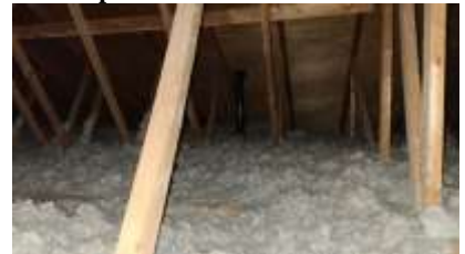
Pic. 9: Attic