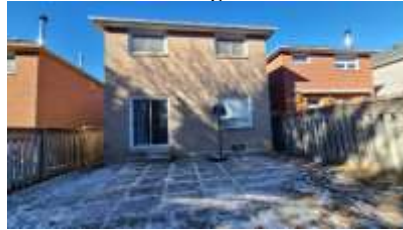
Pic. 5: Back view