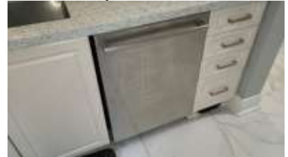
Pic. 24: Kitchen