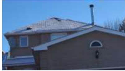
Pic. 2: Limited review of roof covering due to snow covering