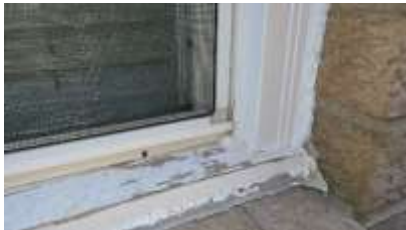
Pic. 7: Painting of window frames where necessary advised