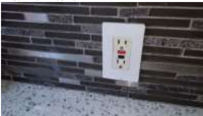
Pic. 25: 15 amp GFCI outlet in kitchen can cause nuisance tripping