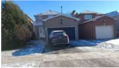
Pic. 1: Front view