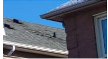
Pic. 3: Visible missing shingle tabs on roof