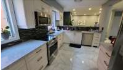
Pic. 22: Kitchen