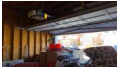
Pic. 8: Garage