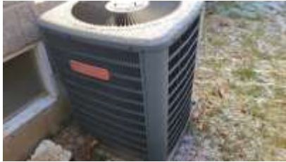
Pic. 4: AC unit 2010