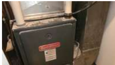
Pic. 32: Gas furnace 2010