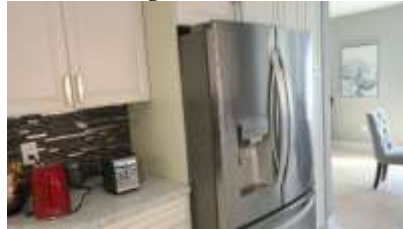
Pic. 23: Kitchen