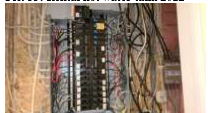
Pic. 36: 100 amp breaker panel