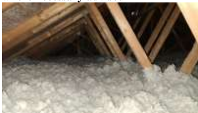
Pic. 10: Attic