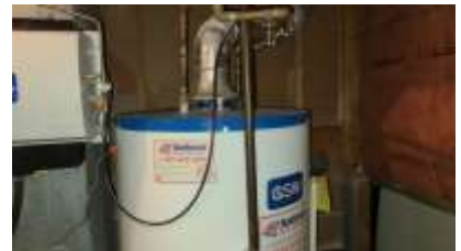
Pic. 33: Rental hot water tank 2012