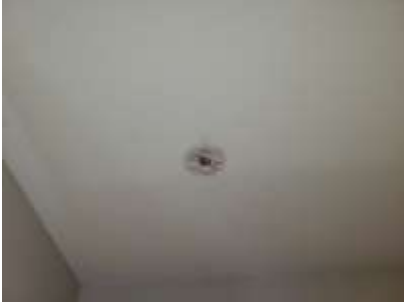
Pic. 28: Missing smoke / CO detector on second floor