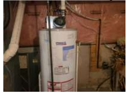
Pic. 45: Rental hot water tank 2008