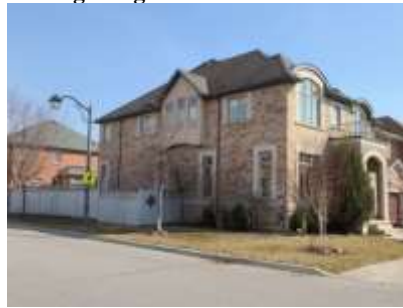
Pic. 5: Side view