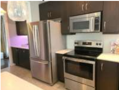
Pic. 34: Kitchen