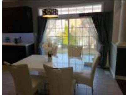
Pic. 32: Eating area