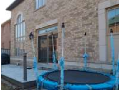
Pic. 7: Bac view