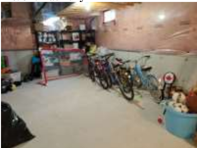
Pic. 40: Unfinished basement