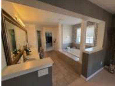
Pic. 17: Master bath