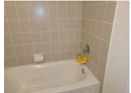
Pic. 24: Joint ensuite