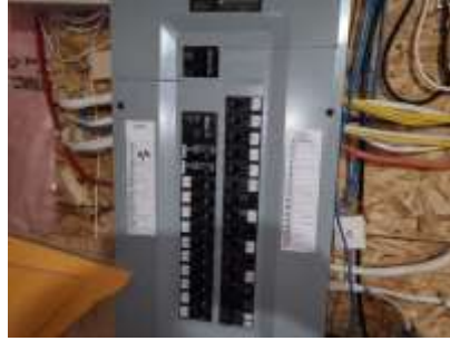
Pic. 47: 100 amp breaker panel with all copper wire