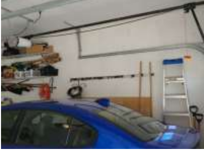
Pic. 13: Garage