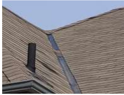
Pic. 2: Roof covering with some missing shingle tabs