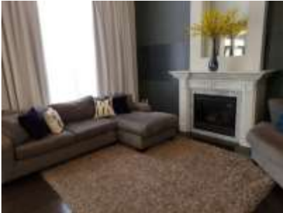
Pic. 31: Family room