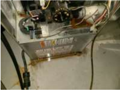
Pic. 43: Furnace has a condensate leak and in need of service