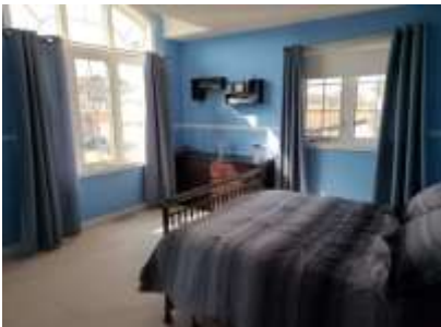
Pic. 25: Bed 4