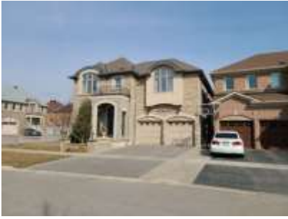
Pic. 1: Front