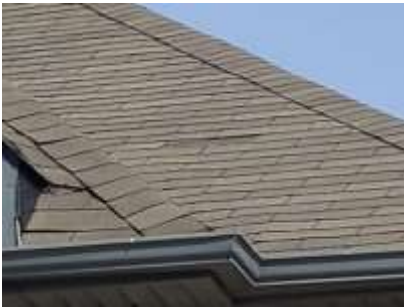
Pic. 4: Missing shingle tab