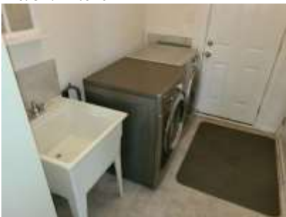
Pic. 37: Laundry