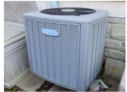
Pic. 6: AC unit 2008