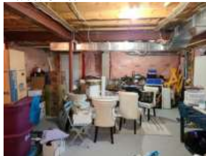
Pic. 41: Unfinished basement