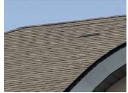
Pic. 3: Missing shingle tab