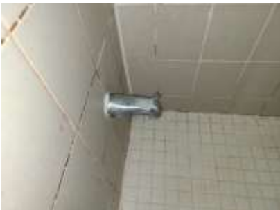
Pic. 19: Shower diverter seized