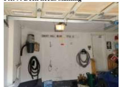
Pic. 12: Garage