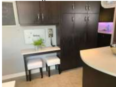
Pic. 35: Kitchen