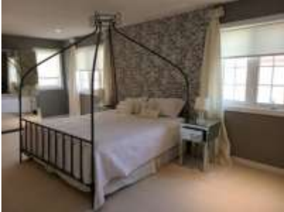
Pic. 16: Master bedroom