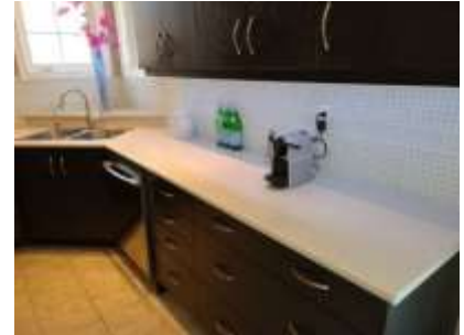
Pic. 33: Kitchen