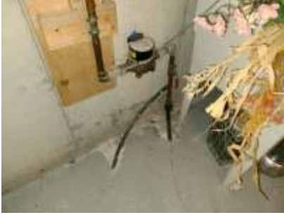
Pic. 46: Water main