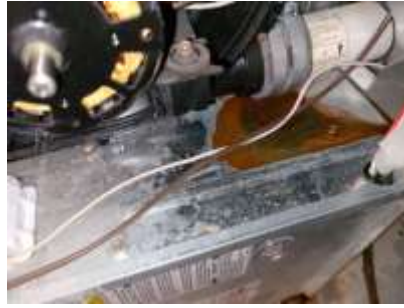
Pic. 44: Furnace has a condensate leak and in need of service