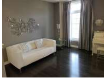
Pic. 29: Living room