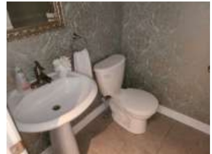
Pic. 36: Powder room