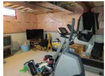
Pic. 39: Unfinished basement