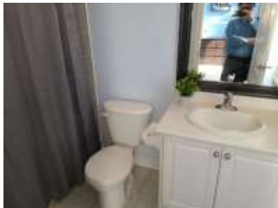
Pic. 26: Ensuite