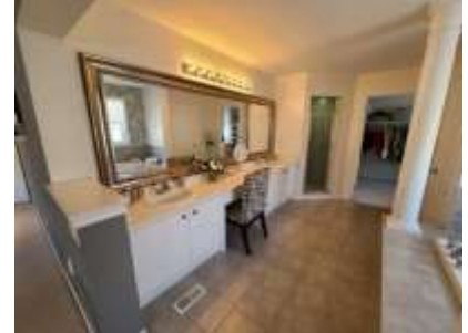
Pic. 18: Master bath