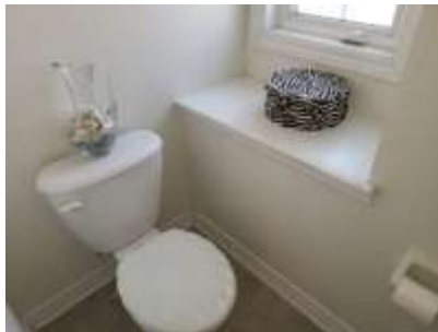
Pic. 20: Master bath