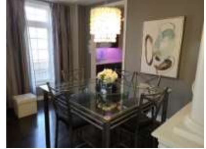
Pic. 30: Dining room