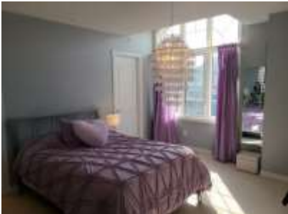
Pic. 22: Bed 3