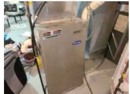
Pic. 42: Gas furnace 2008