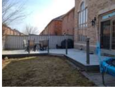
Pic. 8: Rear deck