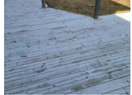
Pic. 9: Deck needs staining