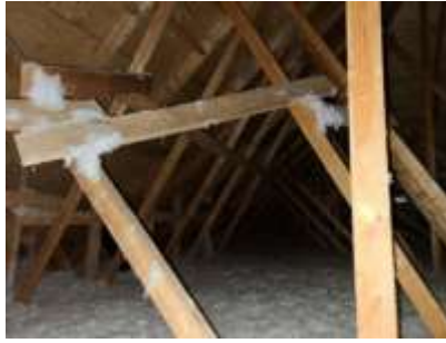
Pic. 14: Attic