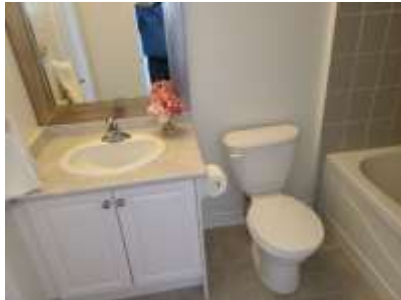
Pic. 23: Joint ensuite