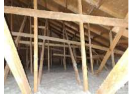
Pic. 15: Attic