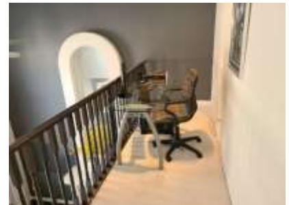
Pic. 27: Loft area