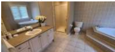
Pic. 13: Master bath