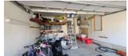
Pic. 9: Garage