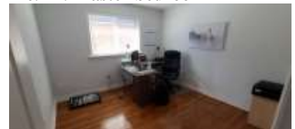
Pic. 15: Bedroom 2