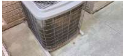
Pic. 8: AC unit older 2001