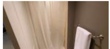
Pic. 30: Basement bath