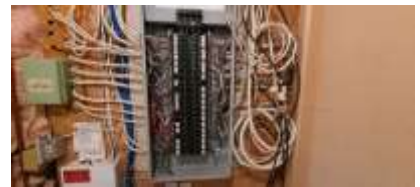
Pic. 33: 200-amp breaker panel