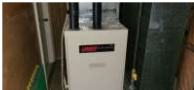
Pic. 32: Original gas furnace 2000