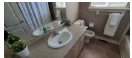
Pic. 18: 2 nd floor bath