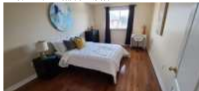
Pic. 17: Bedroom 4