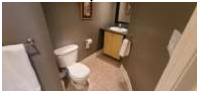
Pic. 29: Basement bath