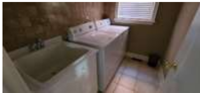
Pic. 26: Laundry