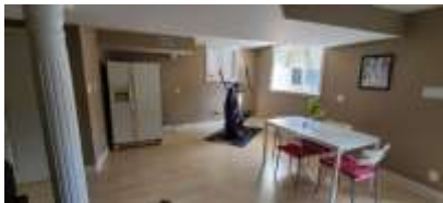
Pic. 28: Rec room with rough in kitchen