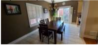
Pic. 22: Dining room