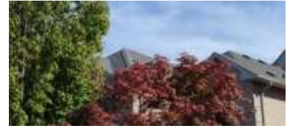
Pic. 3: Updated roof covering