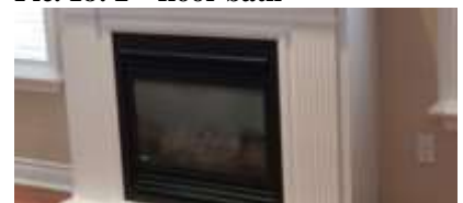
Pic. 21: Gas fireplace would not fire, needs service