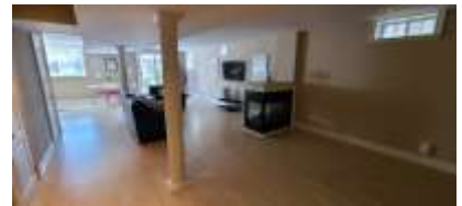
Pic. 27: Rec room