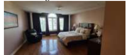
Pic. 12: Master bedroom