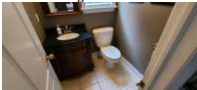
Pic. 25: Powder room