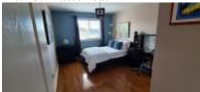
Pic. 16: Bedroom 3