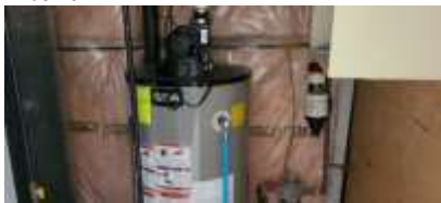
Pic. 31: Rental hot water tank 2013