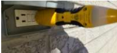
Pic. 7: Rear GFCI outlet defective