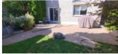
Pic. 5: Patio