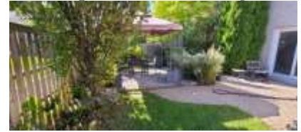
Pic. 6: Patio