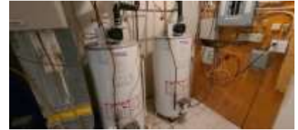
Pic. 51: Rental hot water tanks – 2005