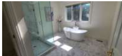
Pic. 20: Master bath