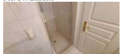
Pic. 27: Ensuite