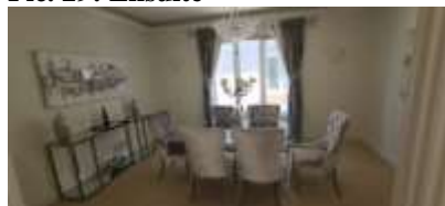
Pic. 32: Dining room