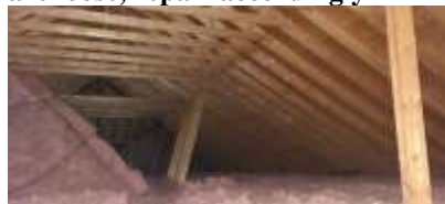
Pic. 17: Attic