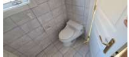
Pic. 24: Ensuite