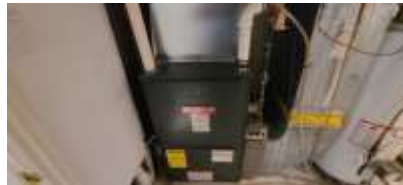
Pic. 53: Gas furnace 2010