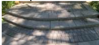
Pic. 14: Several stones and bricks are loose, repair accordingly