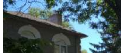
Pic. 6: Updated roof covering