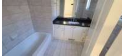
Pic. 23: Ensuite