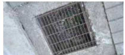
Pic. 12: Catch basins need to be cleaned out