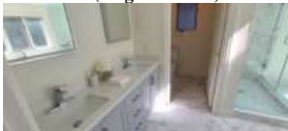
Pic. 19: Master bath