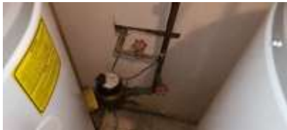
Pic. 52: Water main