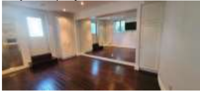
Pic. 46: Basement / Exercise room