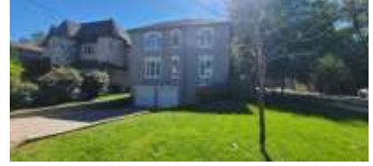
Pic. 3: Side view