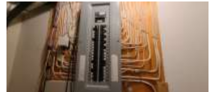
Pic. 54: 200 amp breaker panel