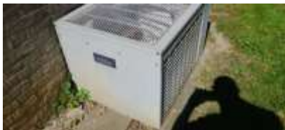
Pic. 10: Original AC unit