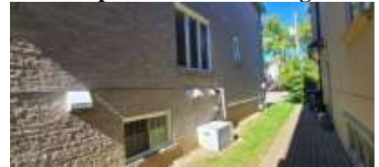
Pic. 9: Side view