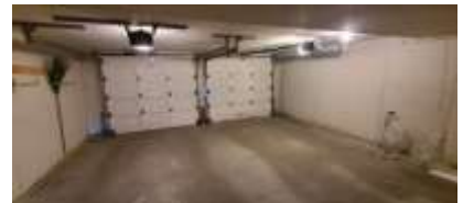
Pic. 15: Garage