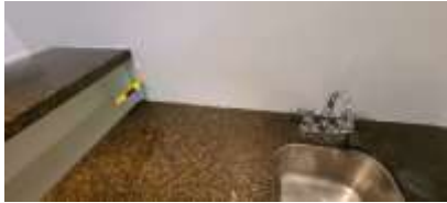
Pic. 49: Recommend upgrading outlet to a GFCI outlet