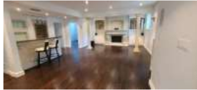
Pic. 47: Rec room – gas fireplace would not start