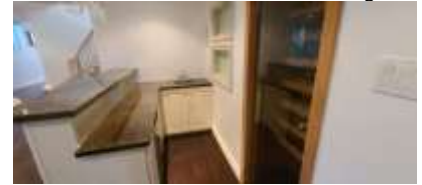
Pic. 48: Wet bar