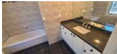
Pic. 29: Ensuite