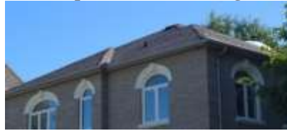
Pic. 5: Updated roof covering