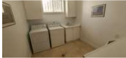
Pic. 50: Laundry