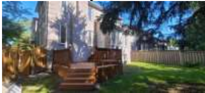
Pic. 7: Back view