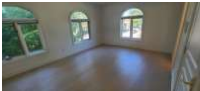
Pic. 28: Bedroom 4