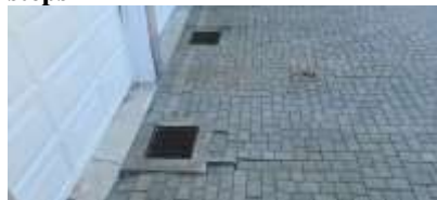
Pic. 11: Several driveway bricks lifted – trip hazard