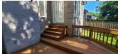
Pic. 8: Handrailing advised for steps