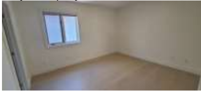
Pic. 22: Bedroom 2