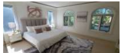
Pic. 18: Master bedroom