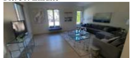
Pic. 33: Family room