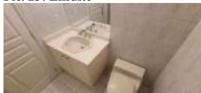
Pic. 26: Ensuite