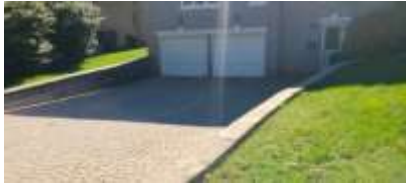
Pic. 4: Driveway