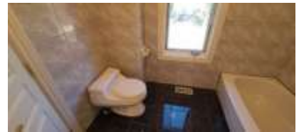
Pic. 30: Ensuite