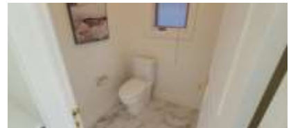
Pic. 21: Master bath