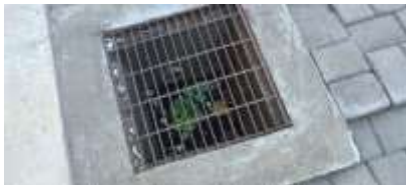
Pic. 13: Catch basins need to be cleaned out