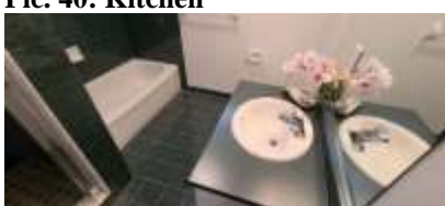
Pic. 43: Basement bath