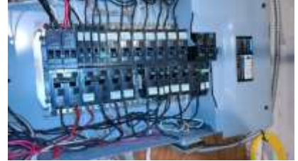
Pic. 24: 100 amp breaker panel