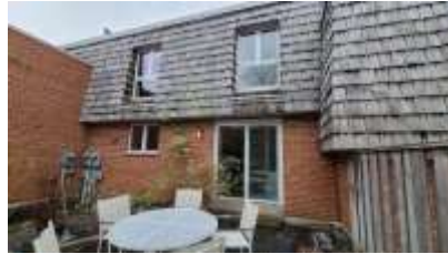
Pic. 2: Back view