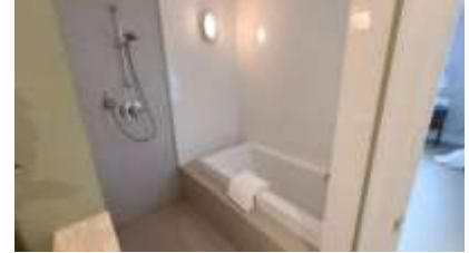
Pic. 6: Master bath