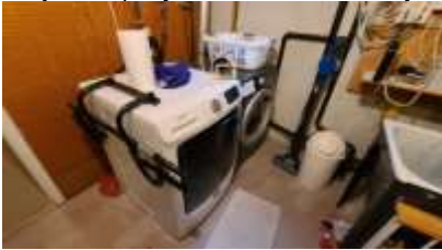
Pic. 19: Laundry