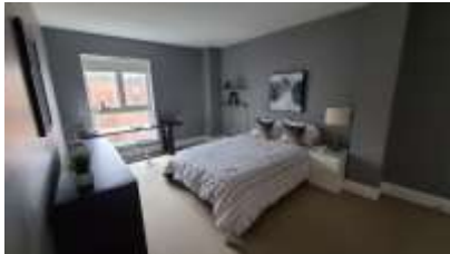
Pic. 7: Bed 2