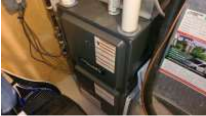
Pic. 22: Gas furnace 2020