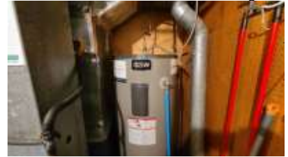
Pic. 21: Electric hot water tank 2016