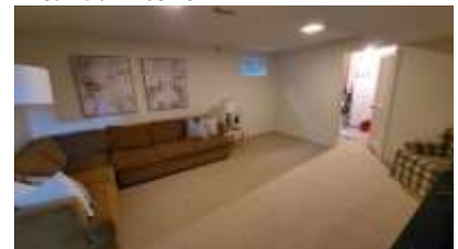
Pic. 18: Rec room