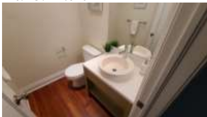
Pic. 16: Powder room