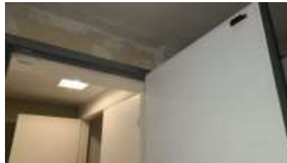
Pic. 26: No auto closer on garage entry door