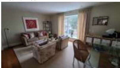
Pic. 10: Living room