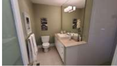
Pic. 5: Master bath