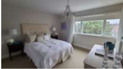
Pic. 4: Master bedroom