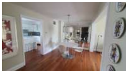
Pic. 11: Dining room