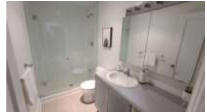
Pic. 9: 2 nd floor bath