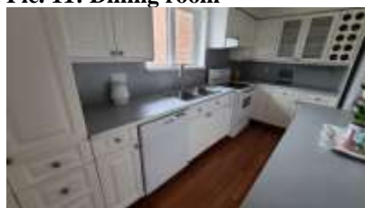
Pic. 14: Kitchen