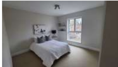
Pic. 8: Bed 3