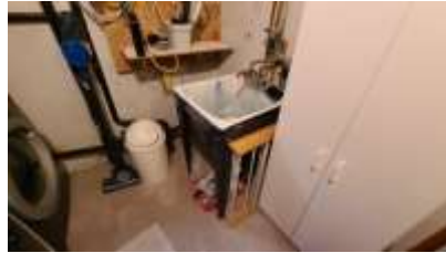
Pic. 20: Laundry