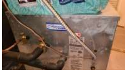
Pic. 23: Water cooled AC chiller