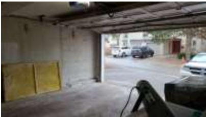
Pic. 25: Garage