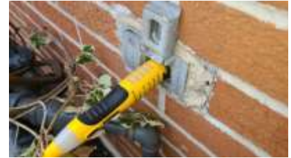
Pic. 3: No power at rear outlet