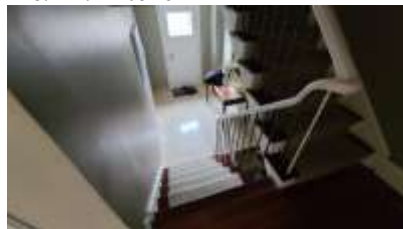
Pic. 17: Foyer