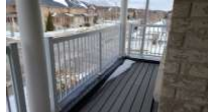
Pic. 9: Front balcony