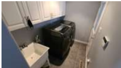
Pic. 29: Laundry