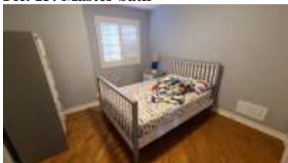
Pic. 16: Bed 2