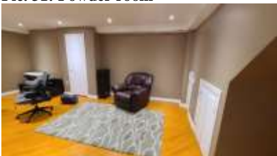
Pic. 34: Rec room