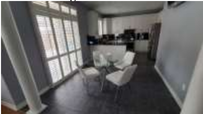
Pic. 25: Eating area