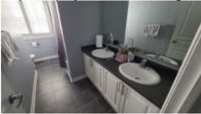
Pic. 19: 2 nd floor bath