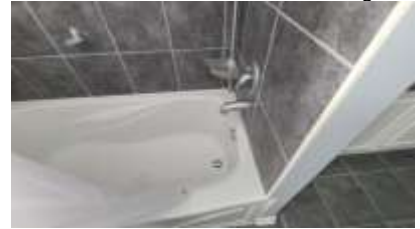
Pic. 21: 2 nd floor bath