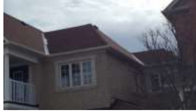
Pic. 2: Original roof covering