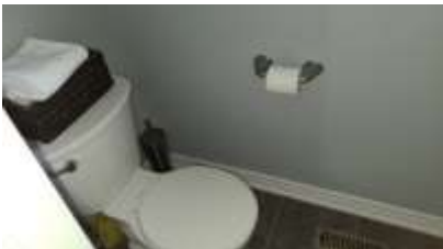
Pic. 31: Powder room