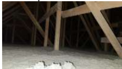
Pic. 11: Attic - updated insulation