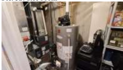
Pic. 35: Rental hot water tank 2015