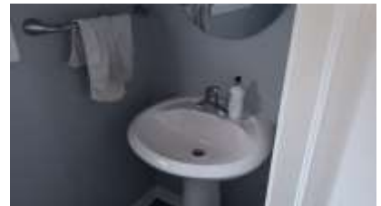
Pic. 30: Powder room