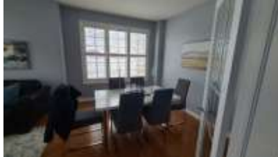
Pic. 23: Dining room area