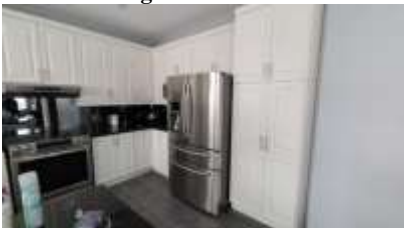
Pic. 28: Kitchen