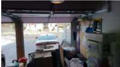
Pic. 7: Garage