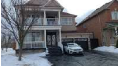
Pic. 1: Front view