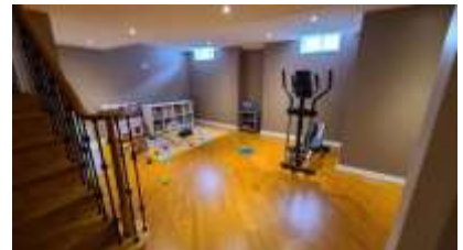
Pic. 33: Rec room