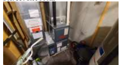
Pic. 36: Gas furnace 2015