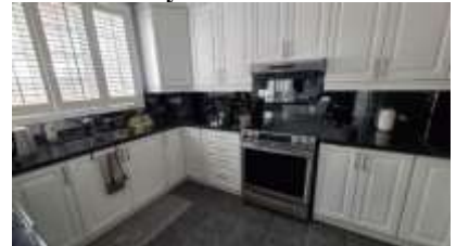
Pic. 27: Kitchen