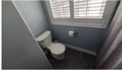
Pic. 20: 2 nd floor bath