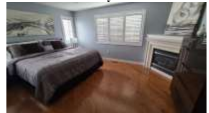
Pic. 12: Master bedroom