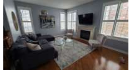
Pic. 24: Family room