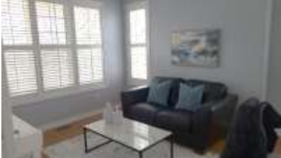
Pic. 22: Living room area