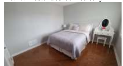
Pic. 18: Bed 4