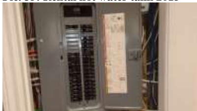
Pic. 38: 200 amp breaker panel