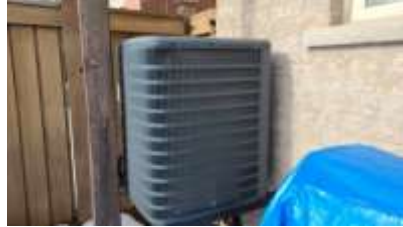
Pic. 5: AC unit 2015