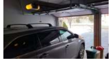
Pic. 6: Garage