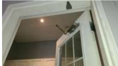
Pic. 8: Entry door not fire rated