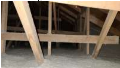
Pic. 10: Attic