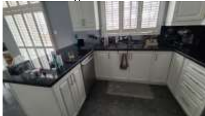
Pic. 26: Kitchen