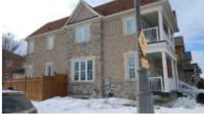
Pic. 4: Back view