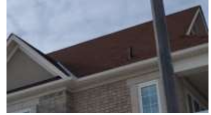
Pic. 3: Original roof covering