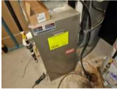
Pic. 32: Gar furnace 2008