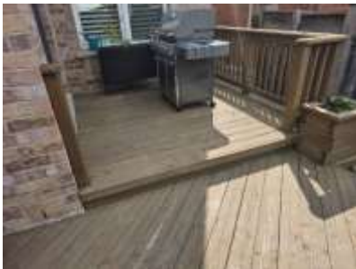
Pic. 7: Deck