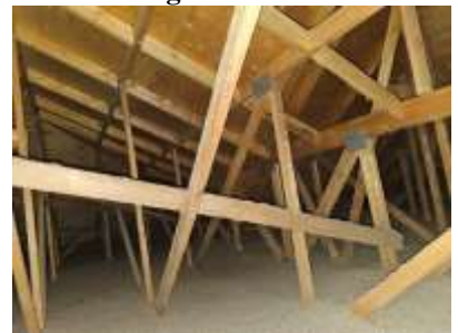
Pic. 12: Attic