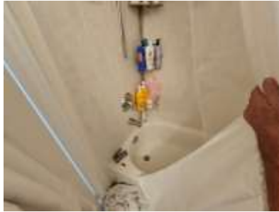
Pic. 20: 2 nd Floor bathroom