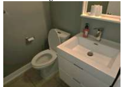
Pic. 27: Powder room