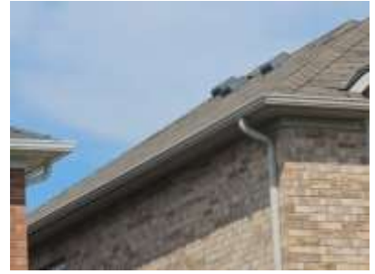
Pic. 3: Roof covering