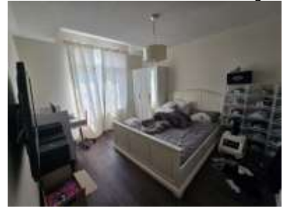
Pic. 18: Bedroom 4