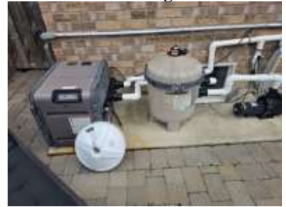
Pic. 6: Pool equipment