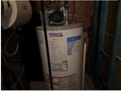
Pic. 31: Rental hot water tank 2008