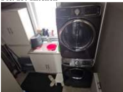
Pic. 28: Laundry