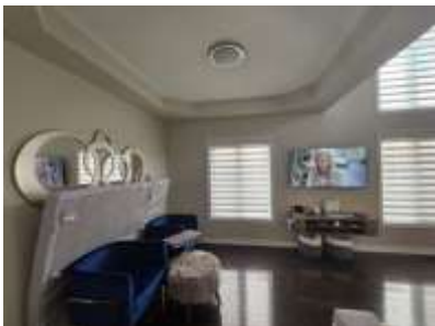
Pic. 22: Living room