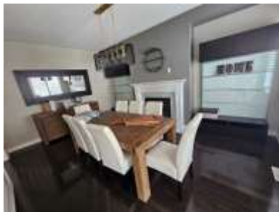
Pic. 23: Dining room