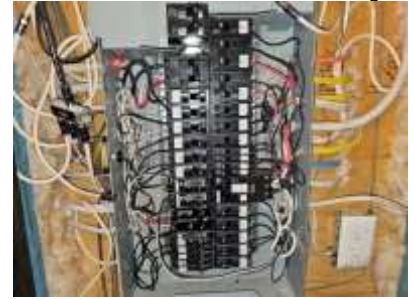
Pic. 33: 100 amp breaker panel