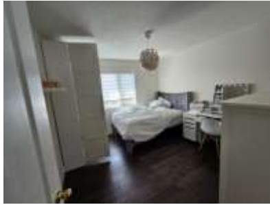
Pic. 17: Bedroom 3