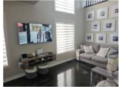
Pic. 21: Living room