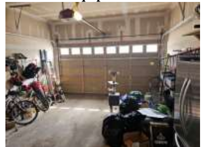
Pic. 9: Garage