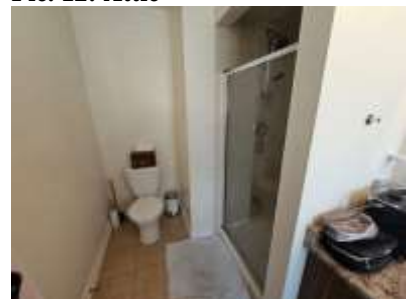
Pic. 15: Primary bathroom