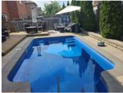
Pic. 5: In ground pool