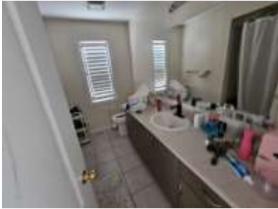
Pic. 19: 2 nd floor bathroom