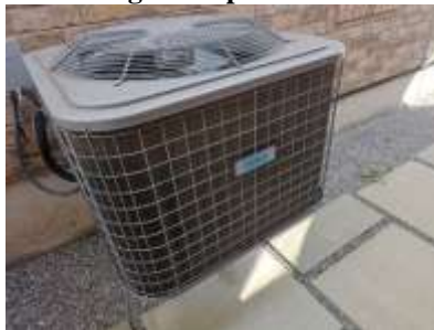
Pic. 8: AC unit 2008