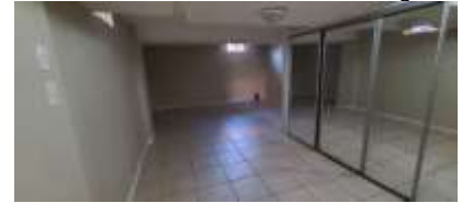
Pic. 24: Rec room