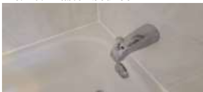
Pic. 13: Diverter seized