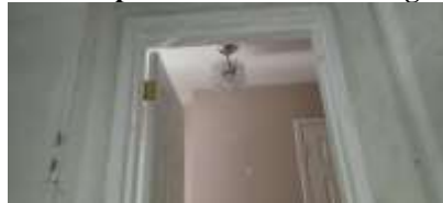
Pic. 8: Auto closer needed for garage entry door