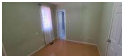
Pic. 14: Bedroom 2