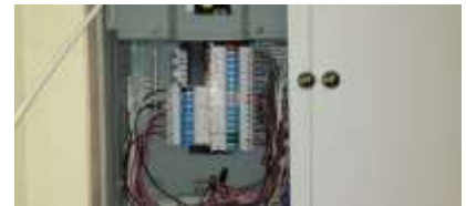
Pic. 30: 100 amp breaker panel