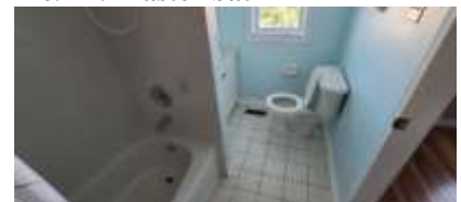
Pic. 15: 2 nd floor