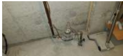
Pic. 29: Water main