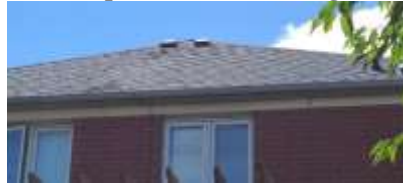
Pic. 5: Update rear roof covering