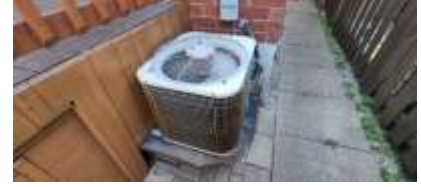
Pic. 3: AC unit 1999