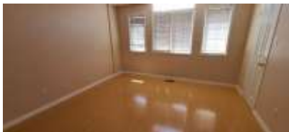
Pic. 10: Master bedroom