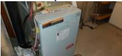
Pic. 28: Gas furnace 1999