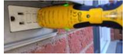
Pic. 6: Rear GFCI won't trip