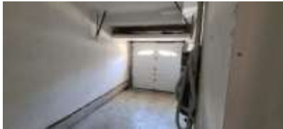
Pic. 7: Garage