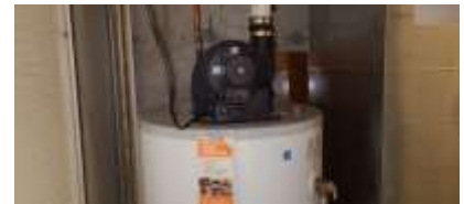
Pic. 27: Rental water heater