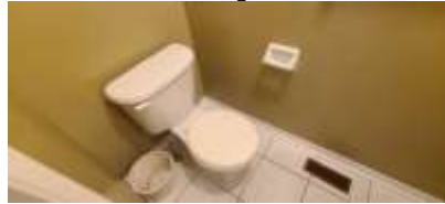
Pic. 23: Powder room