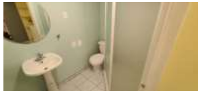
Pic. 26: Basement bath