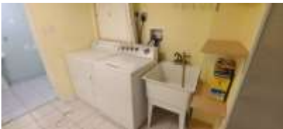
Pic. 25: Laundry