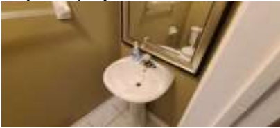
Pic. 22: Powder room