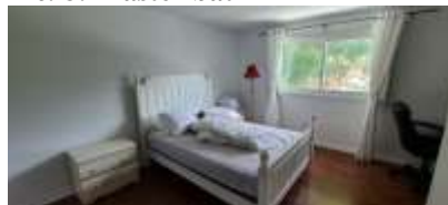
Pic. 11: Bedroom 2