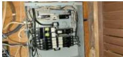
Pic. 32: Pony panel