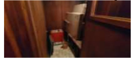
Pic. 27: Sauna