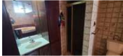
Pic. 26: Basement bath