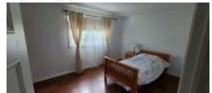
Pic. 12: Bedroom 3