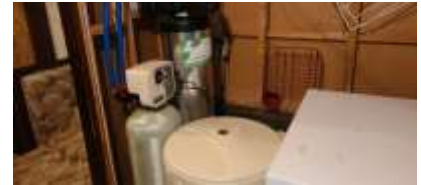
Pic. 30: Water softener