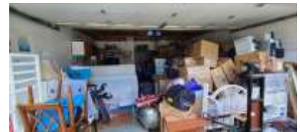
Pic. 33: Garage