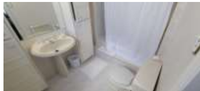
Pic. 8: Master bath