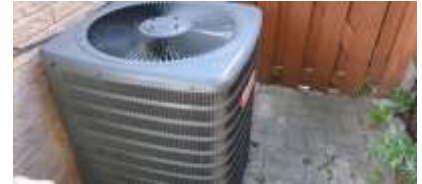
Pic. 6: AC unit