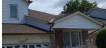
Pic. 2: Update roof covering