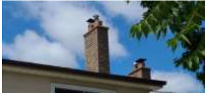
Pic. 4: Chimney