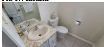
Pic. 20: Powder room