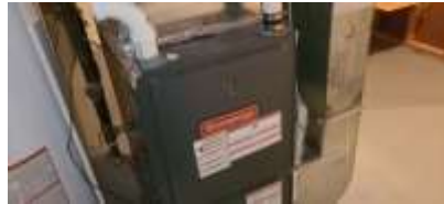
Pic. 29: Gas furnace