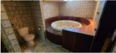
Pic. 25: Basement bath