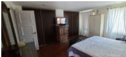
Pic. 7: Master bedroom