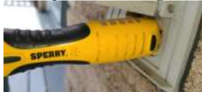
Pic. 5: No power at rear exterior outlet