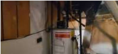
Pic. 28: Rental hot water tank