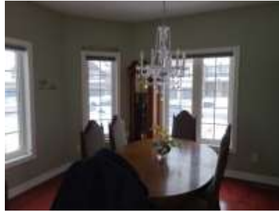
Pic. 17: Dining room