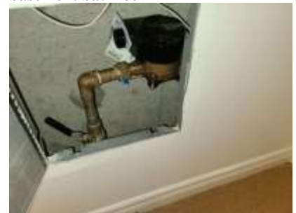
Pic. 30: Water main