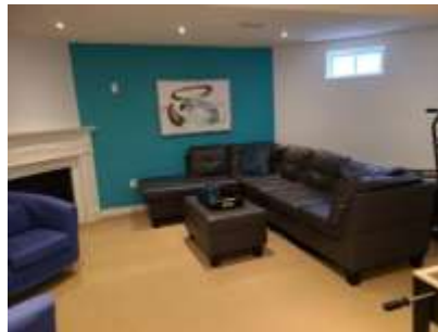
Pic. 23: Rec room