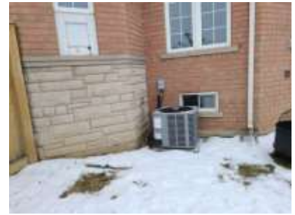
Pic. 3: AC unit 2018