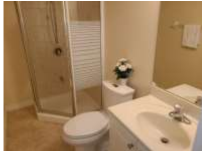
Pic. 26: Basement bath