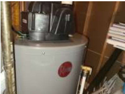
Pic. 28: New rental hot water tank