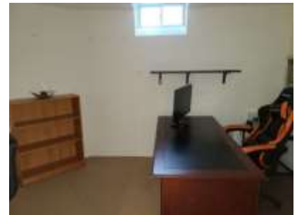
Pic. 24: Basement room