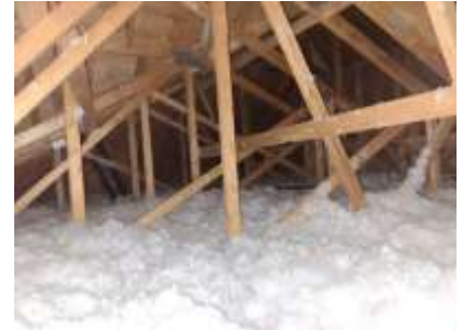
Pic. 6: Attic