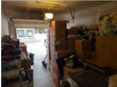
Pic. 4: Garage