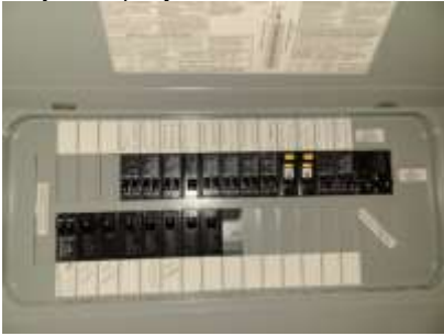
Pic. 31: 100 amp breaker panel with all copper wire – Opening in front of panel needs to be sealed