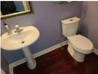
Pic. 22: Powder room