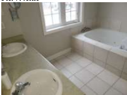
Pic. 10: Master bath