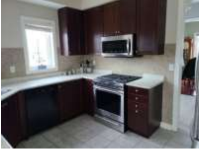
Pic. 19: Kitchen