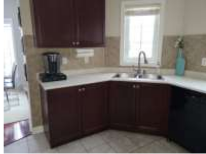
Pic. 20: Kitchen