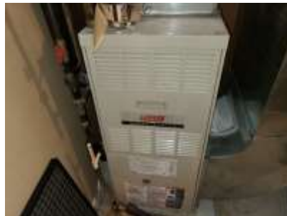
Pic. 29: Original gas furnace