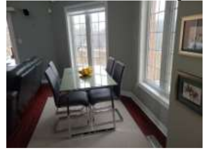
Pic. 18: Eating area