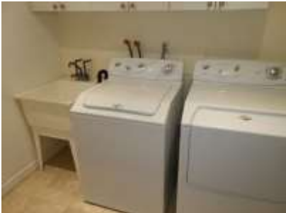
Pic. 25: Laundry