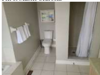
Pic. 11: Master bath