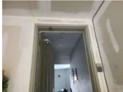
Pic. 5: Entry door auto closer needs to be connected