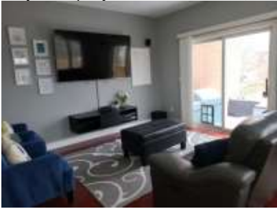
Pic. 16: Living room