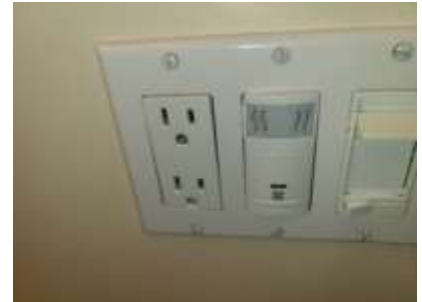
Pic. 27: No GFCI protection in basement bathroom