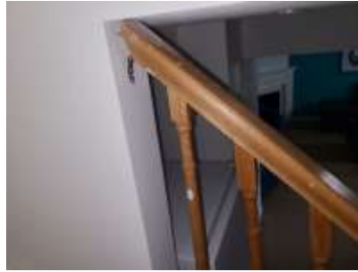
Pic. 32: Lower basement stairwell handrail loose