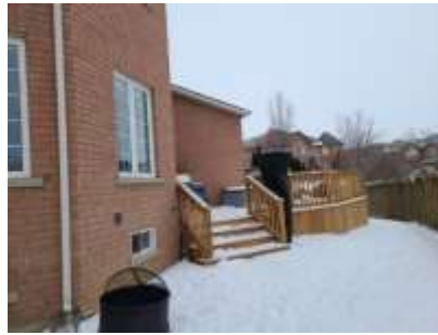
Pic. 2: Back view