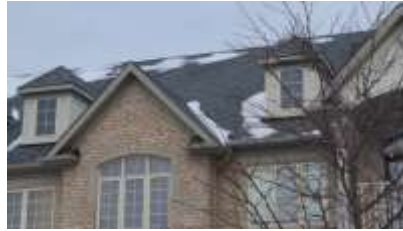
Pic. 2: Original roof covering