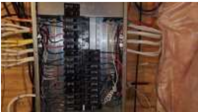
Pic. 31: 100 amp breaker panel