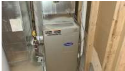
Pic. 29: Gas furnace 2010