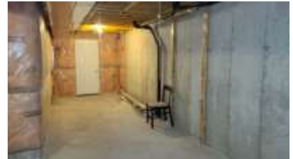
Pic. 27: Unfinished basement