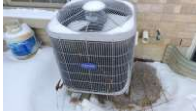
Pic. 5: AC unit 2010