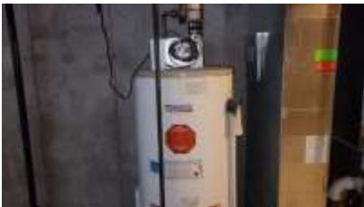
Pic. 28: Water heater 2010