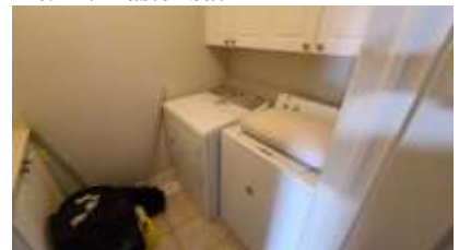
Pic. 15: Laundry