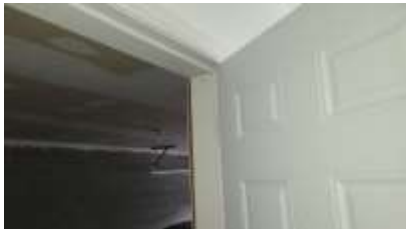
Pic. 7: Auto closer needed for garage entry door