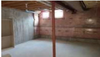
Pic. 26: Unfinished basement