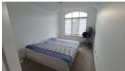
Pic. 14: Bed 3