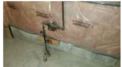
Pic. 30: Water main