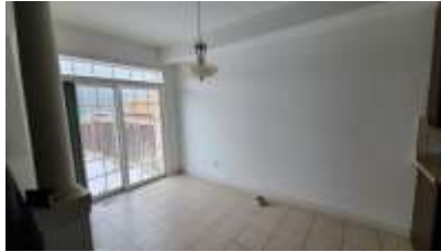
Pic. 20: Eating area