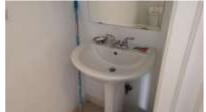
Pic. 24: Powder room