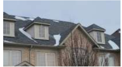
Pic. 3: Original roof covering