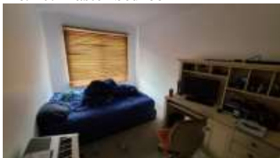
Pic. 13: Bed 2