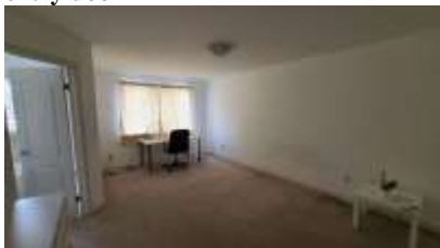
Pic. 10: Master bedroom