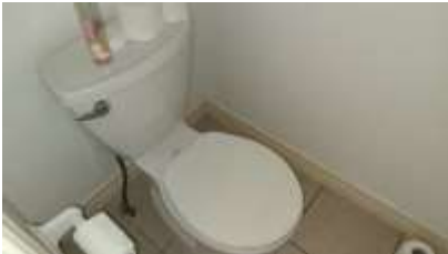
Pic. 25: Powder room