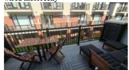
Pic. 18: Balcony