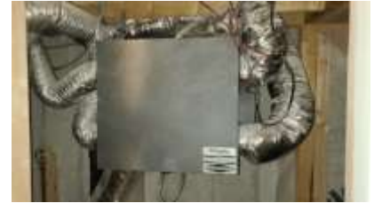
Pic. 30: HRV system