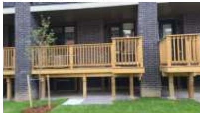
Pic. 32: Back view