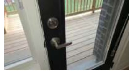
Pic. 24: Door disabled