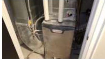
Pic. 29: Gas furnace