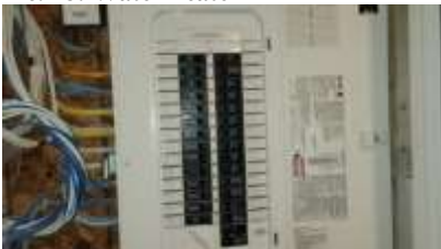
Pic. 31: 100-amp breaker panel