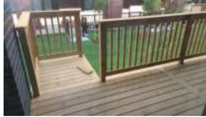
Pic. 23: Stairs to be installed for rear deck by the builder