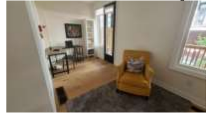
Pic. 21: Rec room