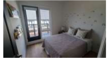
Pic. 6: Bed 2