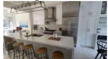
Pic. 12: Eating area