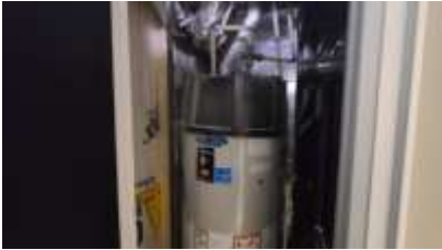
Pic. 28: Water heater