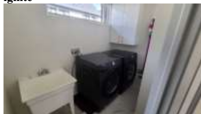
Pic. 17: Laundry