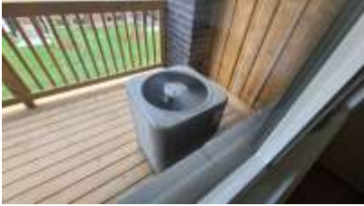
Pic. 22: AC unit