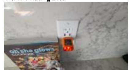
Pic. 15: Outlet to the left of cooktop wired incorrectly