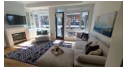
Pic. 9: Living room