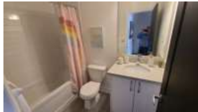
Pic. 8: 3 rd floor bath