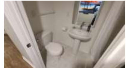
Pic. 27: Basement bath