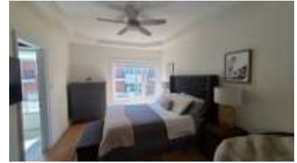
Pic. 3: Master bedroom