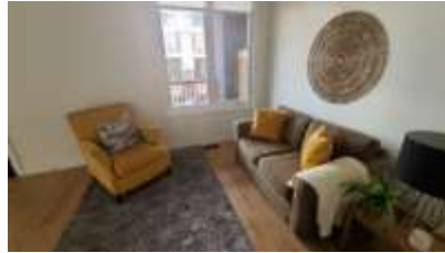
Pic. 20: Rec room