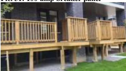
Pic. 34: Steps to be installed by builder for rear deck