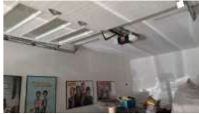
Pic. 2: Garage