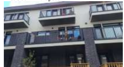
Pic. 33: Back view