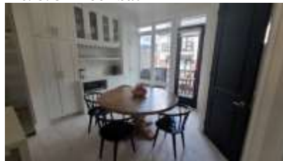
Pic. 11: Dining room