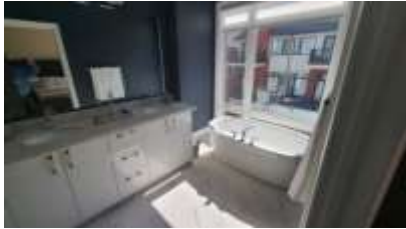
Pic. 4: Master bath