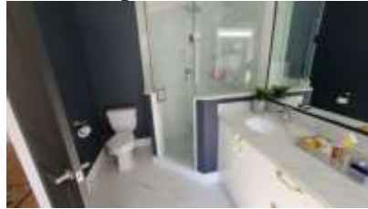
Pic. 5: Master bath