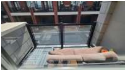
Pic. 10: Balcony