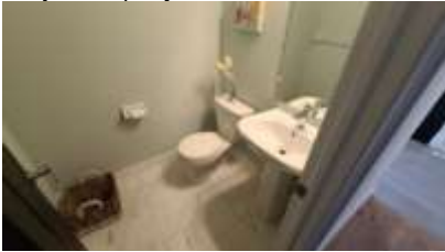
Pic. 19: Ground floor bath