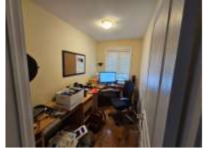
Pic. 21: 2 nd floor office