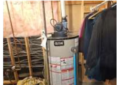
Pic. 42: Hot water tank 2018