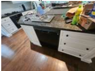
Pic. 26: Kitchen