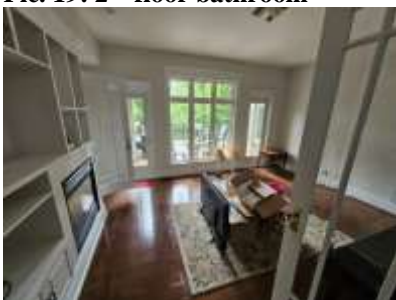
Pic. 22: Living room