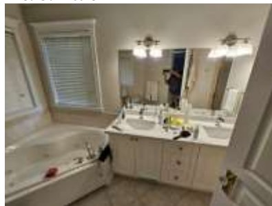
Pic. 11: Primary bathroom