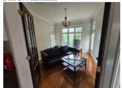
Pic. 30: Office