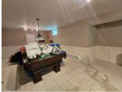
Pic. 35: Rec room