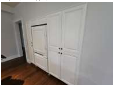
Pic. 28: Kitchen