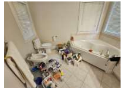
Pic. 12: Primary bathroom