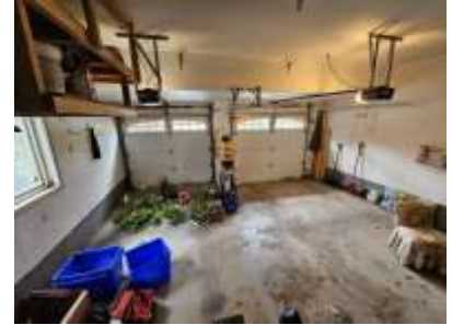
Pic. 6: Garage