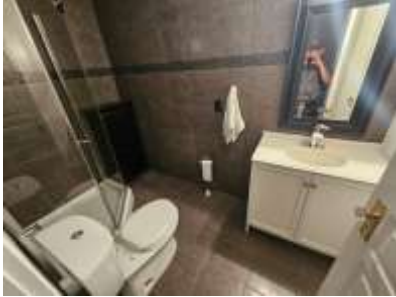
Pic. 19: 2 nd floor bathroom