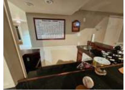
Pic. 36: Rec room