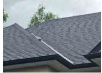
Pic. 3: Updated roof covering