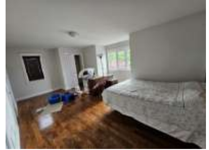
Pic. 18: Bedroom 4