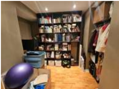
Pic. 37: Storage room