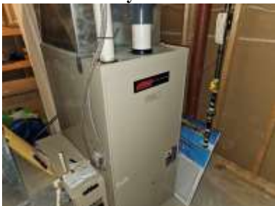
Pic. 43: Original gas furnace