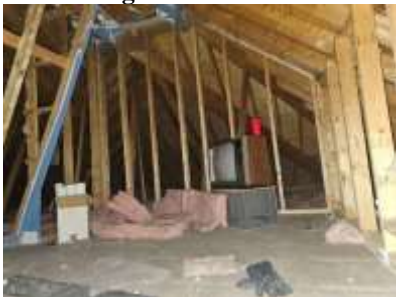
Pic. 7: Attic