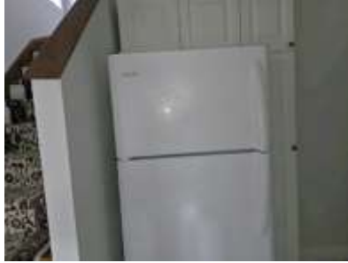
Pic. 32: Kitchenette