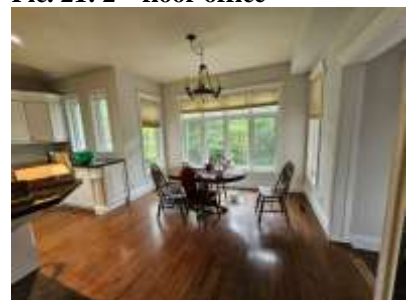
Pic. 24: Eating area