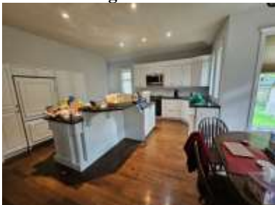
Pic. 25: Kitchen