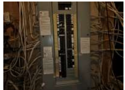
Pic. 45: 200 amp breaker panel