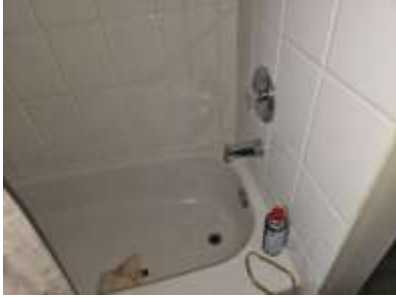
Pic. 16: Ensuite