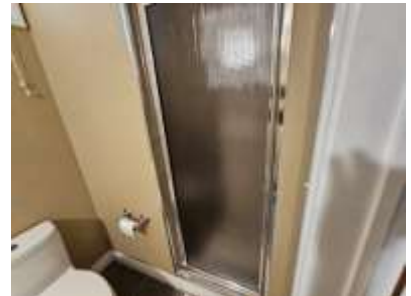
Pic. 39: Basement bathroom