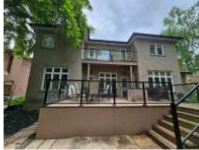
Pic. 5: Back view