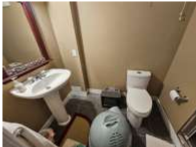
Pic. 38: Basement bathroom