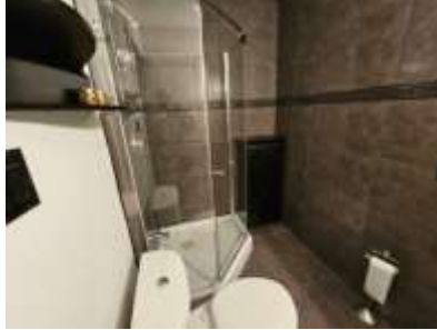
Pic. 20: 2 nd floor bathroom