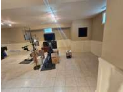
Pic. 34: Rec room