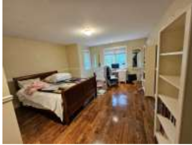
Pic. 17: Bedroom 3