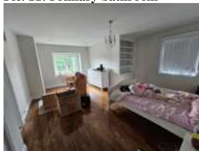
Pic. 14: Bedroom 2