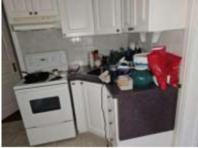
Pic. 31: Kitchenette