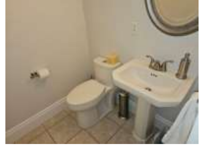
Pic. 33: Powder room