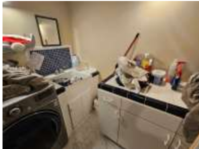
Pic. 41: Laundry