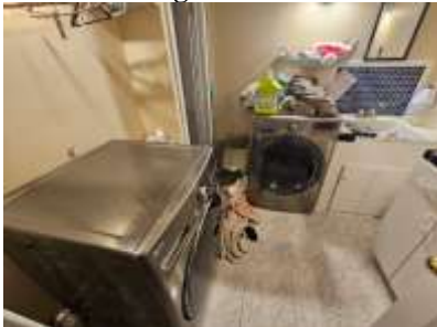
Pic. 40: Laundry