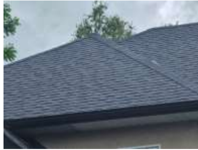
Pic. 2: Updated roof covering