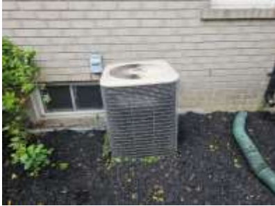
Pic. 4: Original AC unit