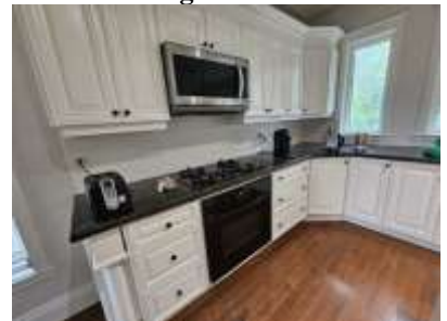
Pic. 27: Kitchen