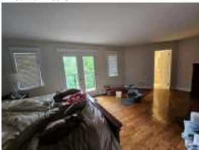
Pic. 10: Primary bedroom