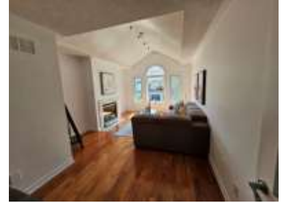
Pic. 18: Family room – gas fireplace would not fire