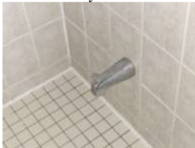
Pic. 14: Shower water diverter seized