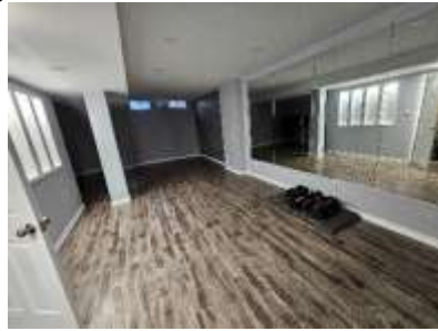
Pic. 32: Rec room