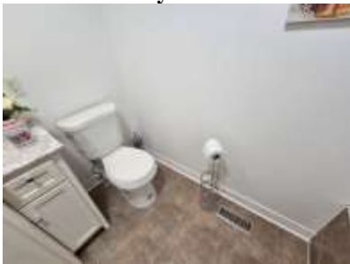
Pic. 13: Primary bathroom