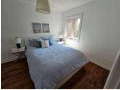
Pic. 16: Bedroom 3