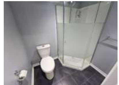
Pic. 27: Basement bathroom