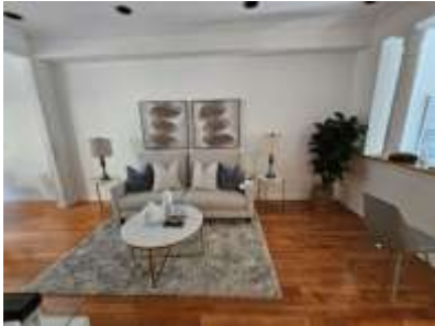
Pic. 19: Living room