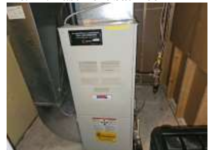
Pic. 30: Original gas furnace