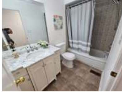
Pic. 17: 2 nd floor bathroom