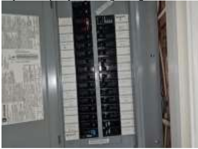
Pic. 31: 100 amp breaker panel