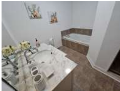
Pic. 11: Primary bathroom