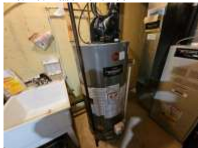
Pic. 29: Rental hot water tank 2017