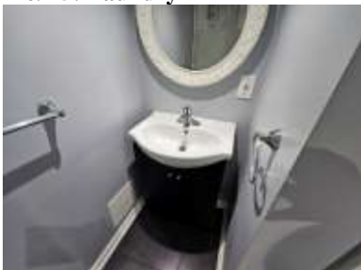
Pic. 28: Basement bathroom