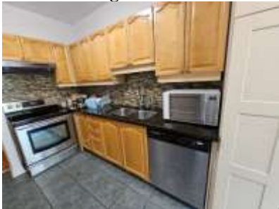
Pic. 22: Kitchen