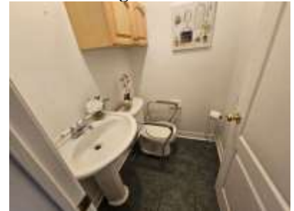
Pic. 24: Powder room