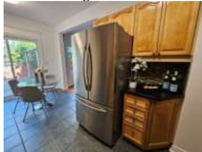
Pic. 23: Kitchen