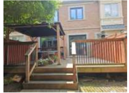
Pic. 3: Back view