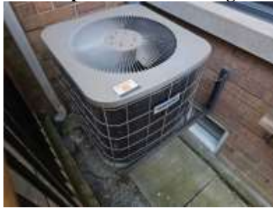
Pic. 5: AC unit 2002