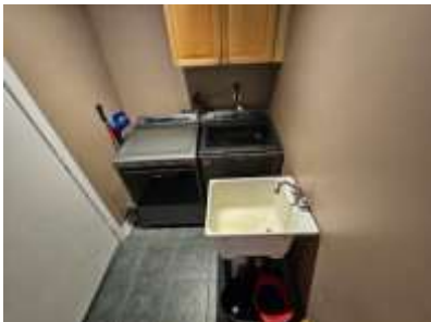
Pic. 25: Laundry