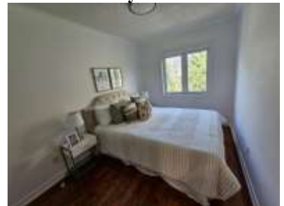
Pic. 15: Bedroom 2