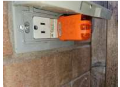
Pic. 6: Rear GFCI won't trip