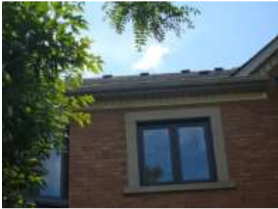
Pic. 4: Rear roof covering