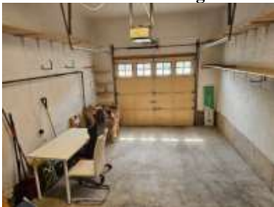
Pic. 7: Garage