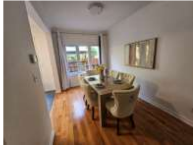
Pic. 20: Dining room