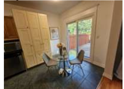
Pic. 21: Eating area