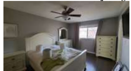
Pic. 9: Master bedroom