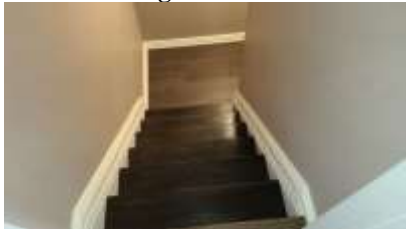
Pic. 22: Handrailing needed in basement stairwell