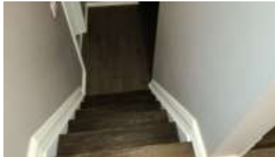
Pic. 23: Handrailing needed in basement stairwell