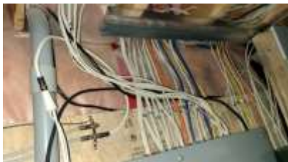
Pic. 34: Loose wires need to be properly secured