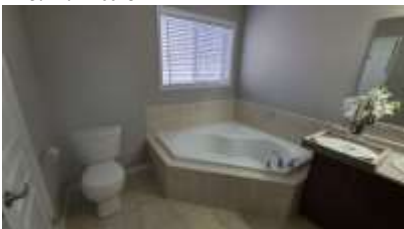
Pic. 10: Master bath