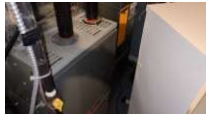
Pic. 30: Gas furnace 2005