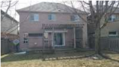
Pic. 4: Back view