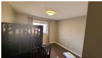
Pic. 14: Bed 3