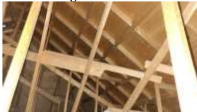
Pic. 8: Attic