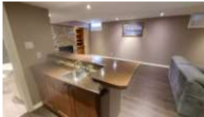
Pic. 26: Rec room