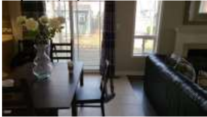
Pic. 19: Eating area