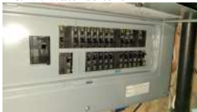
Pic. 32: 100 amp breaker panel