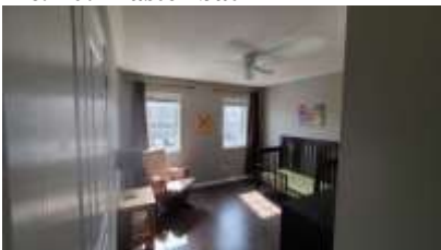
Pic. 13: Bed 2