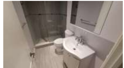
Pic. 27: basement bath