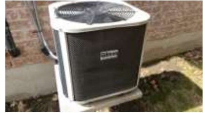
Pic. 3: AC unit 2005