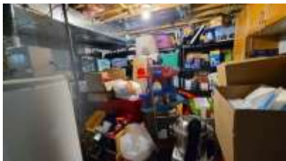
Pic. 28: Storage / Utility room