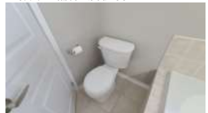
Pic. 12: Master bath