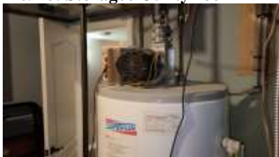
Pic. 31: Water heater 2005