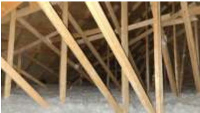
Pic. 7: Attic