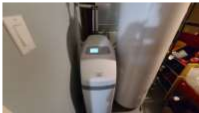
Pic. 29: Water softener