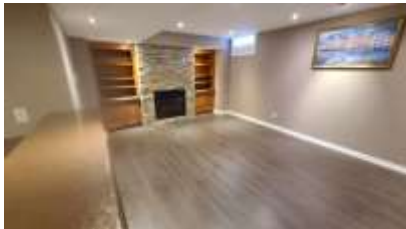
Pic. 25: Rec room