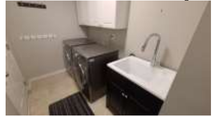
Pic. 21: Laundry