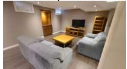
Pic. 24: Rec room