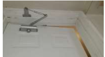
Pic. 6: Auto closer needs adjusting