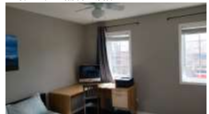
Pic. 15: Bed 4