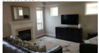
Pic. 18: Family room