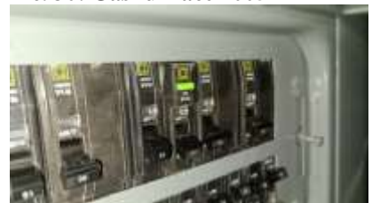
Pic. 33: Upper ARCG breaker defective and needs replacement