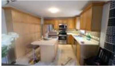
Pic. 20: Kitchen