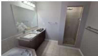
Pic. 11: Master bath