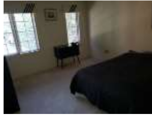
Pic. 26: Bed 4