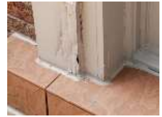
Pic. 4: Wood trim rot