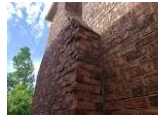
Pic. 12: Spalling of brick on chimney