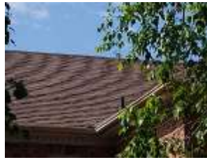
Pic. 2: Updated roof covering