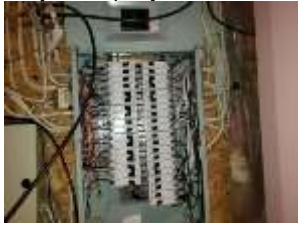
Pic. 53: 200 amp breaker panel with all copper wire