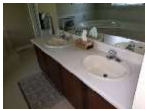
Pic. 18: Master bath