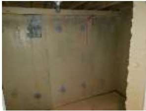
Pic. 49: Cold room, possible leaks from tie back holes