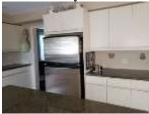
Pic. 37: Kitchen