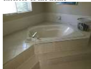
Pic. 19: Master bath