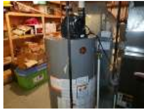
Pic. 50: Rental hot water tank