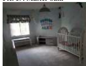
Pic. 23: Bed 2