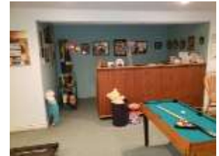
Pic. 44: Rec room