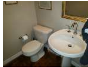
Pic. 39: Powder room