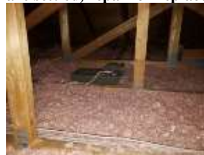
Pic. 15: One visible exhaust fan motor not vented to the exterior of the home