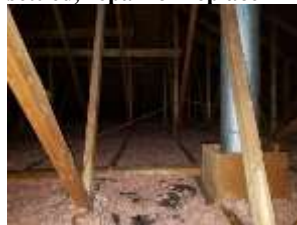
Pic. 14: Attic – low insulation level