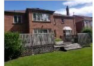
Pic. 8: Back view