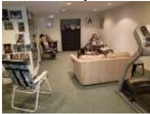
Pic. 45: Rec room