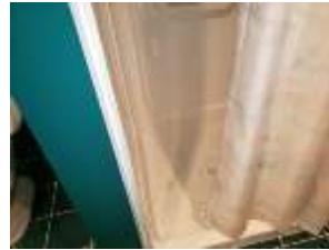
Pic. 47: Basement bath