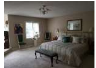
Pic. 16: Master bedroom