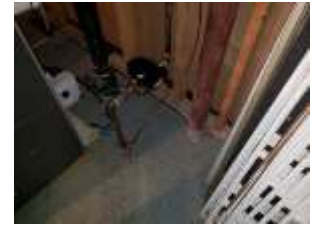
Pic. 52: Water main