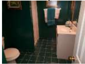
Pic. 46: Basement bath