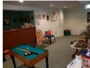
Pic. 43: Rec room