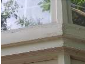
Pic. 5: Wood window frames rot