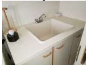
Pic. 42: Laundry