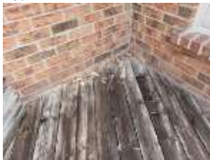
Pic. 9: Spalling of brick at rear of the home