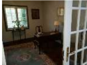
Pic. 34: Office