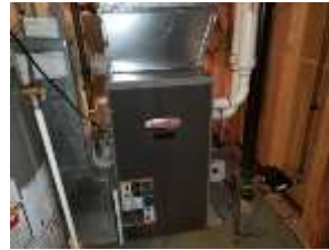
Pic. 51: Gas furnace 2008