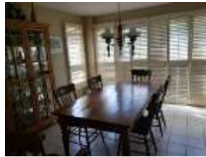
Pic. 38: Eating area