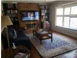
Pic. 33: Family room