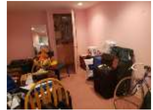
Pic. 48: Basement room