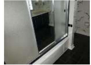
Pic. 28: 2 nd floor bath