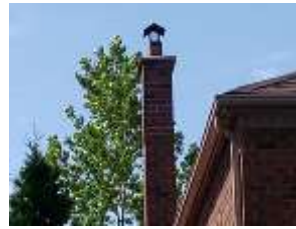
Pic. 3: Chimney