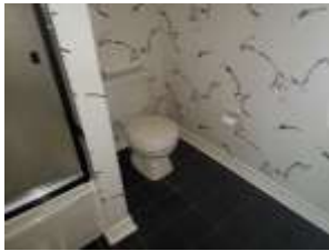
Pic. 29: 2 nd floor bath