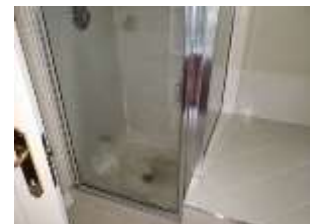
Pic. 20: Master bath