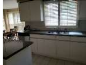
Pic. 35: Kitchen