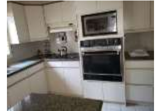
Pic. 36: Kitchen