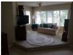
Pic. 17: Master bedroom