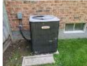
Pic. 7: AC unit 2008