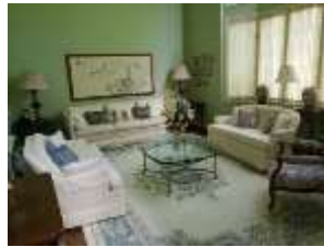
Pic. 30: Living room