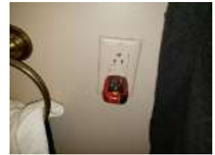
Pic. 40: GFCI defective