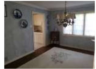
Pic. 32: Dining room