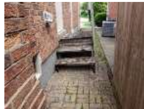
Pic. 11: Side steps and deck in poor condition and piers are settled, repair or replace