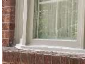
Pic. 6: Wood window frames rot