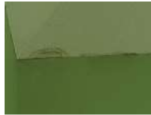
Pic. 31: Old moisture stains on ceiling now all dry