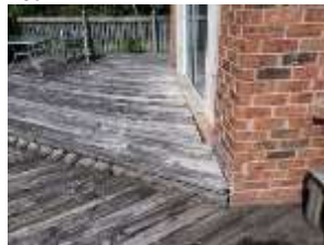
Pic. 10: Deck in poor condition and piers are settled, repair or replace