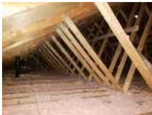
Pic. 13: Attic – low insulation level