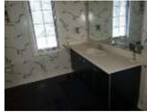
Pic. 27: 2 nd floor bath