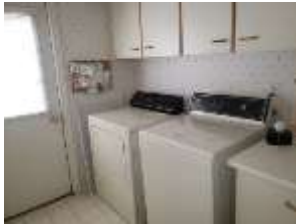
Pic. 41: Laundry