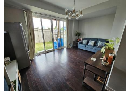
Pic. 18: Family room