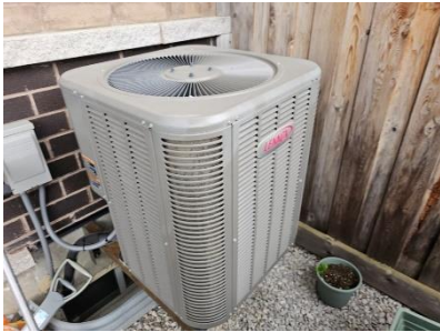
Pic. 4: AC unit 2017