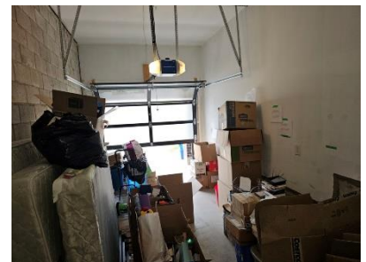
Pic. 27: Garage