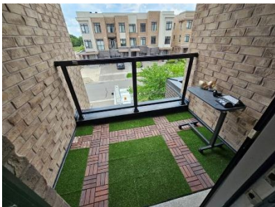
Pic. 10: Front balcony