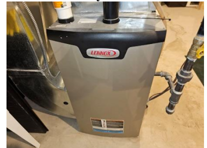
Pic. 24: Gas furnace 2017