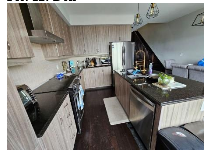
Pic. 15: Kitchen