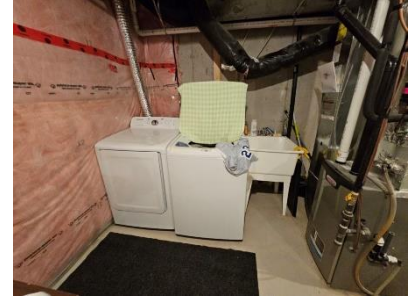
Pic. 21: Laundry