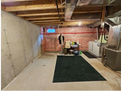
Pic. 19: Basement