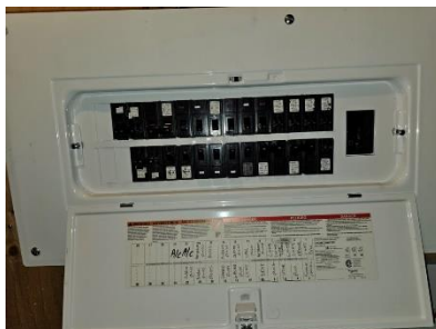
Pic. 26: 100 amp breaker panel