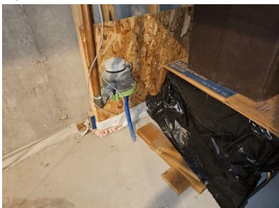
Pic. 25: Water main