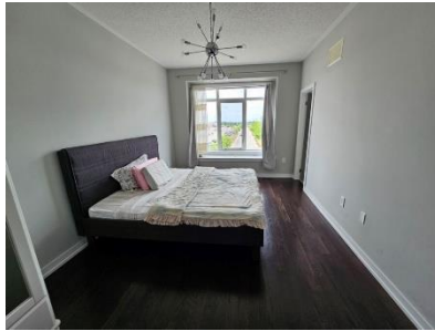
Pic. 5: Primary bedroom