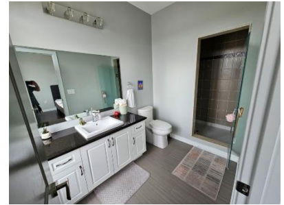
Pic. 6: Primary bathroom