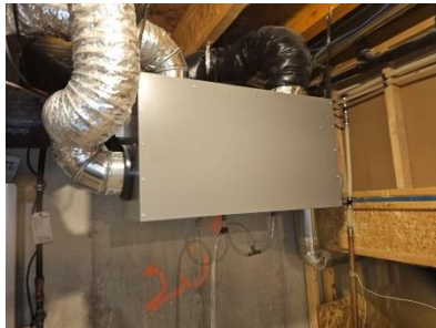
Pic. 23: HRV