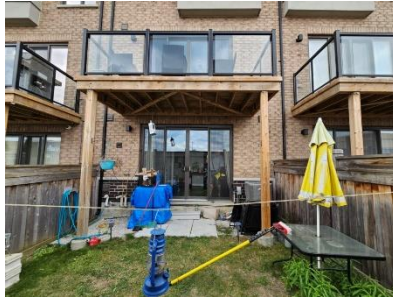
Pic. 2: Back view