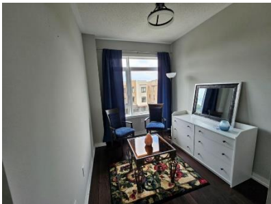
Pic. 7: Bedroom 2