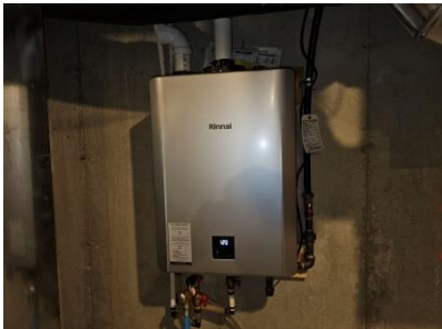
Pic. 22: Tankless hot water system 2024