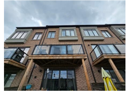
Pic. 3: Back view