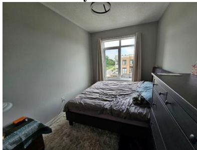
Pic. 8: Bedroom 3