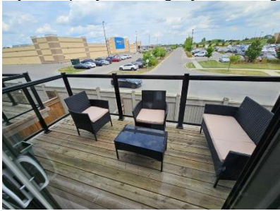
Pic. 16: Back balcony