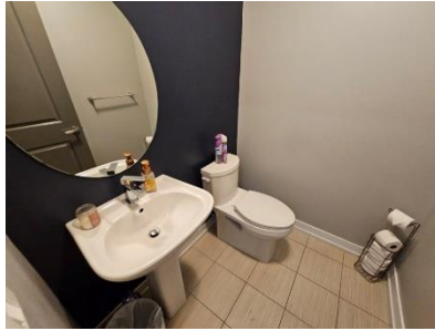
Pic. 17: Powder room