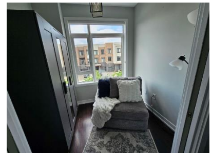
Pic. 12: Den