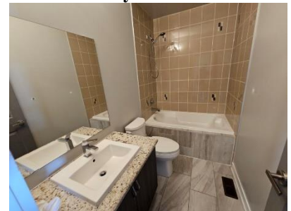
Pic. 9: 3 rd floor bathroom