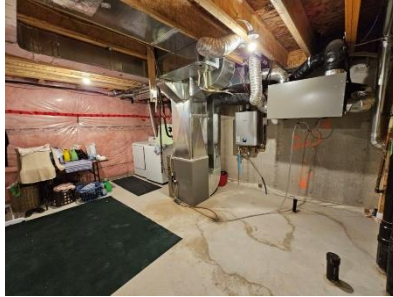
Pic. 20: Basement