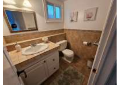
Pic. 21: Powder room