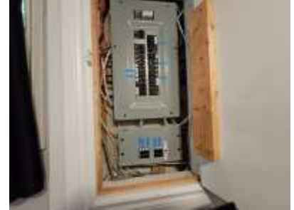
Pic. 36: 100 amp main breaker panel and pony panel – all copper wire