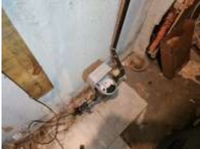
Pic. 34: Water main