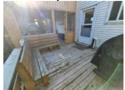
Pic. 9: Deck