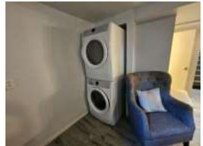
Pic. 24: Basement laundry