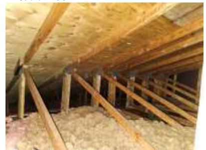
Pic. 12: Attic