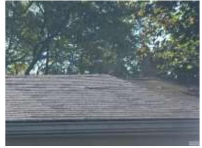
Pic. 3: Roof covering