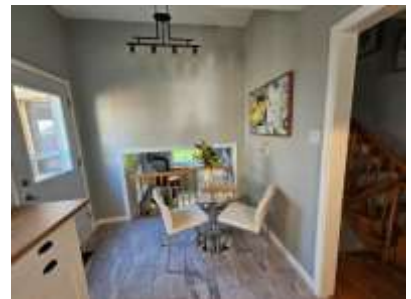
Pic. 15: Eating area