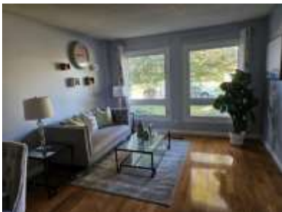
Pic. 13: Living room