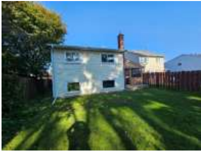
Pic. 4: Back view