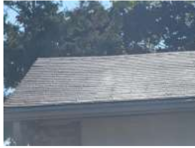
Pic. 2: Roof covering