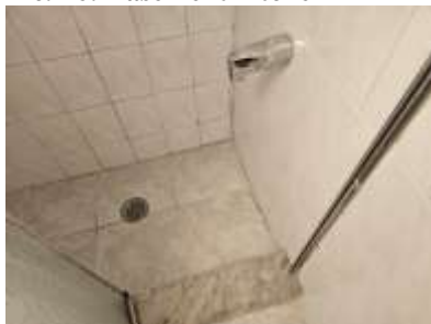
Pic. 29: Caulking advised inside shower