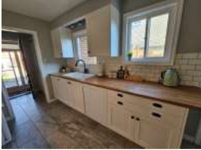
Pic. 16: Main kitchen