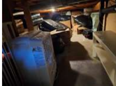
Pic. 35: Crawl space