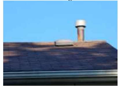
Pic. 6: Rear roof covering – 1 missing shingle tab on the right side near the top of the roof line