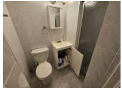
Pic. 27: Basement bathroom