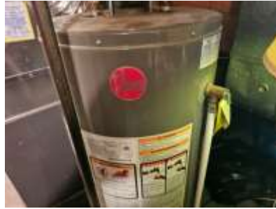
Pic. 32: Rental hot water tank 2013