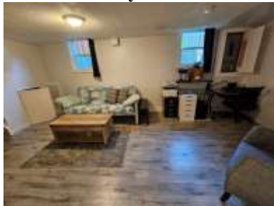
Pic. 23: Basement room