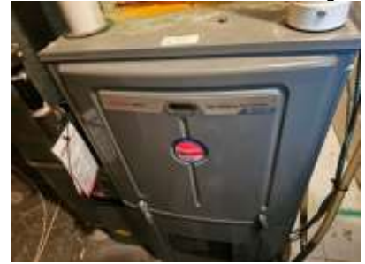
Pic. 33: Gas furnace 2016