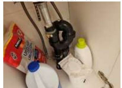
Pic. 30: Changing sink drain to a property "P" trap advised