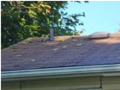
Pic. 7: Roof covering