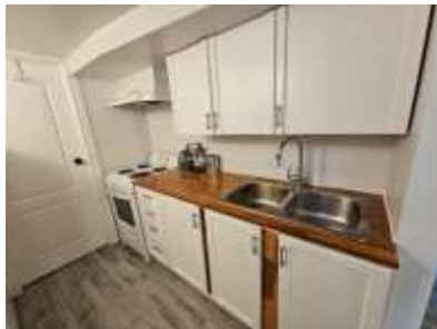
Pic. 26: Basement kitchen