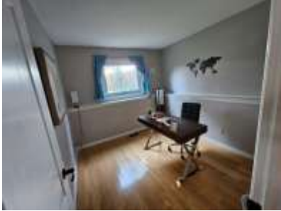
Pic. 19: Bedroom 3