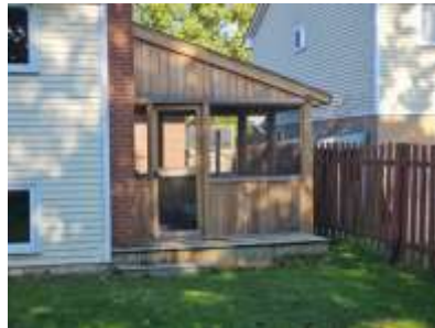
Pic. 8: Screened in deck area