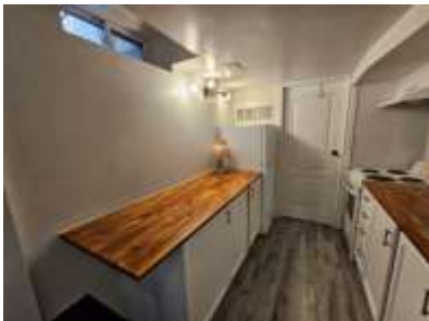
Pic. 25: Basement kitchen