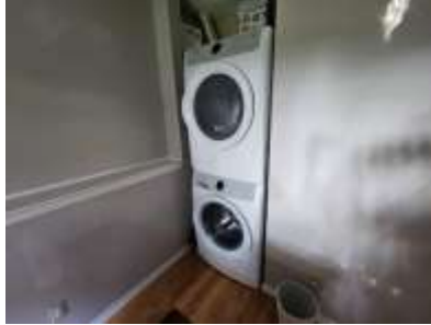
Pic. 20: Laundry