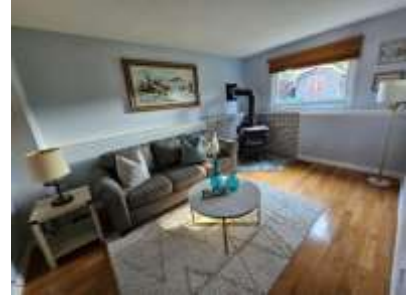
Pic. 18: Rec room