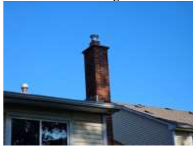
Pic. 5: Chimney