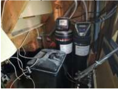
Pic. 31: Water softener – unplugged