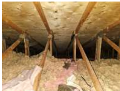
Pic. 11: Attic