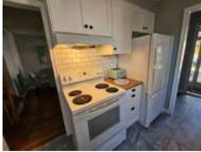
Pic. 17: Main kitchen