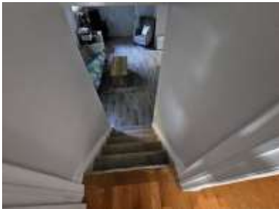
Pic. 22: Handrailing in stairwell advised