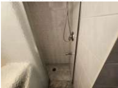
Pic. 28: Basement bathroom