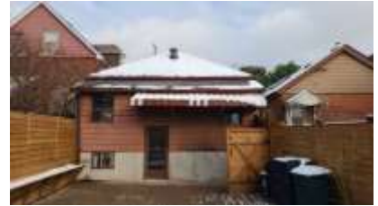
Pic. 3: Back view