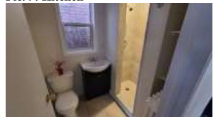
Pic. 12: Bathroom