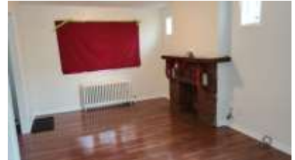
Pic. 6: Living room – fireplace disabled