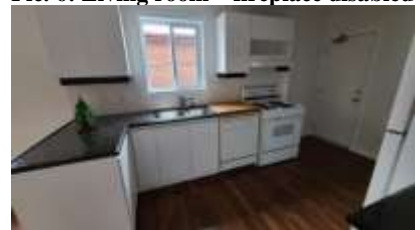
Pic. 9: Kitchen