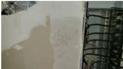
Pic. 28: Metal safety plates should be installed in this area to protected wiring under the drywall