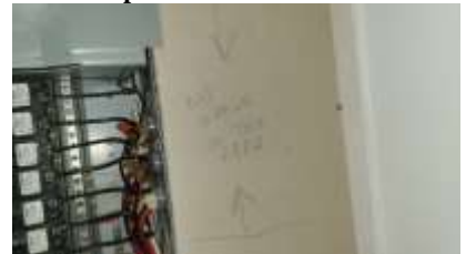
Pic. 27: Metal safety plates should be installed in this area to protected wiring under the drywall