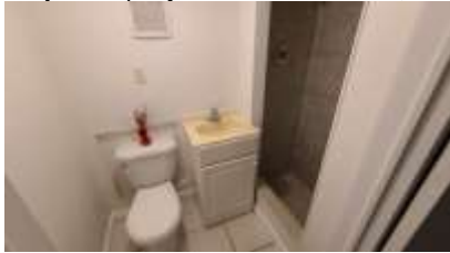
Pic. 19: Apt – Bathroom