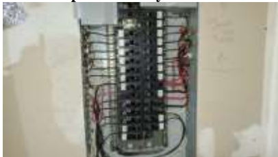
Pic. 25: 100 amp breaker panel with all copper wire