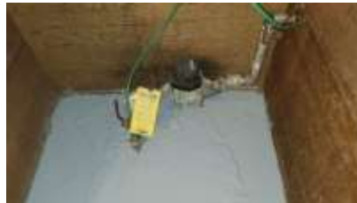
Pic. 29: Water main