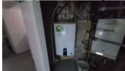
Pic. 23: Tankless hot water system