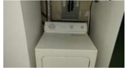
Pic. 21: Apt- Laundry