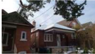
Pic. 2: Roof covering snow covered