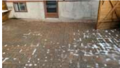
Pic. 5: Back patio