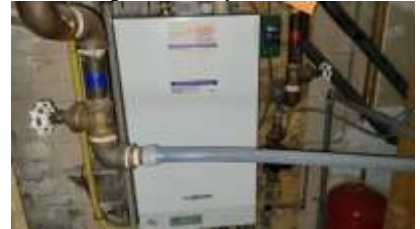
Pic. 24: Updated boiler