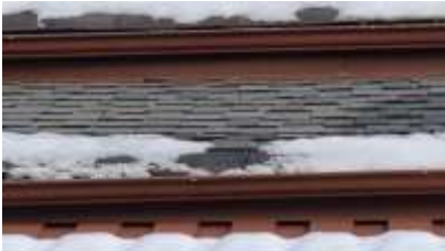
Pic. 4: Visible roof section