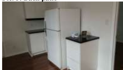
Pic. 8: Kitchen