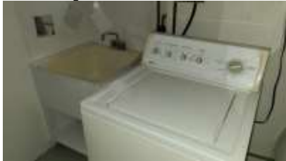
Pic. 22: Apt – Laundry