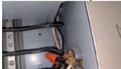
Pic. 26: Wires going ouder disconnect panel should be rerouted properly