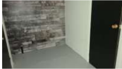
Pic. 20: Apt – Basement / Storage room