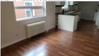
Pic. 7: Dining room