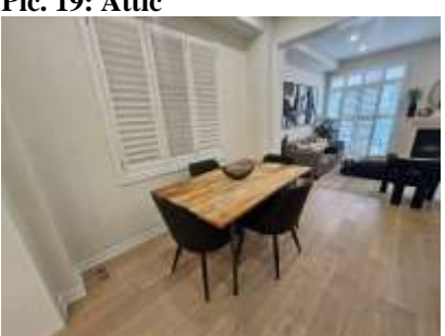
Pic. 22: Eating area