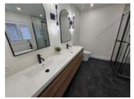
Pic. 12: Primary bath