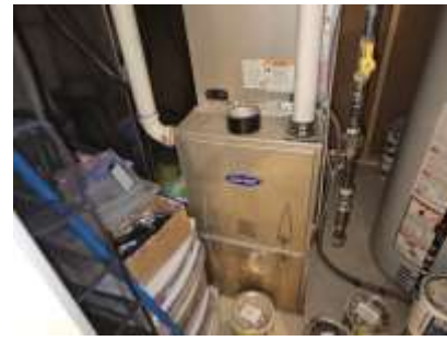
Pic. 32: Gas furnace 2022