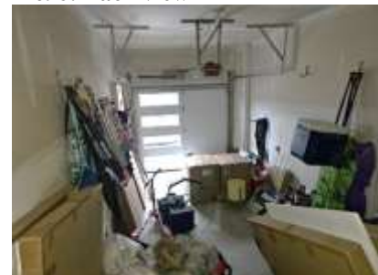
Pic. 9: Garage