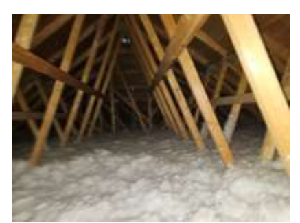
Pic. 19: Attic