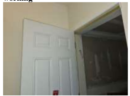
Pic. 10: No auto closer on garage entry door