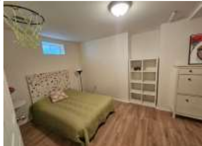
Pic. 29: Bedroom 4