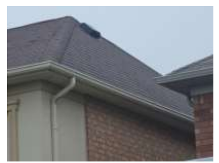
Pic. 3: Original roof covering