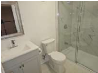
Pic. 34: Basement bathroom