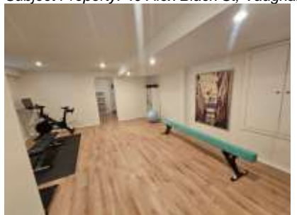
Pic. 28: Rec room