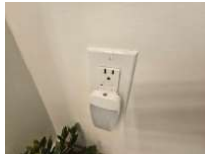
Pic. 17: Bathroom and powder room GFCI outlet defective