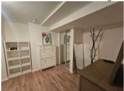
Pic. 30: Bedroom 4