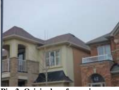
Pic. 2: Original roof covering