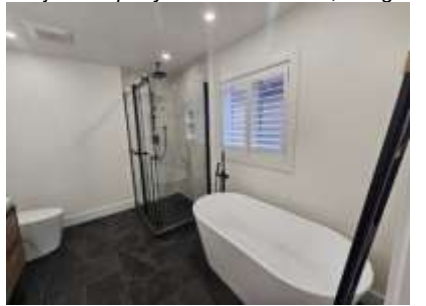
Pic. 13: Primary bath