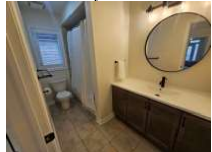
Pic. 16: 2<sup>nd</sup> floor bath