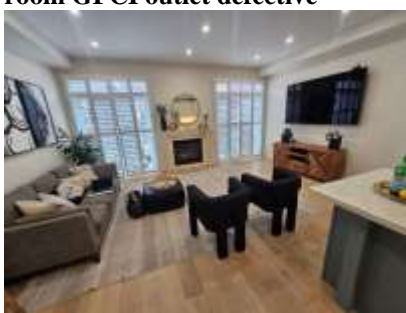
Pic. 20: Living room