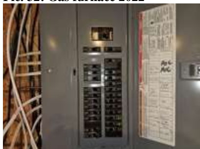
Pic. 35: 100 amp breaker panel