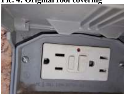
Pic. 7: Exterior GFCI outlets not working