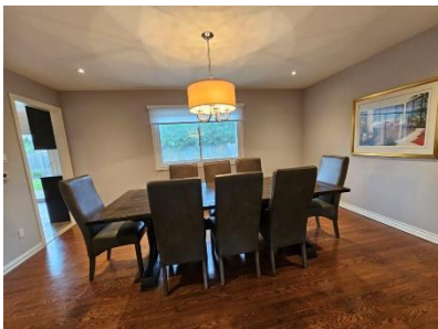
Pic. 22: Dining room