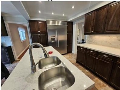
Pic. 25: Kitchen