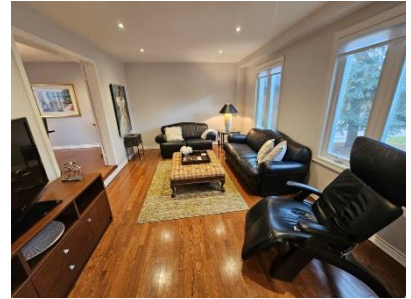
Pic. 21: Living room