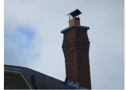
Pic. 6: Chimney