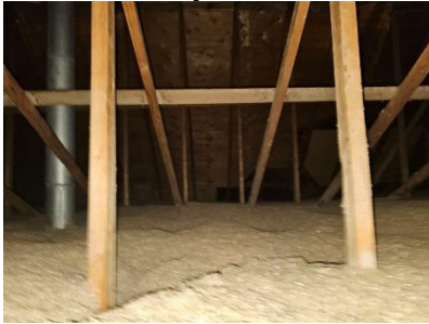
Pic. 19: Attic