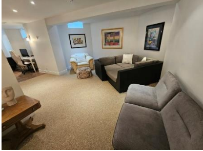
Pic. 31: Rec room