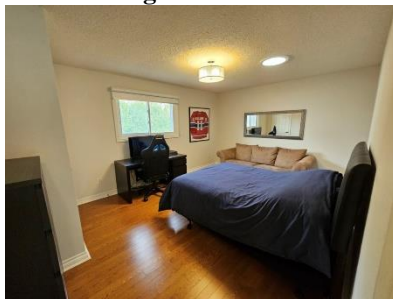
Pic. 11: Bedroom 3