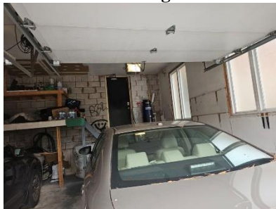
Pic. 8: Garage