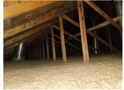
Pic. 18: Attic