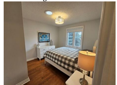
Pic. 12: Bedroom 4