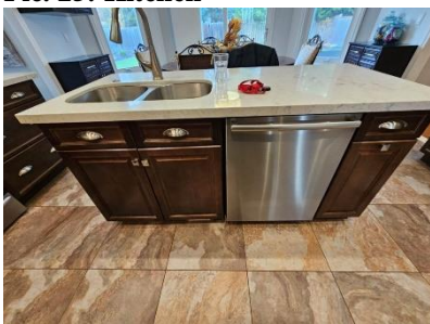
Pic. 28: Kitchen