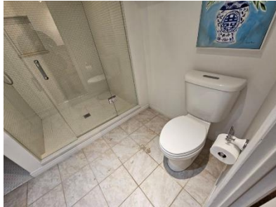
Pic. 35: Basement bathroom