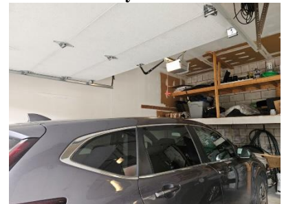
Pic. 9: Garage