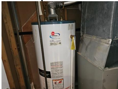
Pic. 41: Hot water tank 2009