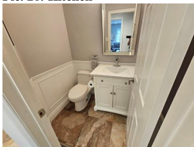
Pic. 29: Powder room