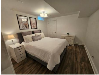
Pic. 32: Bedroom 5