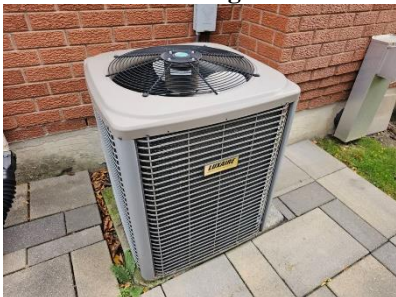
Pic. 7: AAC compressor