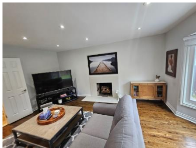
Pic. 23: Family room