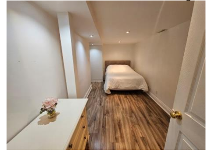
Pic. 33: Bedroom 6 / Basement room