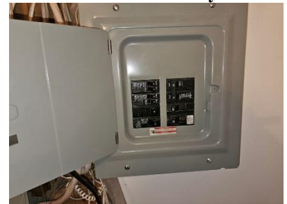
Pic. 42: Pony panel