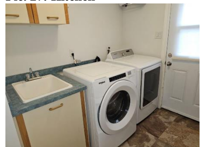
Pic. 30: Laundry