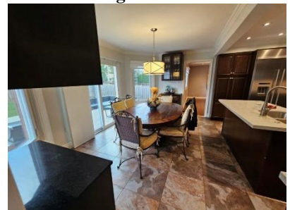
Pic. 24: Eating area