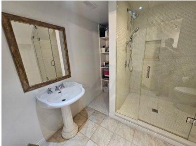
Pic. 34: Basement bathroom