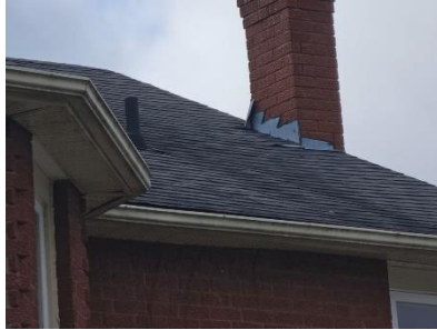
Pic. 5: Roof covering