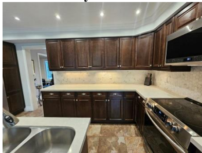
Pic. 26: Kitchen