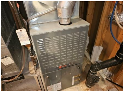
Pic. 40: Gas furnace 2005