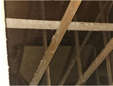
Pic. 20: Attic