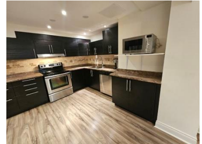
Pic. 36: Basement kitchen