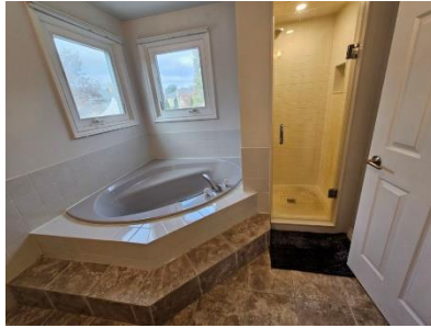
Pic. 17: Primary bathroom