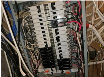
Pic. 43: 200 amp main electrical panel