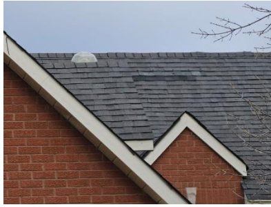
Pic. 2: Roof covering with repair