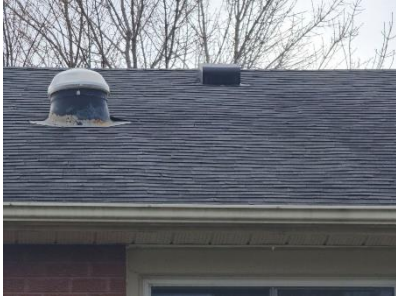
Pic. 4: Roof covering