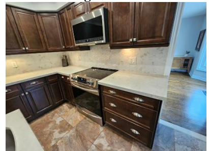
Pic. 27: Kitchen