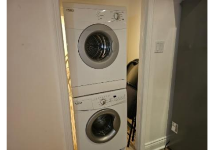
Pic. 39: Basement laundry