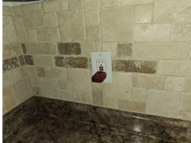
Pic. 38: No power at outlet