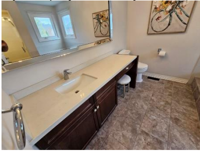
Pic. 16: Primary bathroom