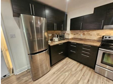
Pic. 37: Basement kitchen