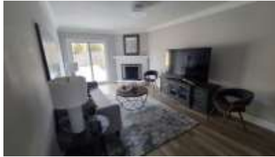
Pic. 20: Family room