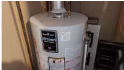
Pic. 32: Hot water tank 2010