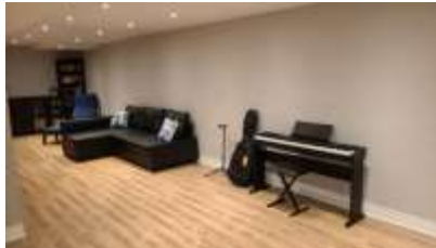
Pic. 26: Rec room