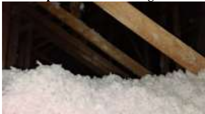
Pic. 7: Attic