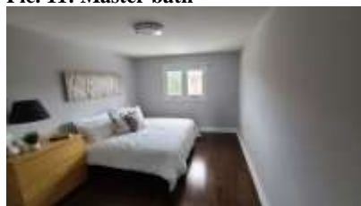
Pic. 14: Bed 4