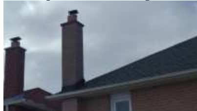
Pic. 5: Chimney