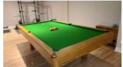
Pic. 27: Rec room