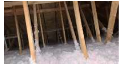
Pic. 9: Attic