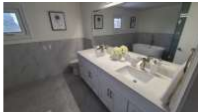
Pic. 11: Master bath