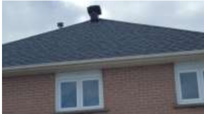
Pic. 4: Updated roof covering