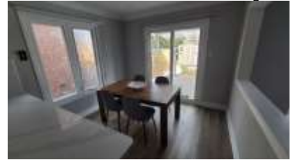
Pic. 21: Eating area