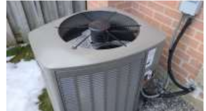
Pic. 6: AC unit 2020