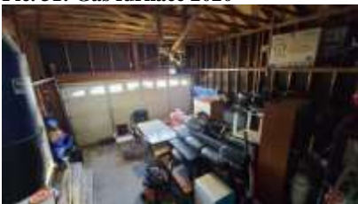
Pic. 34: Garage