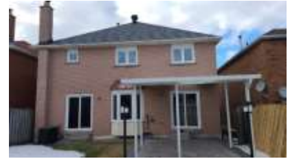
Pic. 3: Back view