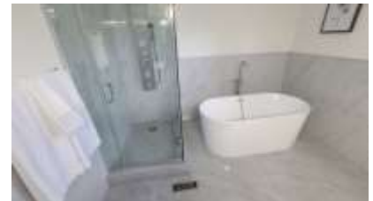
Pic. 12: Master bath