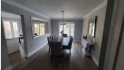
Pic. 19: Dining room