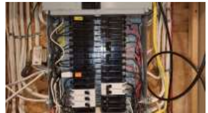
Pic. 33: 100 amp breaker panel