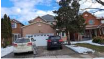
Pic. 1: Front view