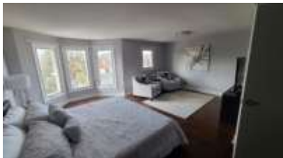
Pic. 10: Master bedroom