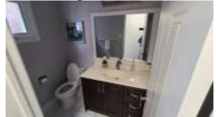
Pic. 24: Powder room