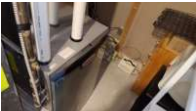
Pic. 31: Gas furnace 2020