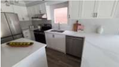
Pic. 22: Kitchen