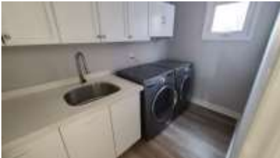
Pic. 25: Laundry