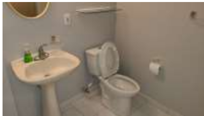
Pic. 29: Basement bath