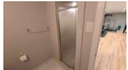
Pic. 30: Basement bath