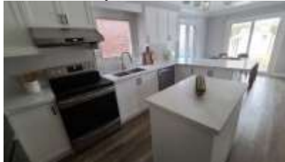
Pic. 23: Kitchen