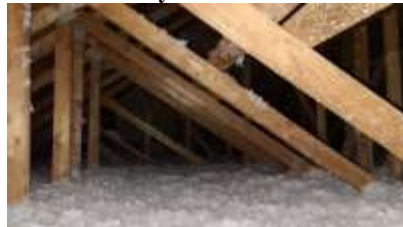
Pic. 8: Attic