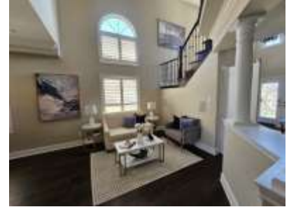
Pic. 21: Living room