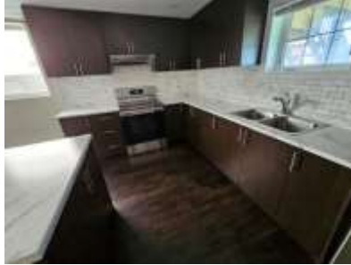
Pic. 35: Apt - kitchen