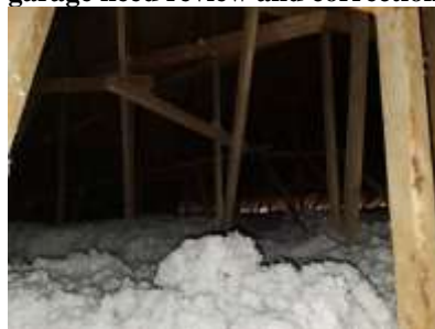
Pic. 11: Attic