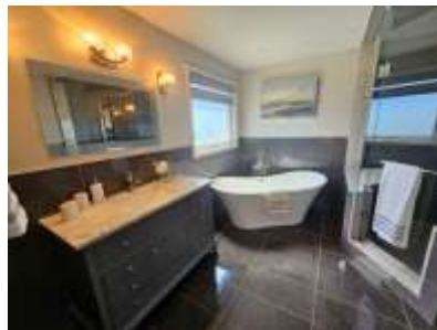
Pic. 14: Primary bathroom