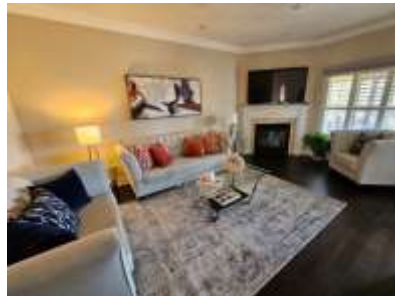
Pic. 23: Family room