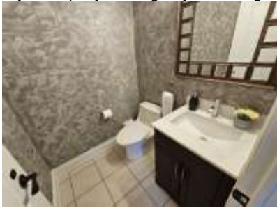
Pic. 31: Powder room