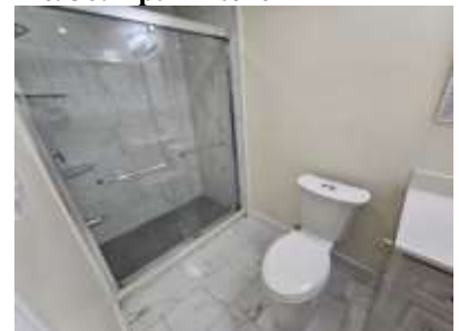
Pic. 39: Apt -bathroom