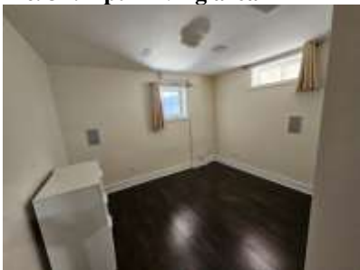
Pic. 37: Apt - bedroom