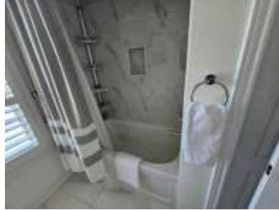
Pic. 20: 2 nd floor bathroom