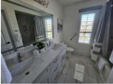
Pic. 19: 2 nd floor bathroom