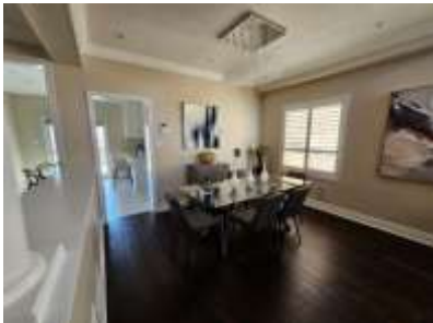
Pic. 22: Dining room