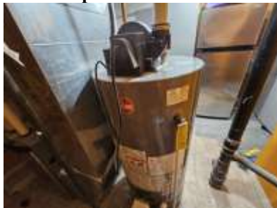
Pic. 41: Rental hot water tank 2002