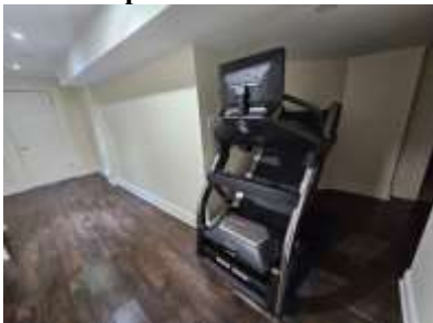
Pic. 40: Basement room