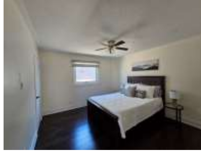
Pic. 17: Bedroom 3