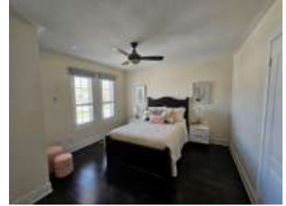
Pic. 18: Bedroom 4