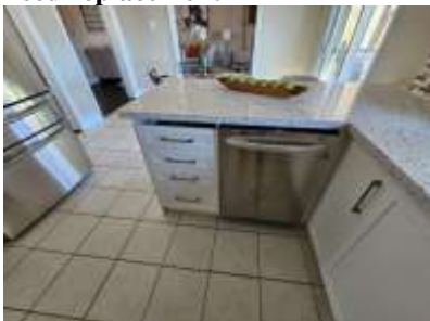
Pic. 28: Kitchen