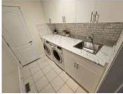
Pic. 32: Laundry