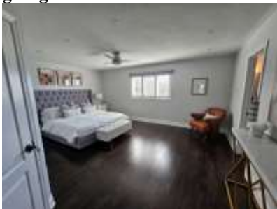
Pic. 13: Primary bedroom