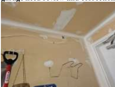
Pic. 10: Handyman wiring in garage need review and correction