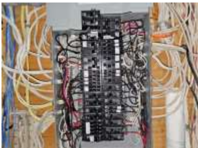
Pic. 43: 100 ap breaker panel