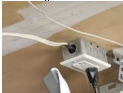
Pic. 8: Handyman wiring in garage need review and correction