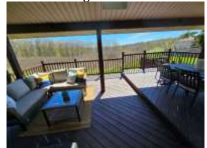
Pic. 24: Deck