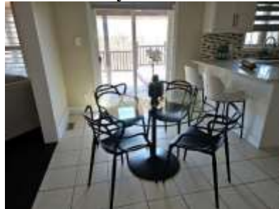
Pic. 26: Eating area