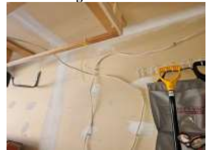
Pic. 9: Handyman wiring in garage need review and correction