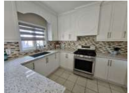
Pic. 27: Kitchen