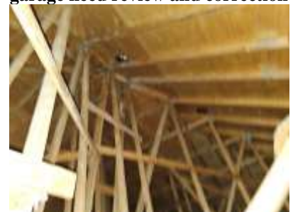
Pic. 12: Attic