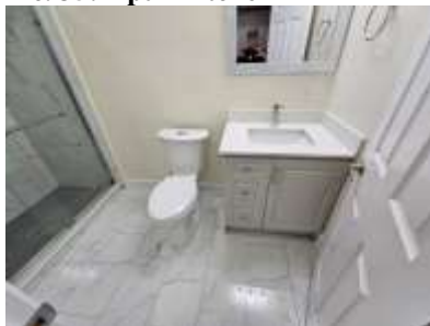
Pic. 38: Apt - bathroom