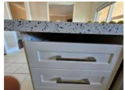
Pic. 30: Missing spacer above drawers