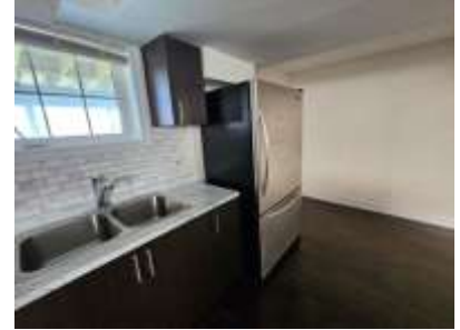
Pic. 36: Apt - kitchen