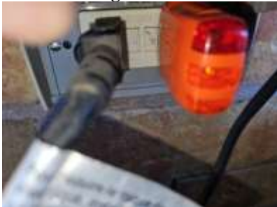
Pic. 25: GFCI outlet defective, need replacement