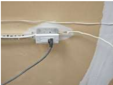
Pic. 7: Handyman wiring in garage need review and correction