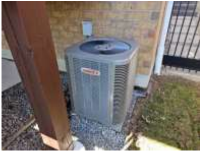
Pic. 4: AC unit 2022