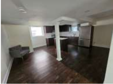
Pic. 34: Apt - living area