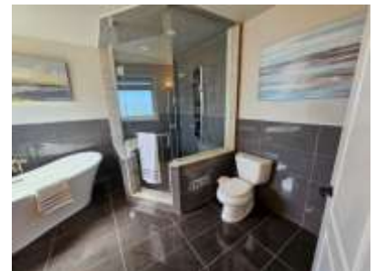
Pic. 15: Primary bathroom