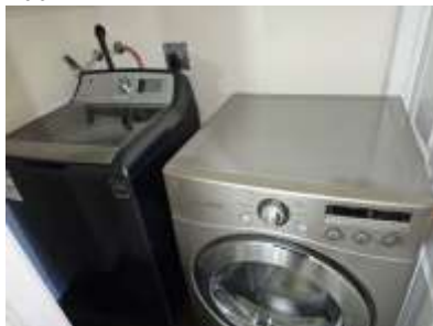
Pic. 44: Apt - laundry