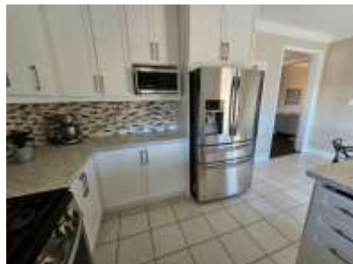
Pic. 29: Kitchen