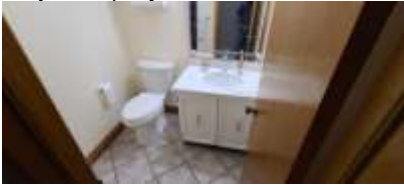
Pic. 22: Powder room