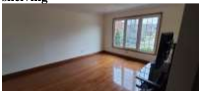
Pic. 16: Living room