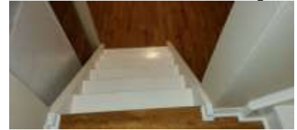
Pic. 24: Handrailing advised for lower basement stairs