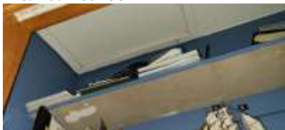
Pic. 13: Attic access blocked by shelving