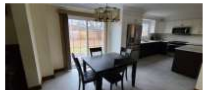
Pic. 18: Eating area