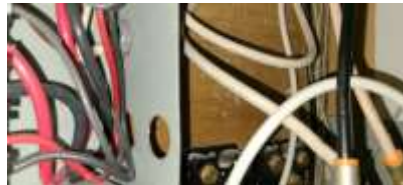
Pic. 38: Opening in panel need to be sealed