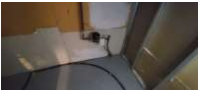
Pic. 34: Water main