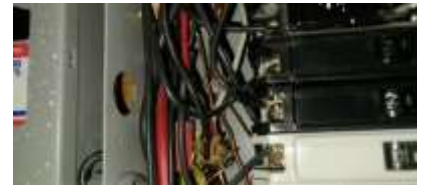
Pic. 39: Opening in panel need to be sealed