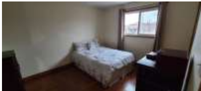
Pic. 10: Bedroom 2