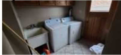
Pic. 23: Laundry