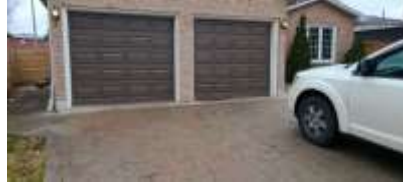
Pic. 2: Double car garage