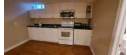
Pic. 27: Basement kitchen