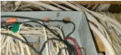
Pic. 37: Opening in panel need to be sealed