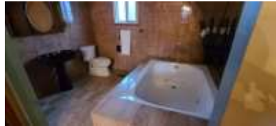
Pic. 8: Master bath