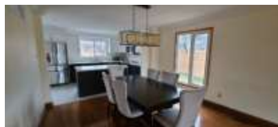
Pic. 17: Dining room