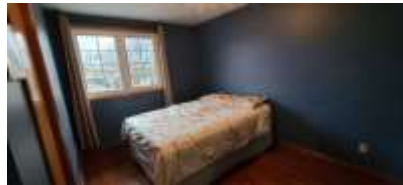
Pic. 11: Bedroom 3