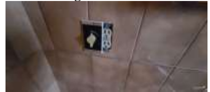
Pic. 9: Proper cover plate needed