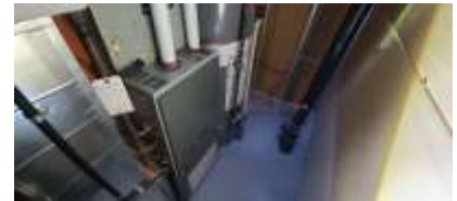
Pic. 33: Gas furnace 2013