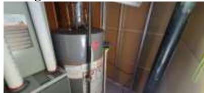
Pic. 32: Rental hot water tank 2013