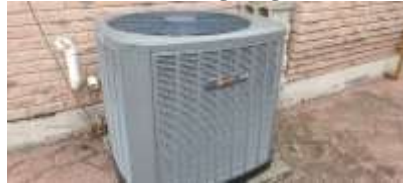
Pic. 5: AC unit 2013