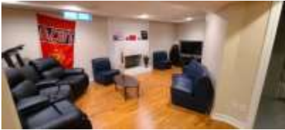
Pic. 25: Rec room