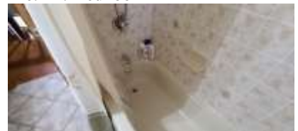
Pic. 15: 2 nd floor bath