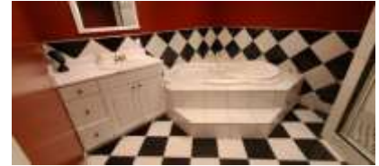
Pic. 30: Basement bath