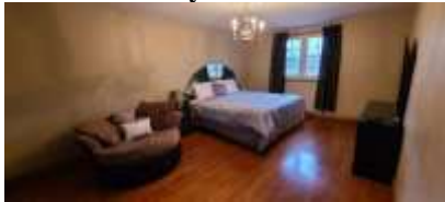
Pic. 7: Master bedroom