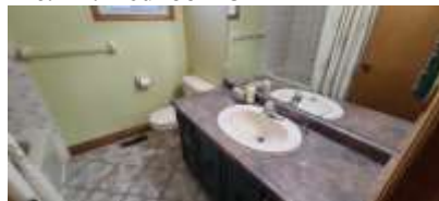
Pic. 14: 2 nd floor bath