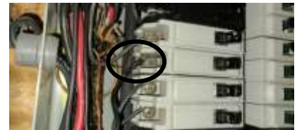
Pic. 36: Signs of overheating at breaker