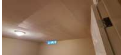
Pic. 29: Repairs completed on ceiling in bedroom 5