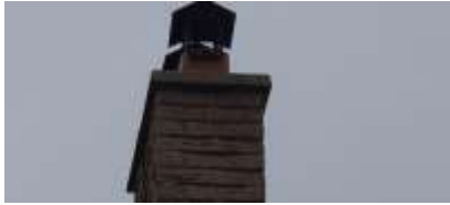
Pic. 4: Chimney