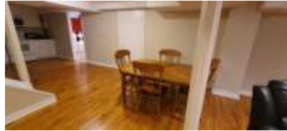
Pic. 26: Rec room