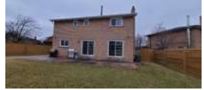
Pic. 3: Back view