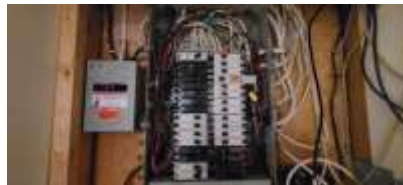
Pic. 35: 100-amp breaker panel