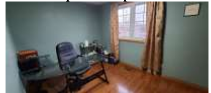
Pic. 12: Bedroom 4